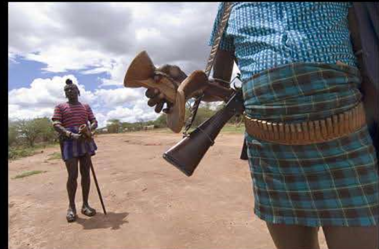
Dimeka area, Hammer people 120