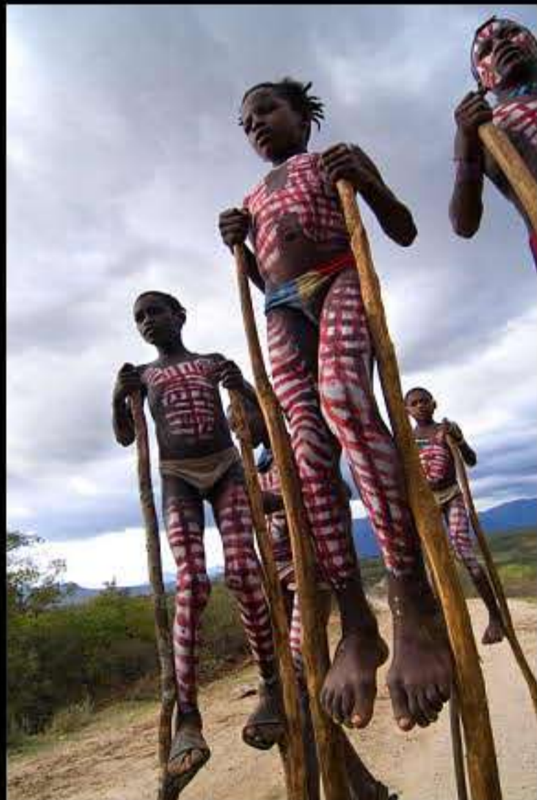
Key After, banna boys 006