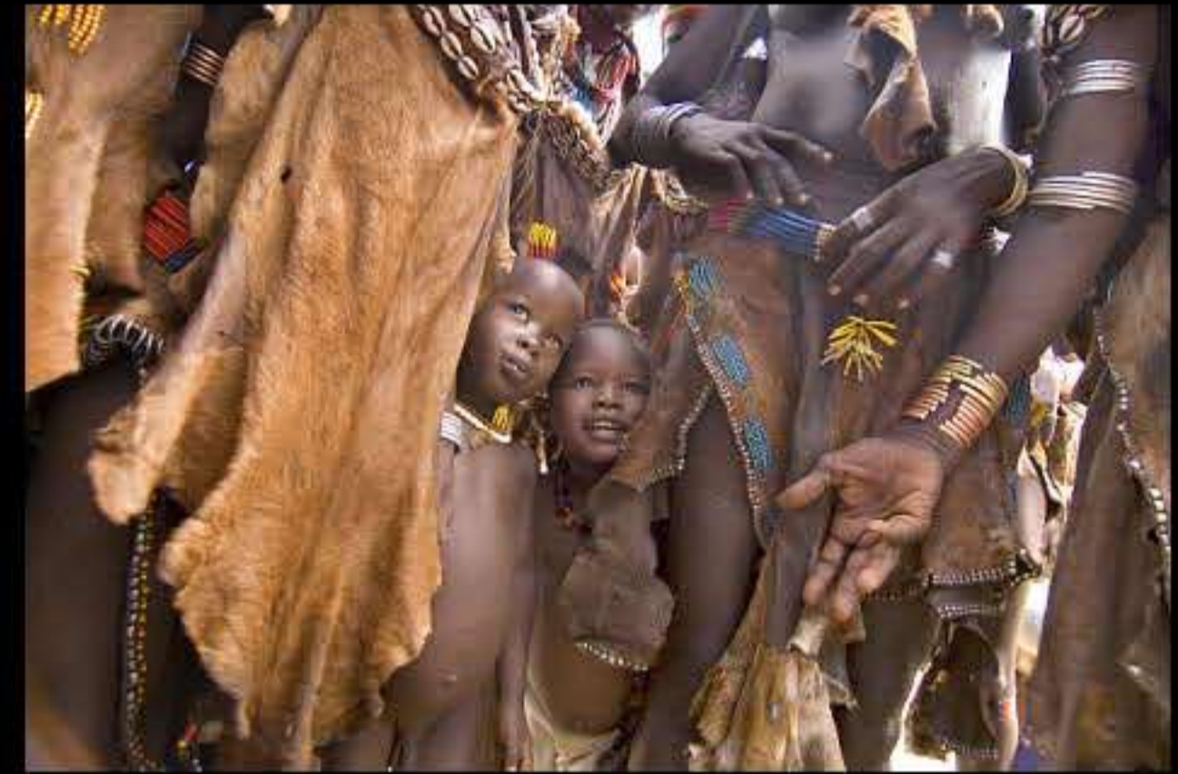
Turmi market (hammer people) 028