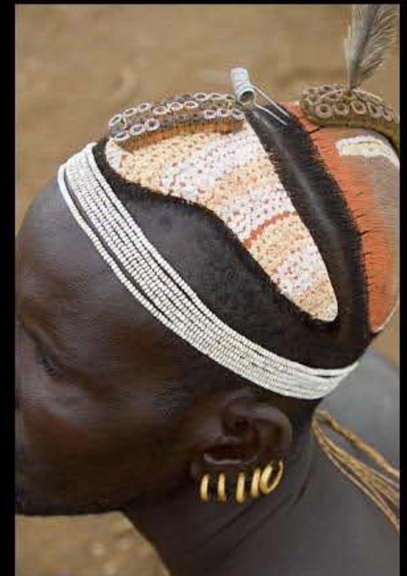
Omorate (dassanech people) 036