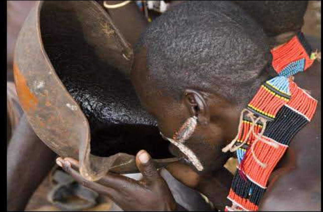
Turmi, bull jamping (hammer) 105