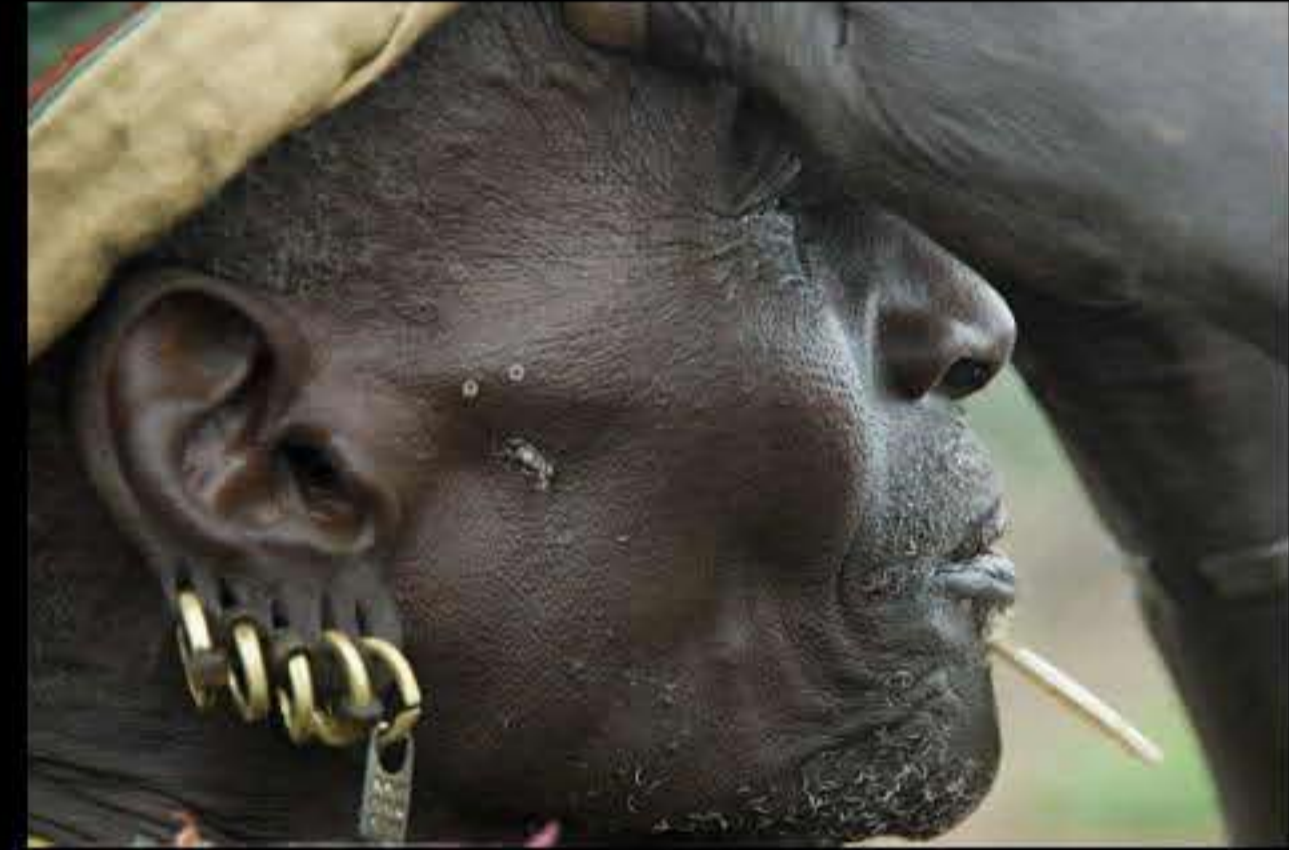
Omorate (dassanech people) 025