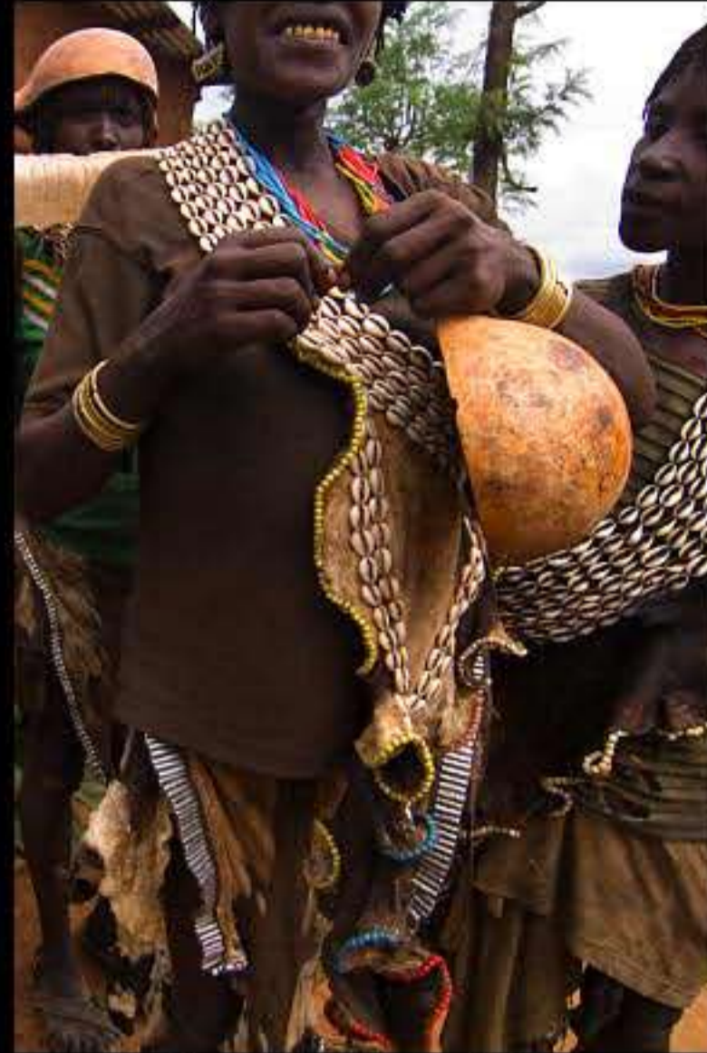
Key After, market 213