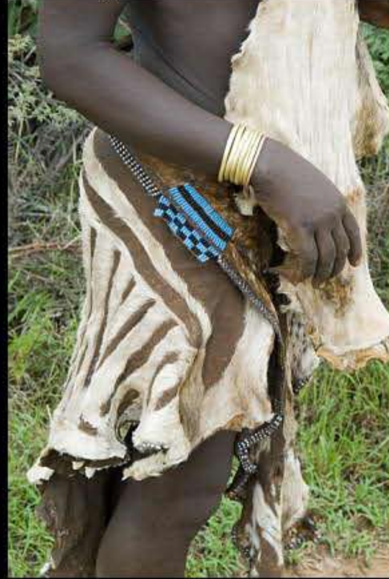
Dimeka area, Hammer people 051