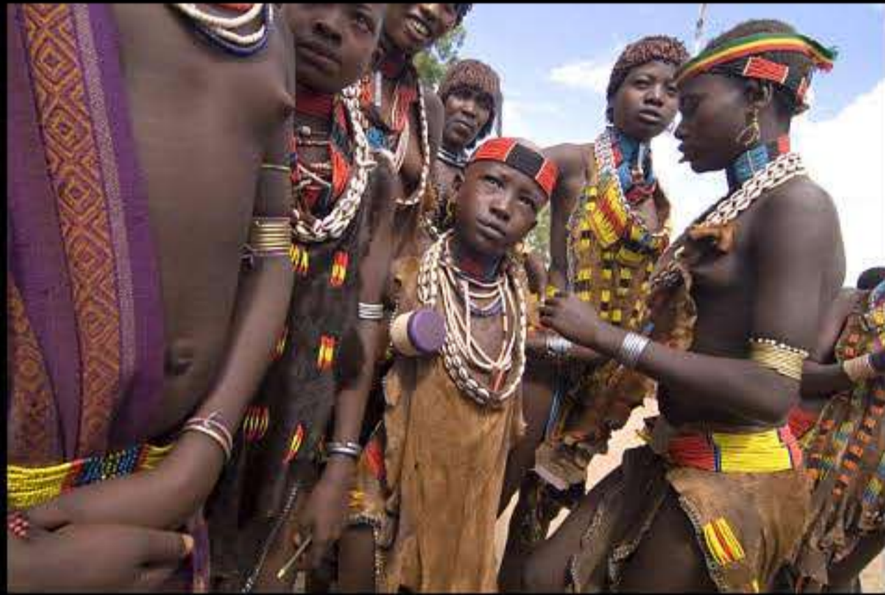
Turmi market (hammer people) 024