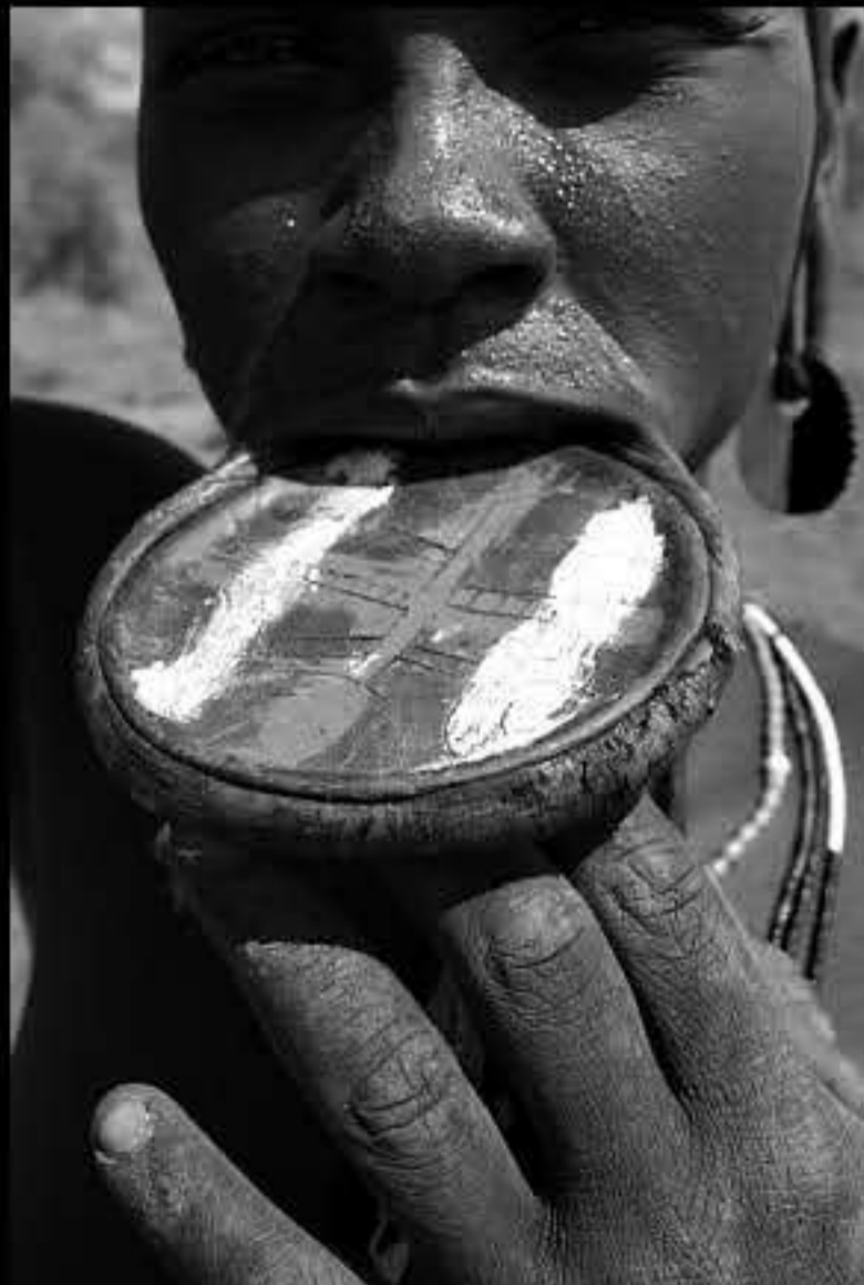
Mago park, mursi people 044