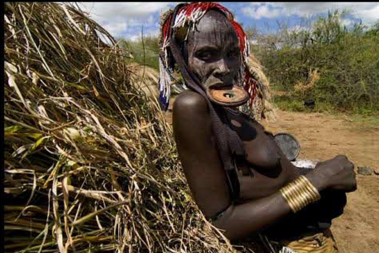
Mago park, mursi people 092