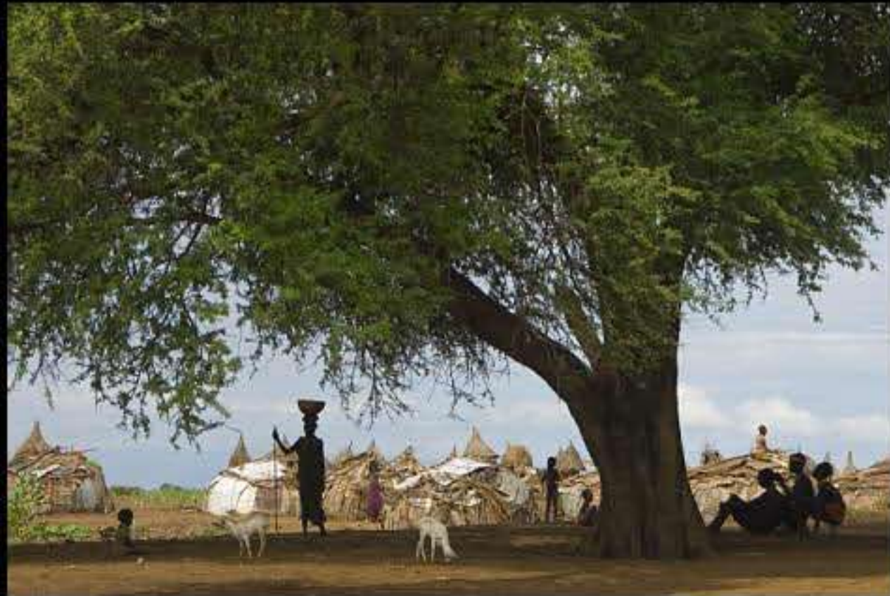
Omorate (dassanech people) 180