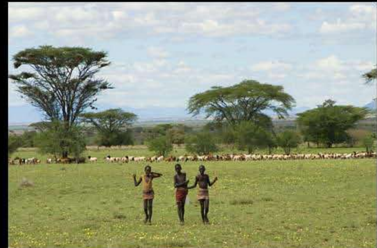
Turmi (hammer people) 049