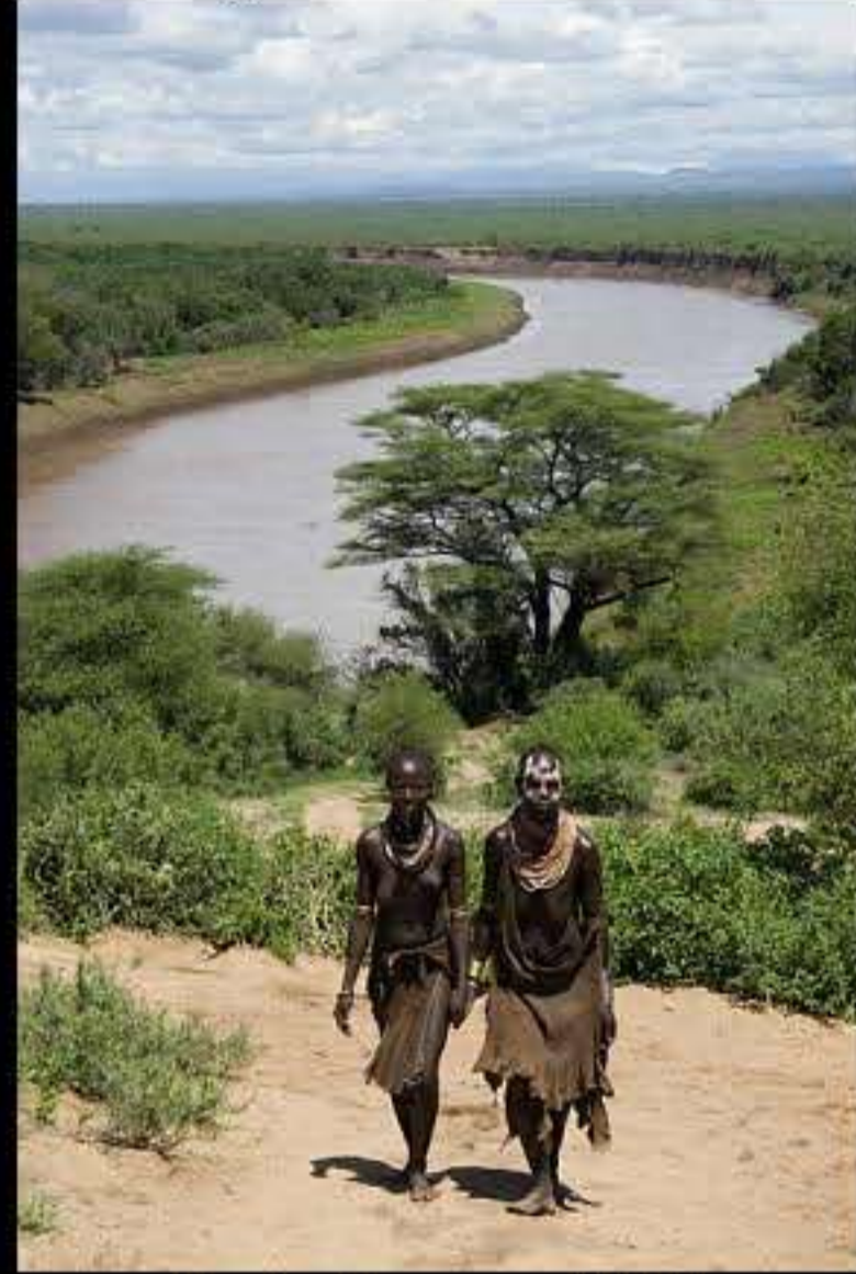
Korcho (karo people) 049