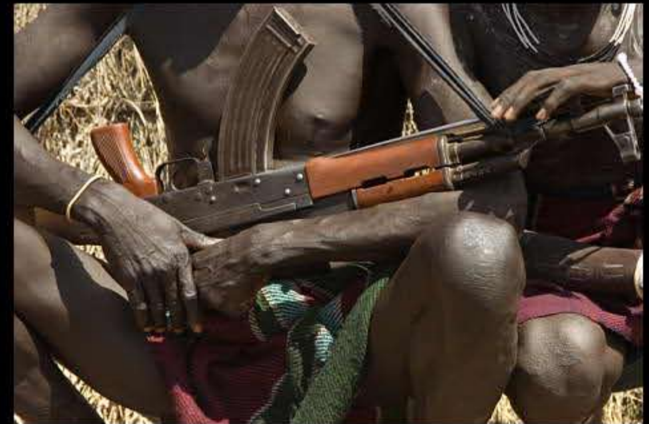
Mago park, mursi people 100