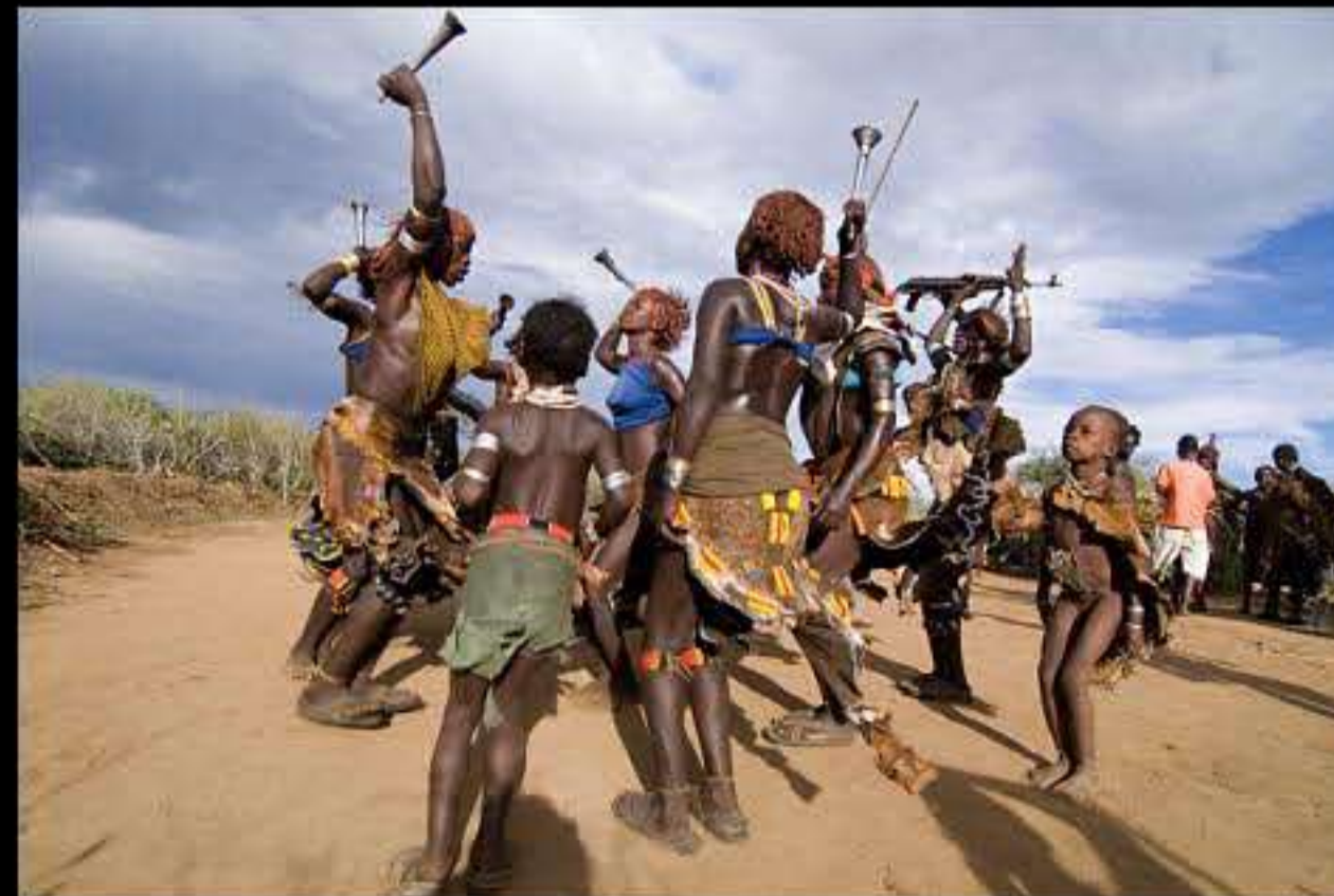
Turmi, bull jamping (hammer) 061