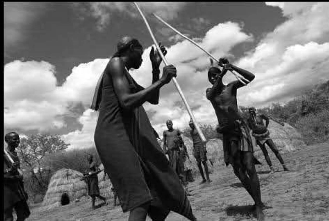
Mago park, mursi people 136