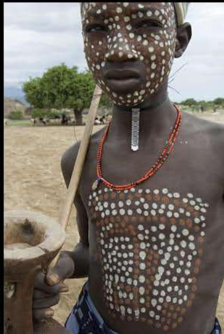
Woito valley (erbore people) 007