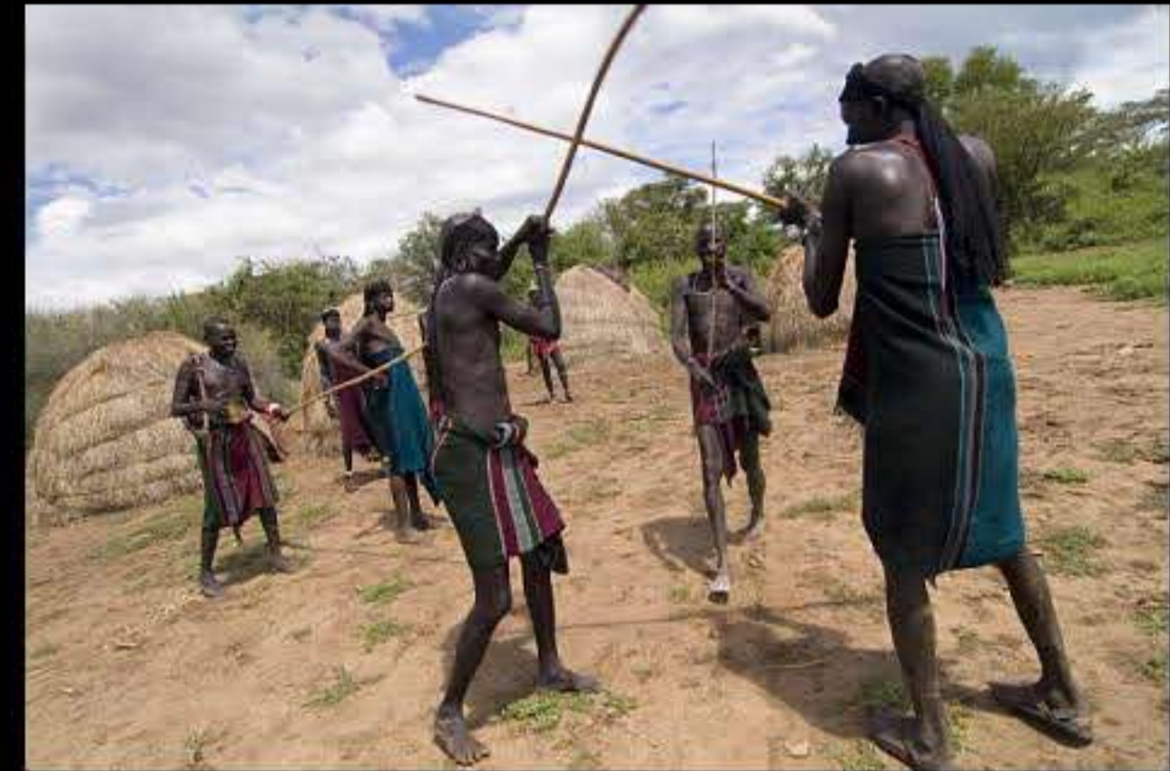
Mago park, mursi people 128