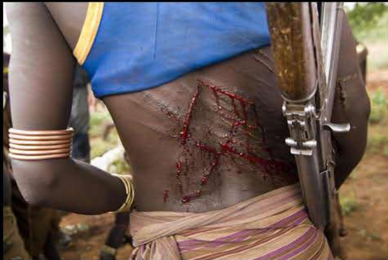
Dimeka, bull jamping (hammer) 064