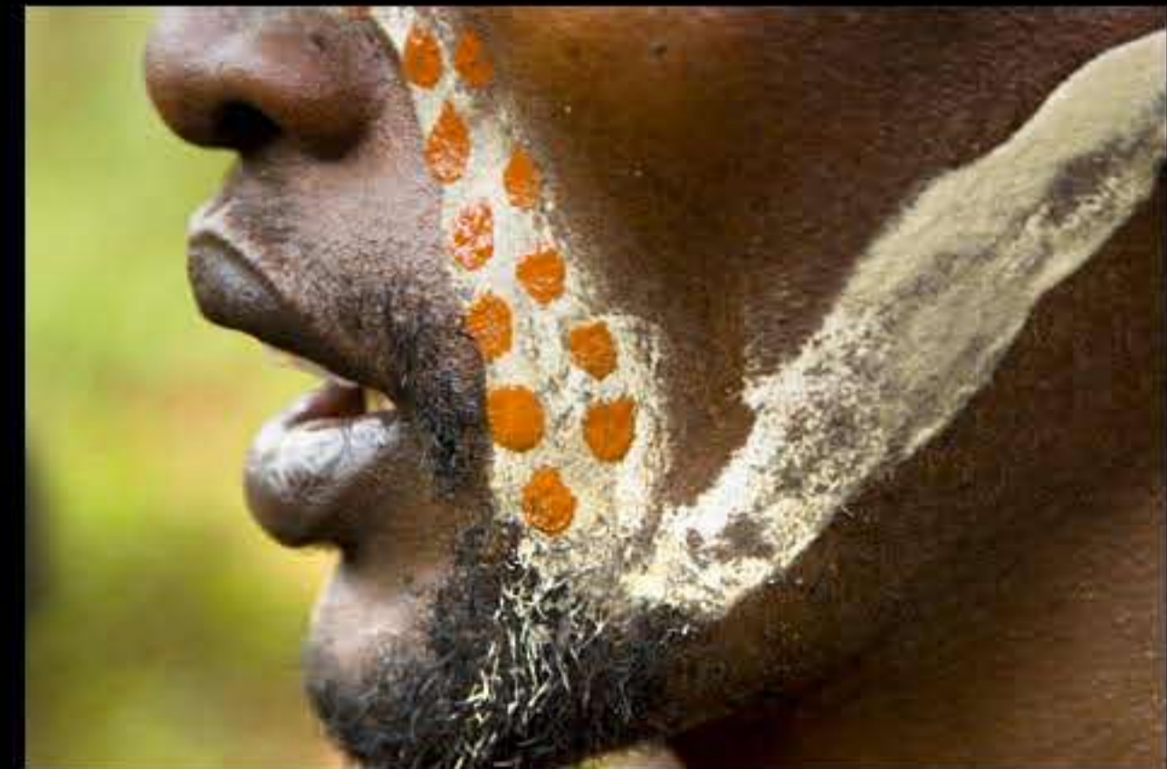
Dimeka, bull jamping (hammer) 069