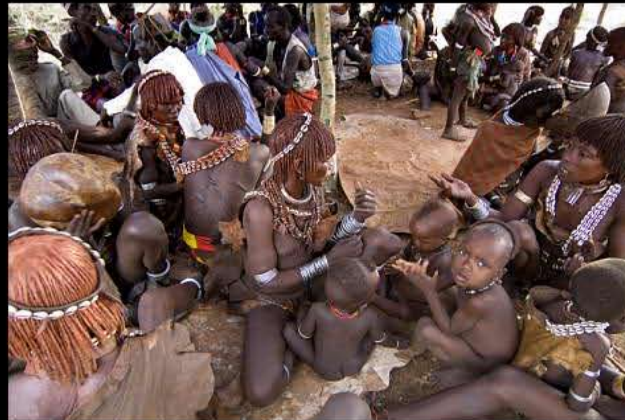
Turmi, bull jamping (hammer) 121