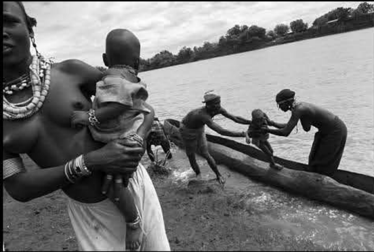
Omorate (dassanech people) 159