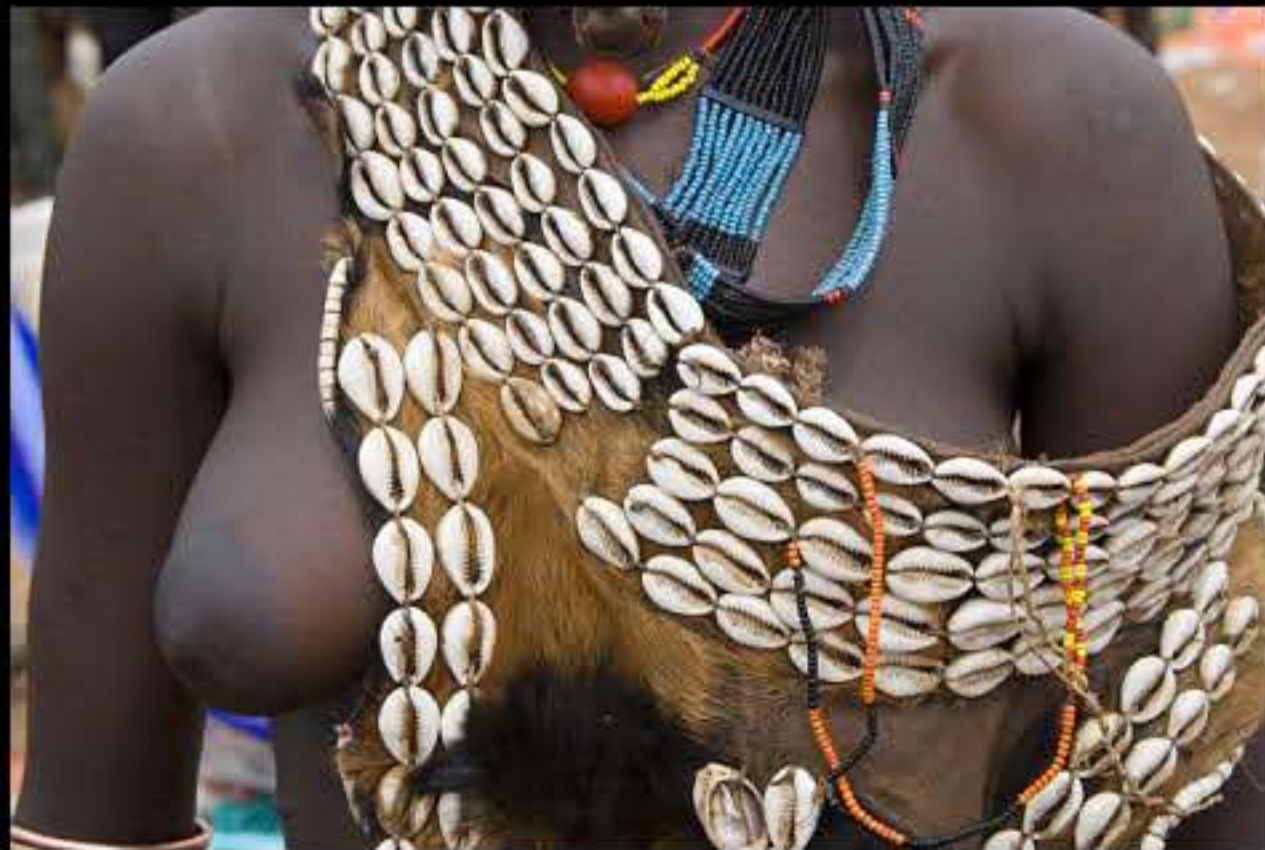
Dimeka, market (hammer people) 018