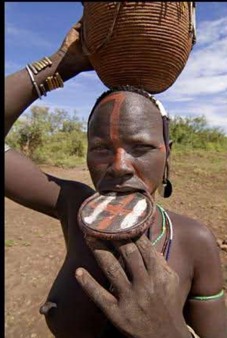
Mago park, mursi people 045