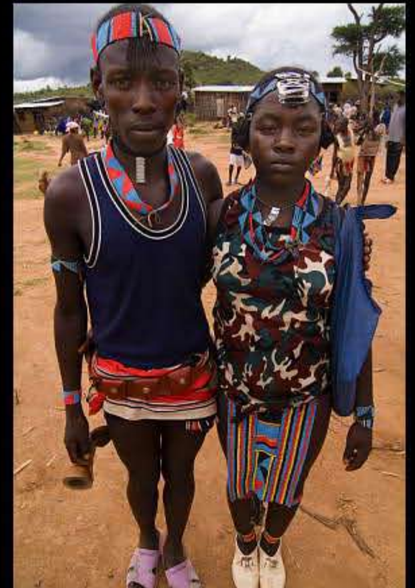
Key After, market 125