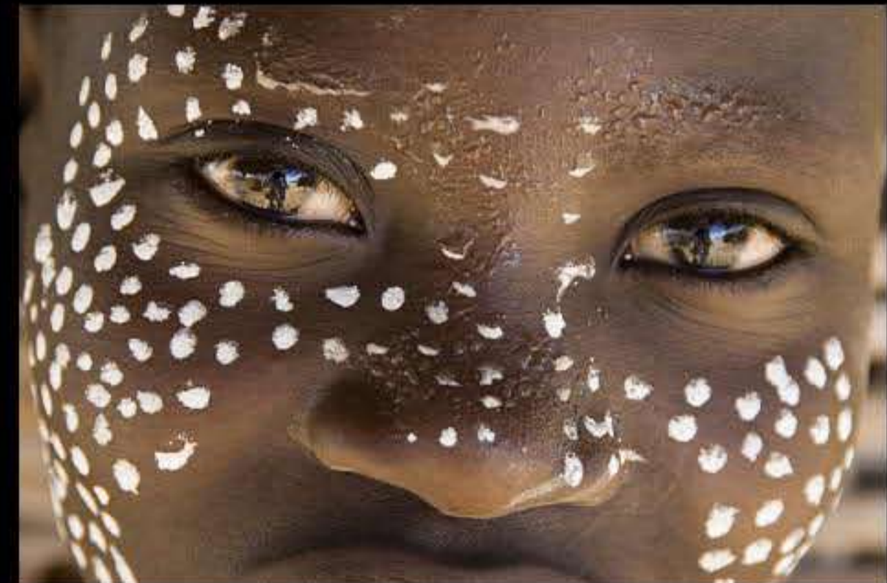
Korcho (karo people) 041