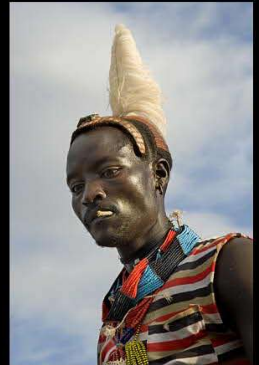
Turmi, bull jamping (hammer) 144