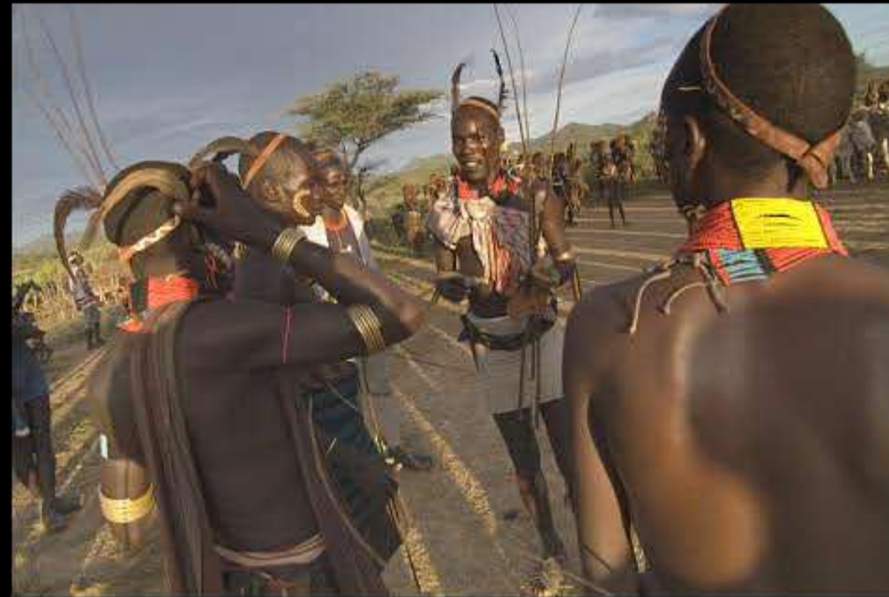
Turmi, bull jamping (hammer) 171