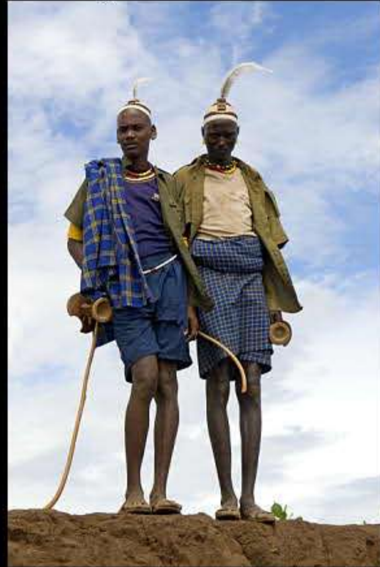
Omorate (dassanech people) 163