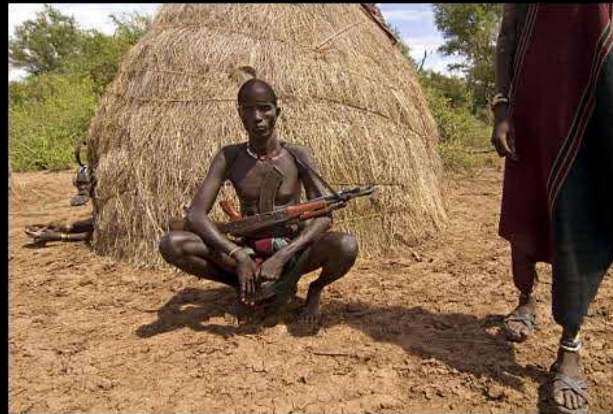
Mago park, mursi people 094