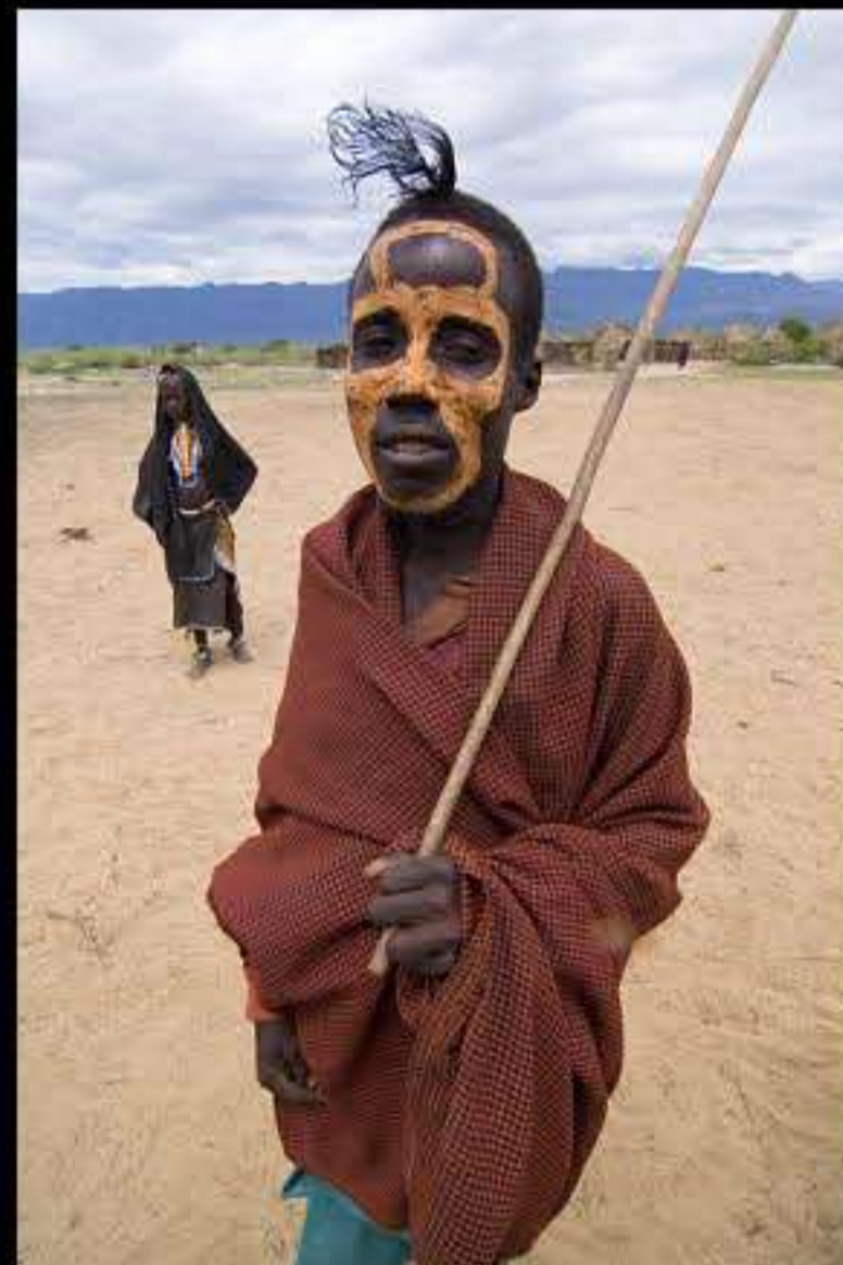
Woito valley (erbore people) 088