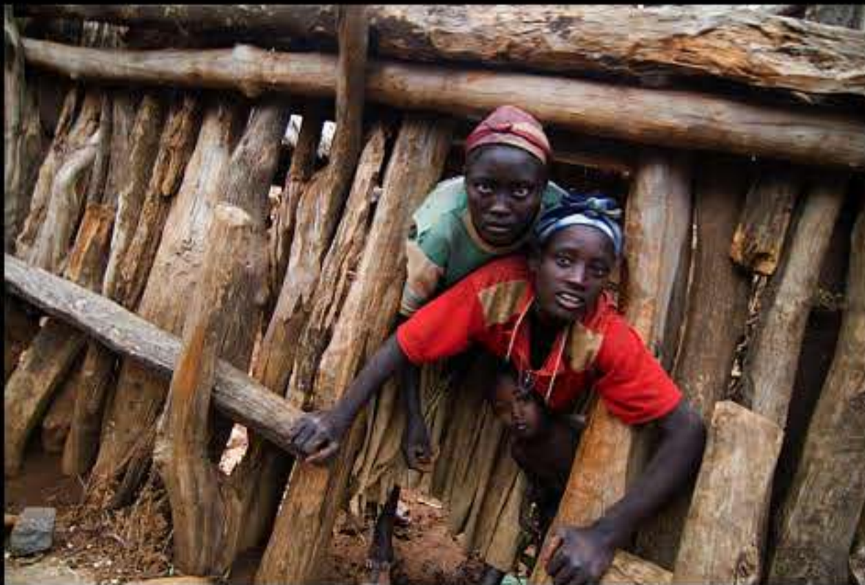
Konso, New Work village (konso) 075