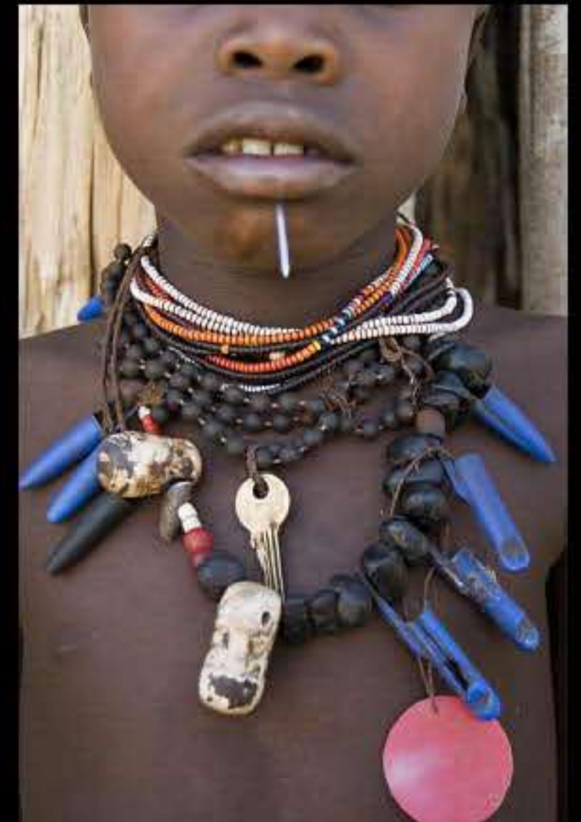
Korcho (karo people) 099