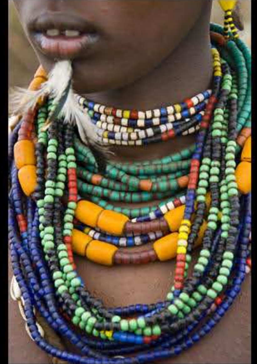
Omorate (dassanech people) 077