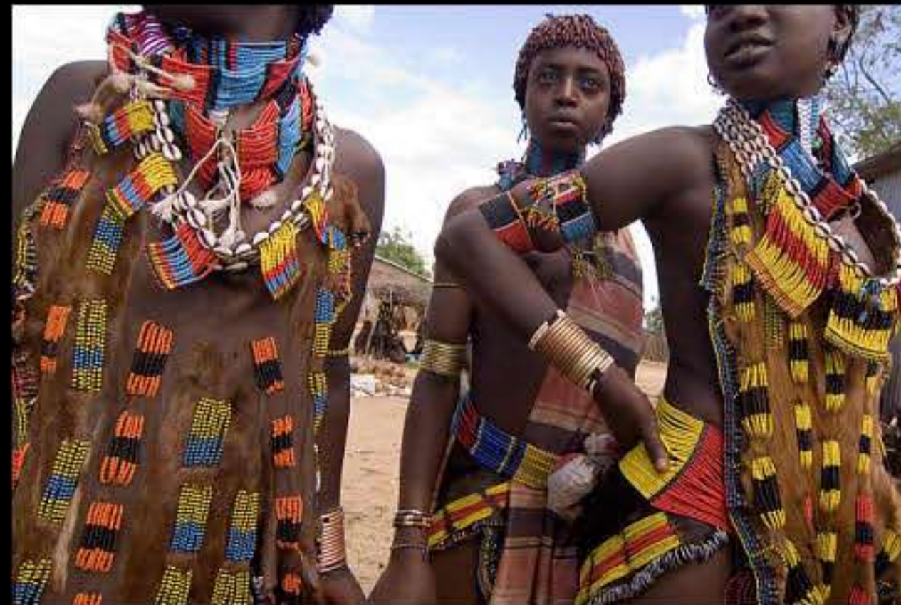
Turmi market (hammer people) 009