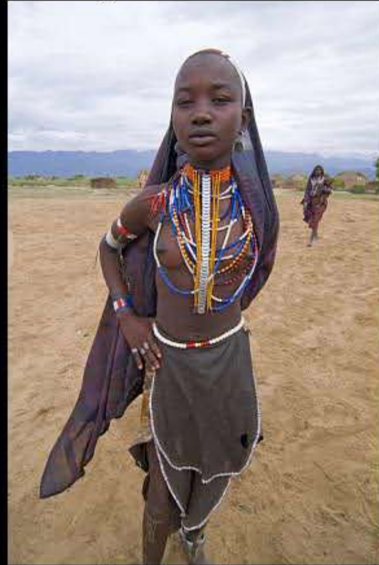
Woito valley (erbore people) 001