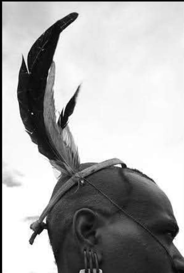
Key After, market 108