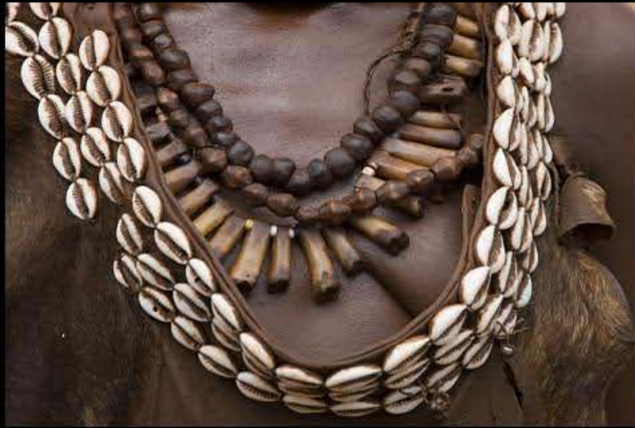
Dimeka, market (hammer people) 050