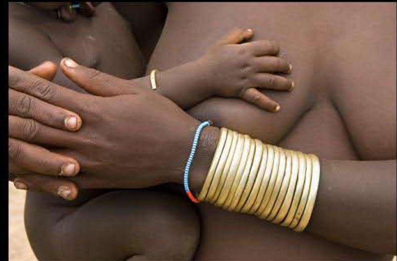
Dimeka area, Hammer people 081