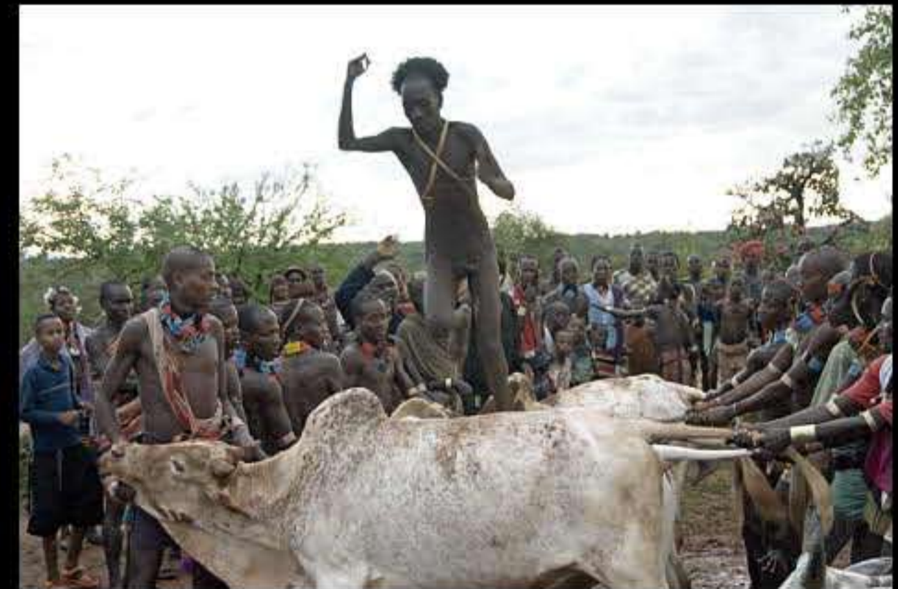
Dimeka, bull jamping (hammer) 238