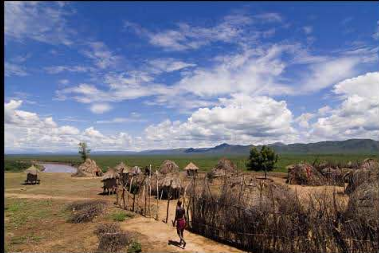
Korcho (karo people) 083