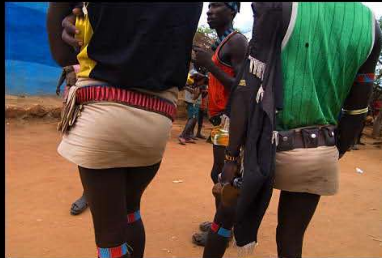
Key After, market 195