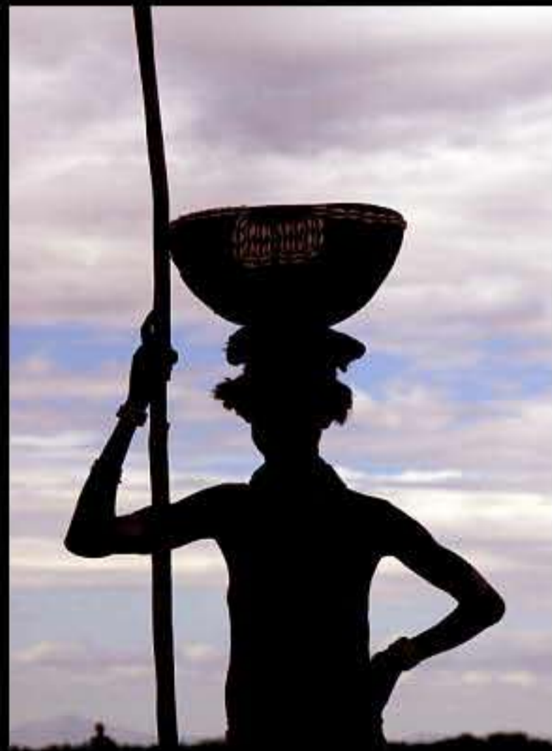
Omorate (dassanech people) 031