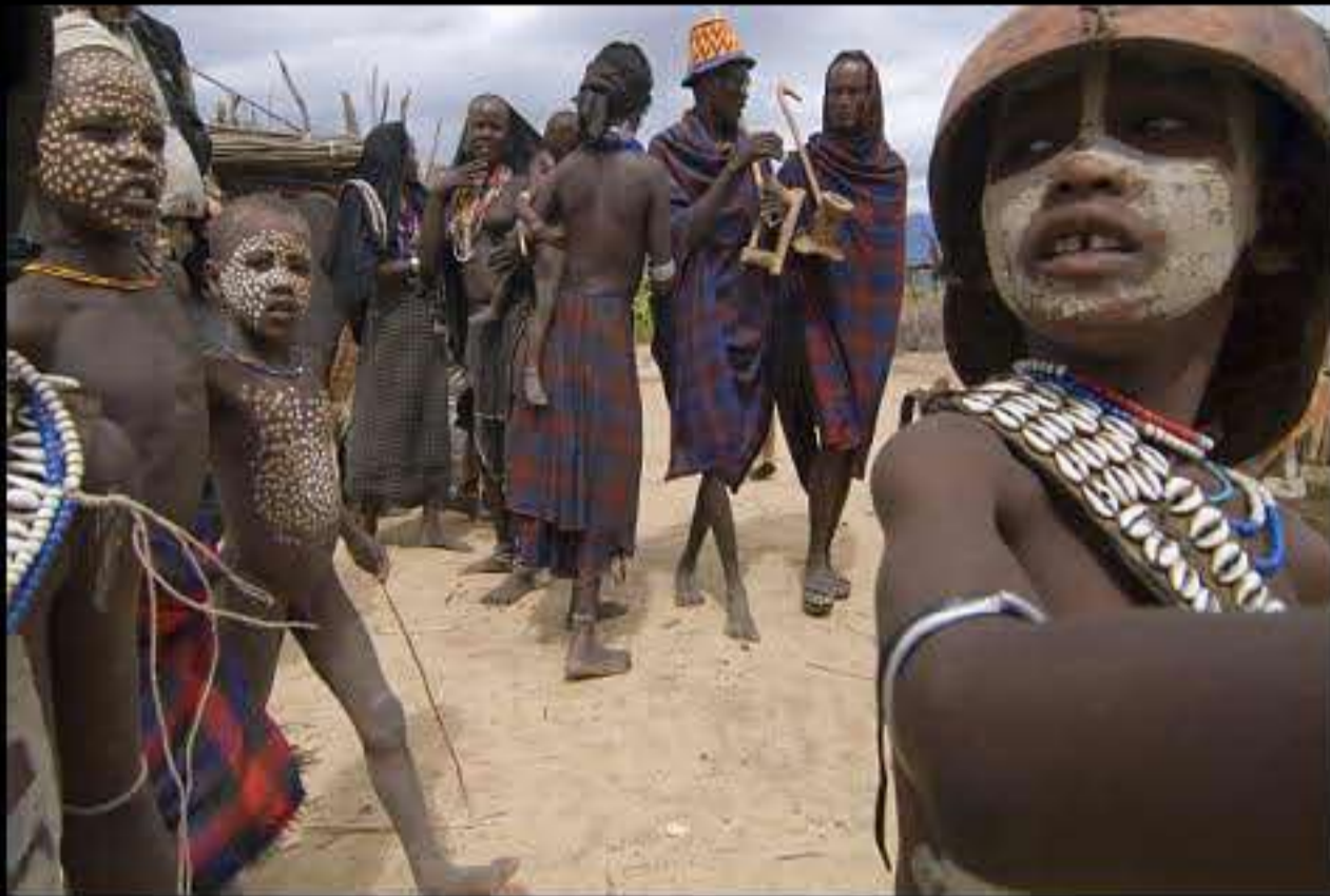
Woito valley (erbore people) 034