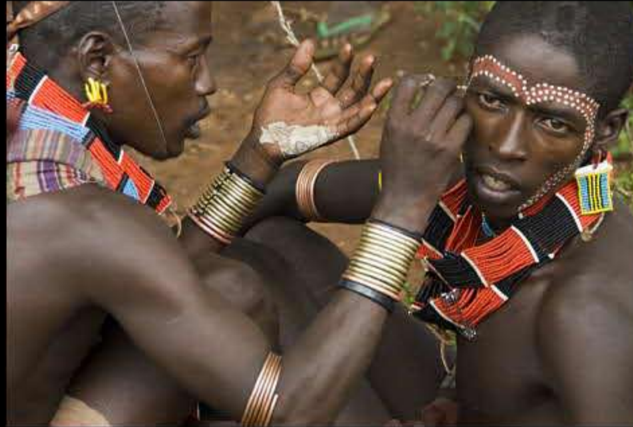
Dimeka, bull jamping (hammer) 018