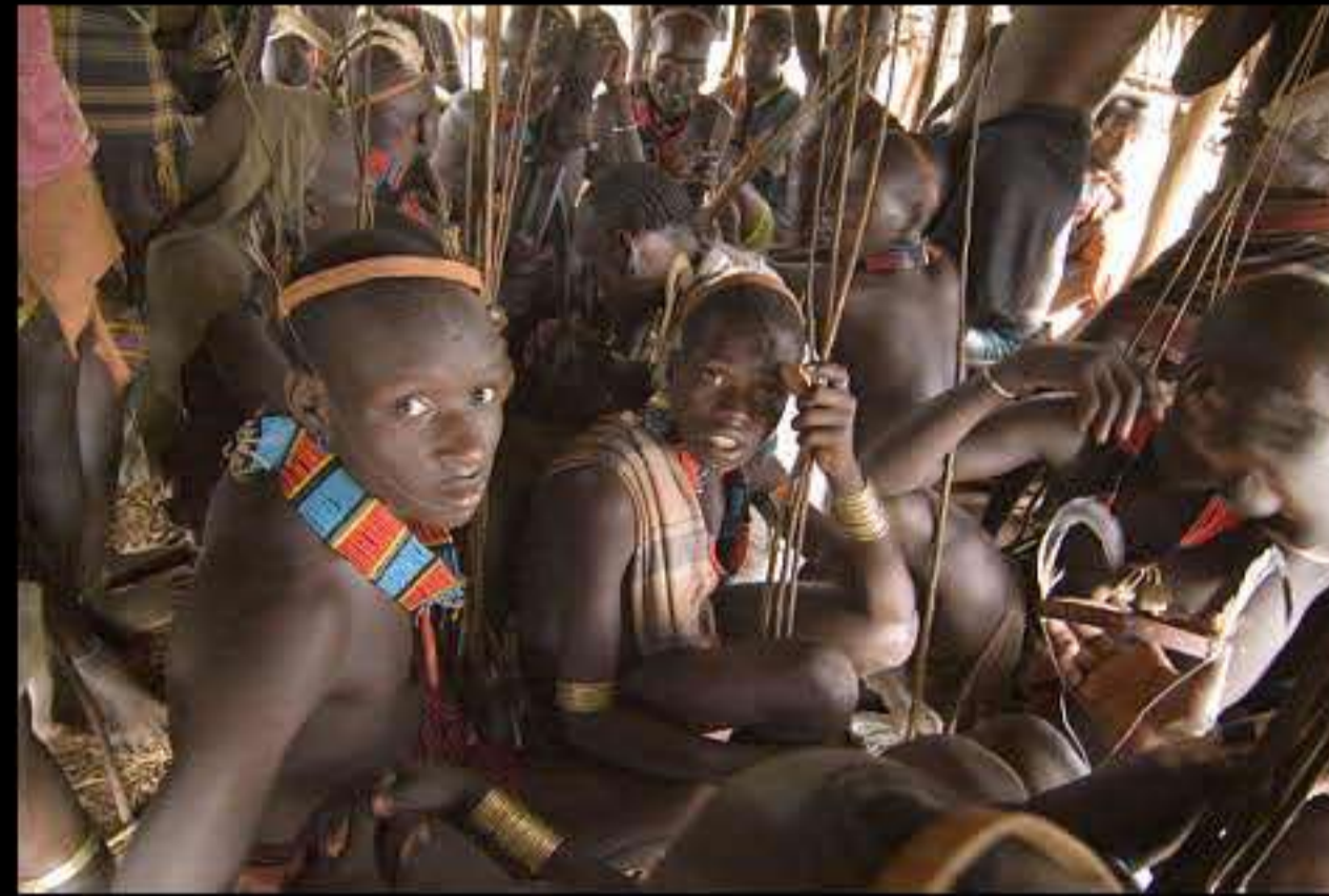
Dimeka, bull jamping (hammer) 086