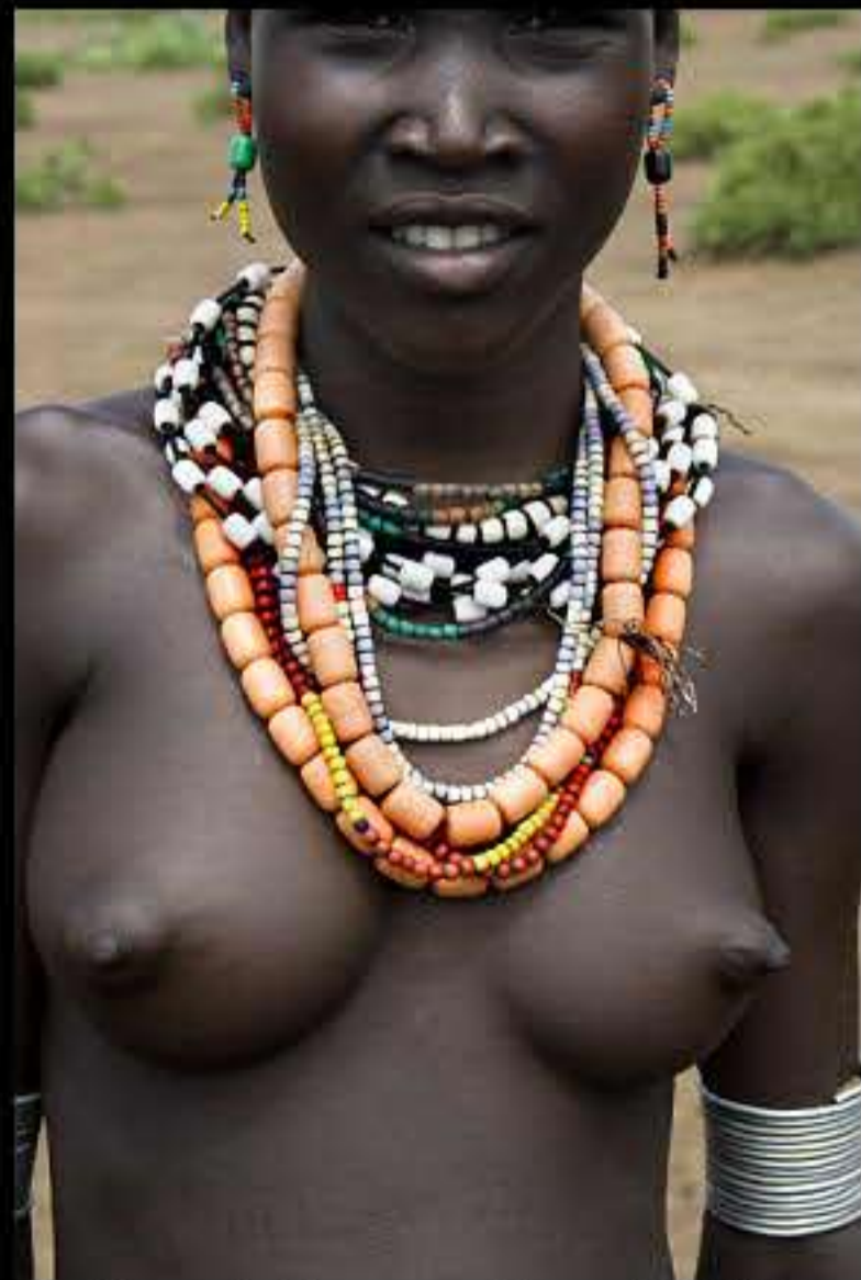
Omorate (dassanech people) 235