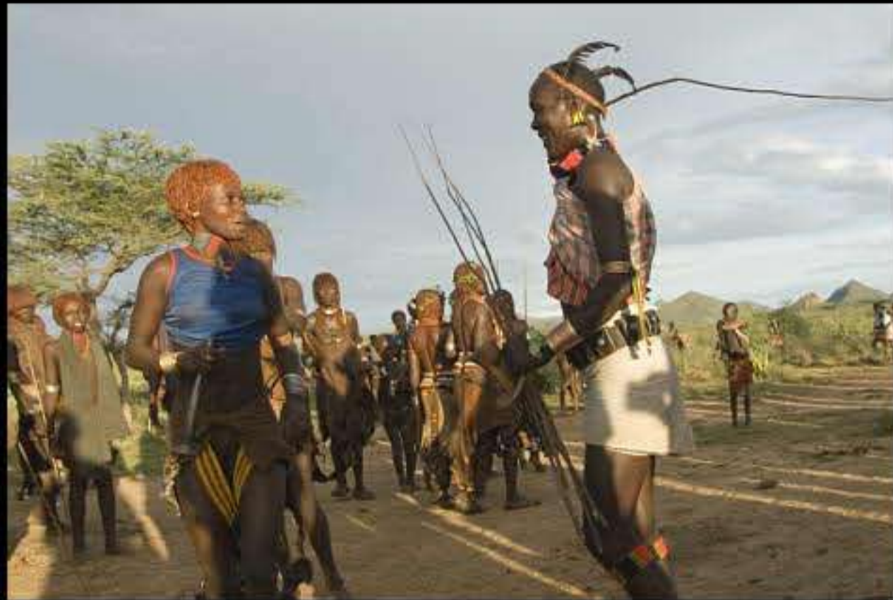
Turmi, bull jamping (hammer) 154