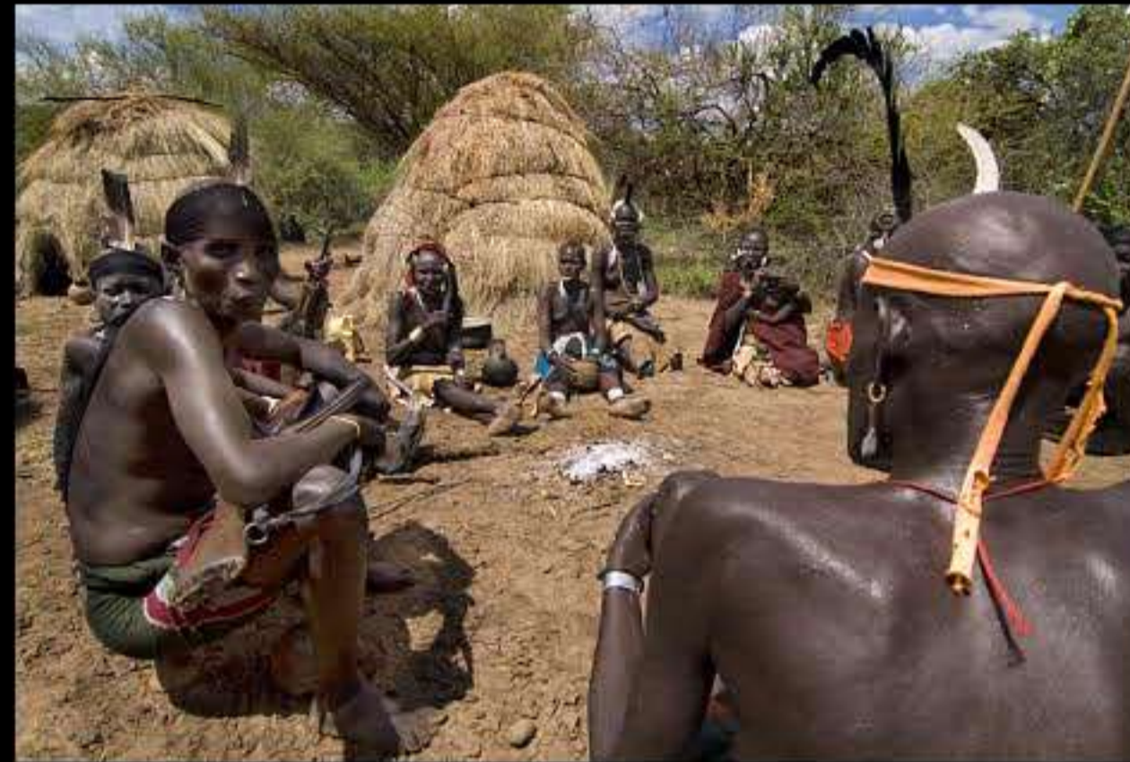
Mago park, mursi people 118