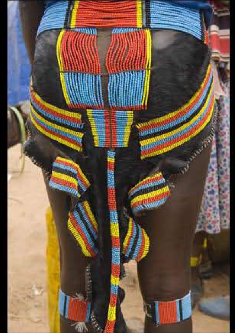
Key After, market 061