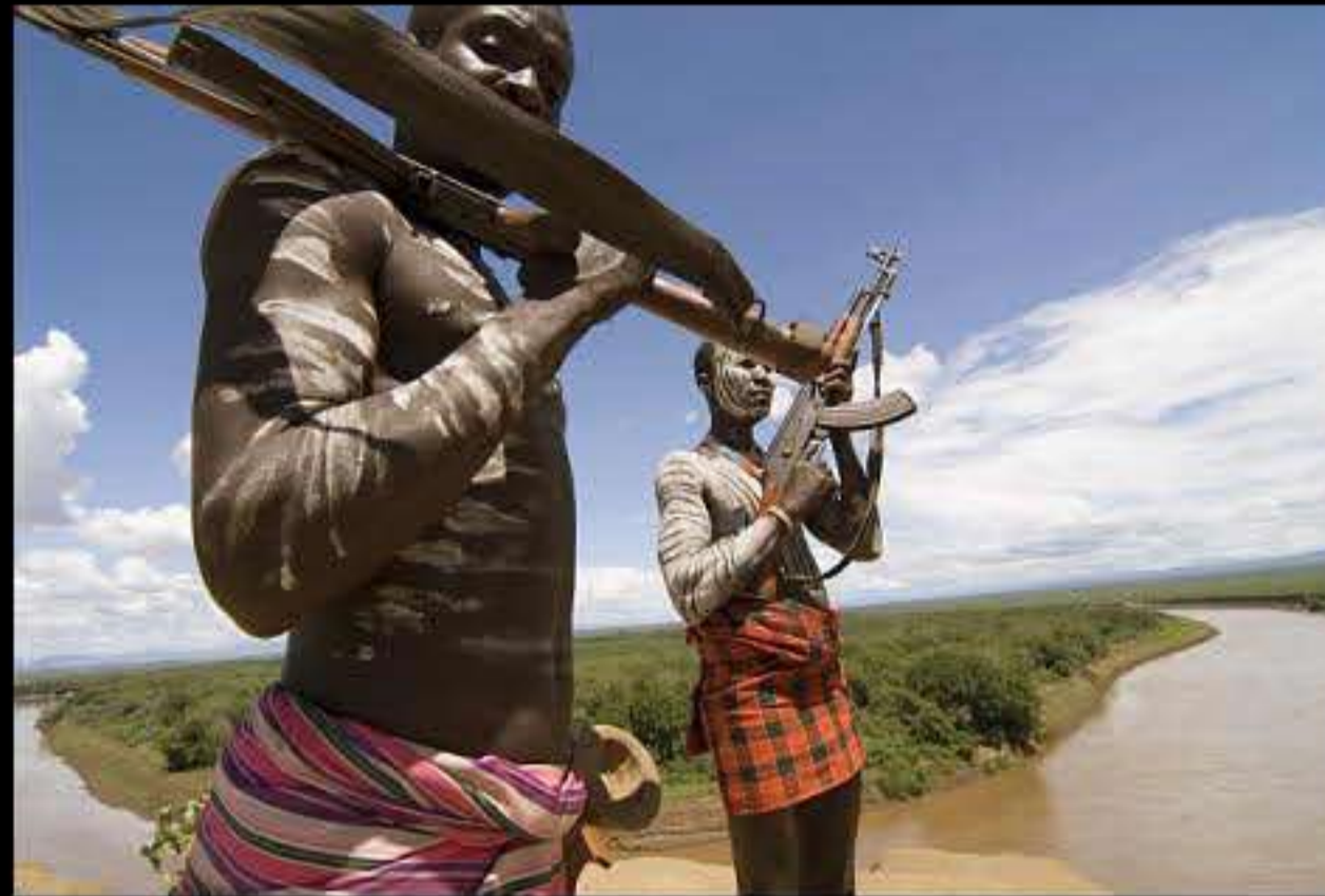
Korcho (karo people) 022