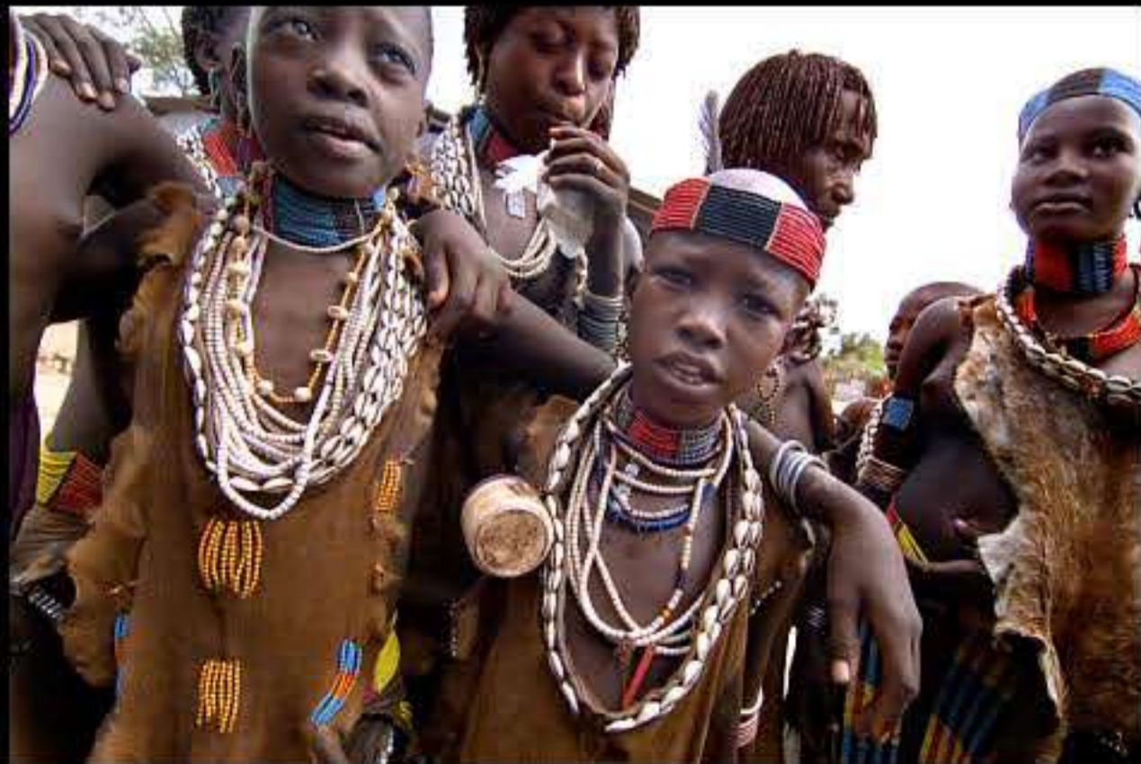
Turmi market (hammer people) 032