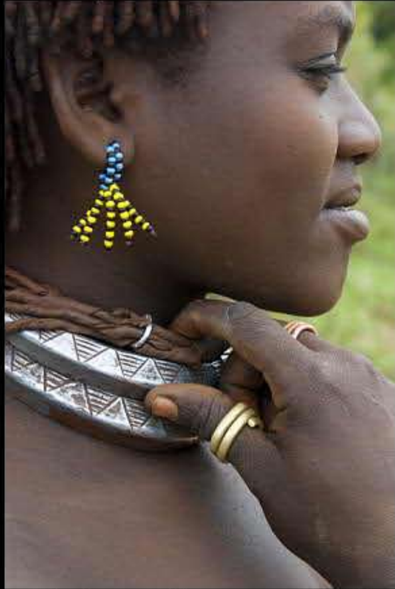
Dimeka area, Hammer people 090