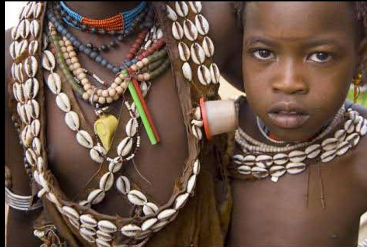
Turmi market (hammer people) 073