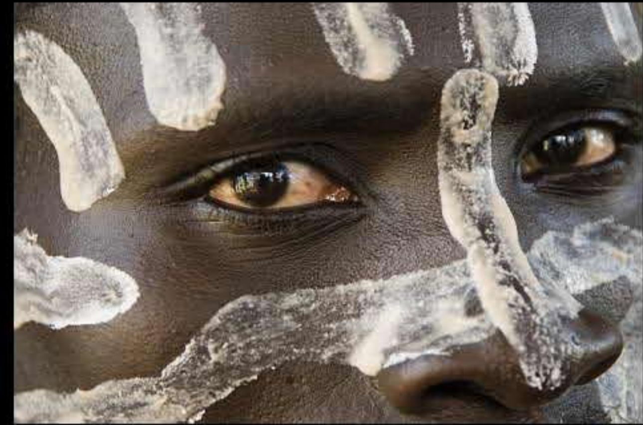
Korcho (karo people) 146