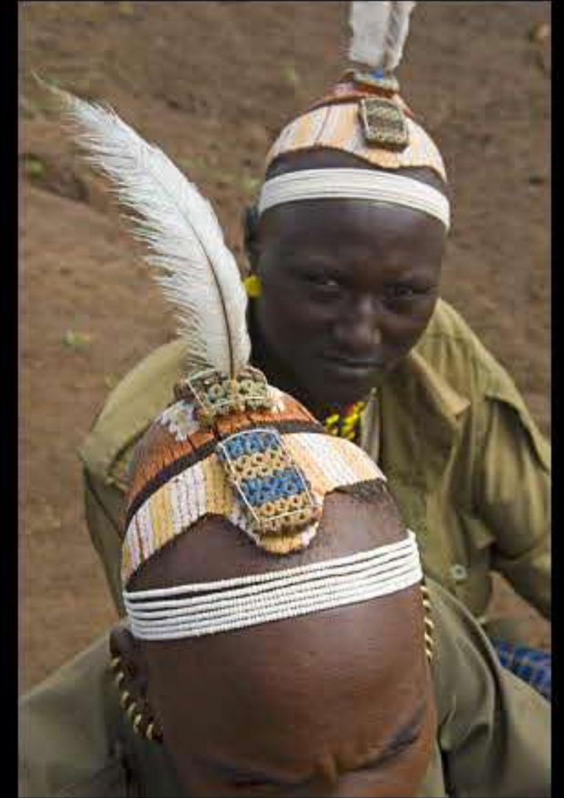
Omorate (dassanech people) 164