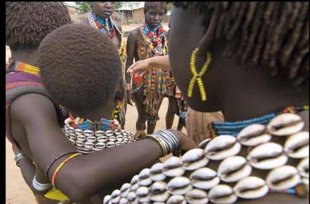
Turmi market (hammer people) 013