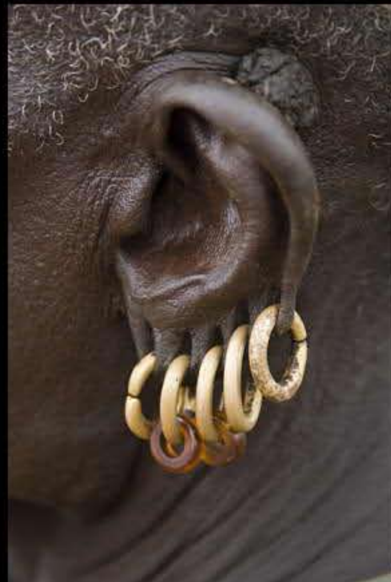
Omorate (dassanech people) 033