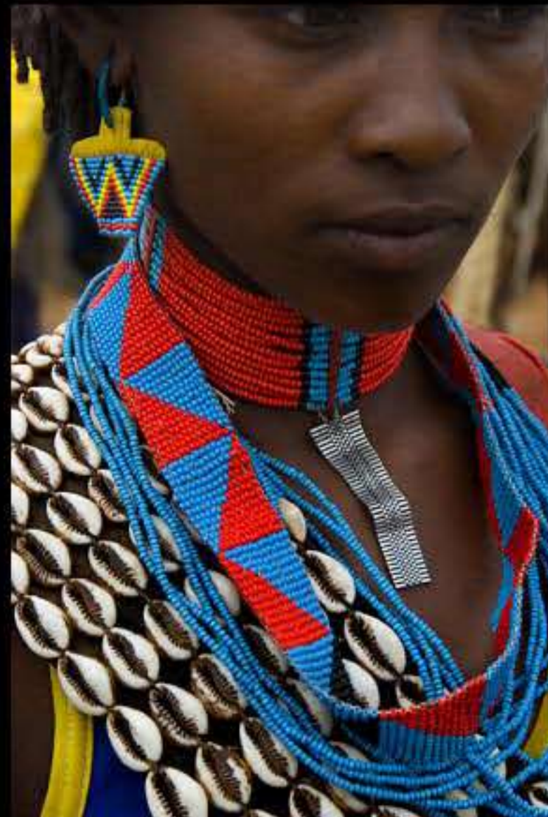
Key After, market 118