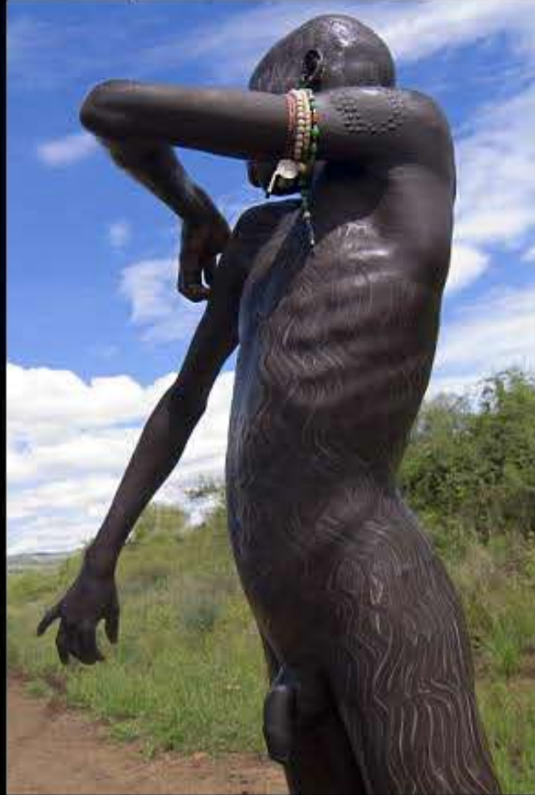
Mago park, mursi people 059