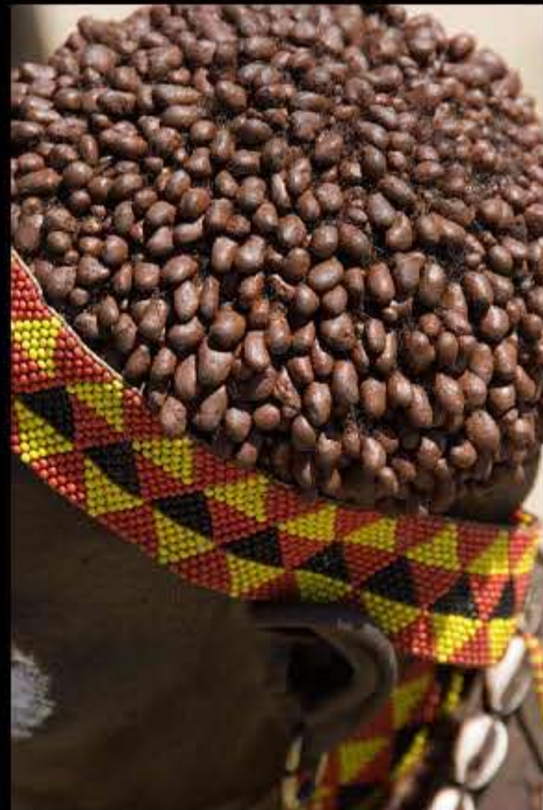
Korcho (karo people) 039