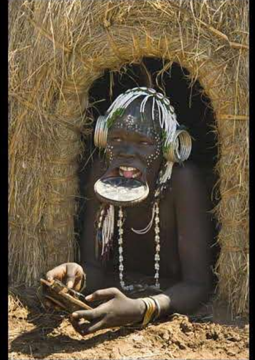
Mago park, mursi people 090