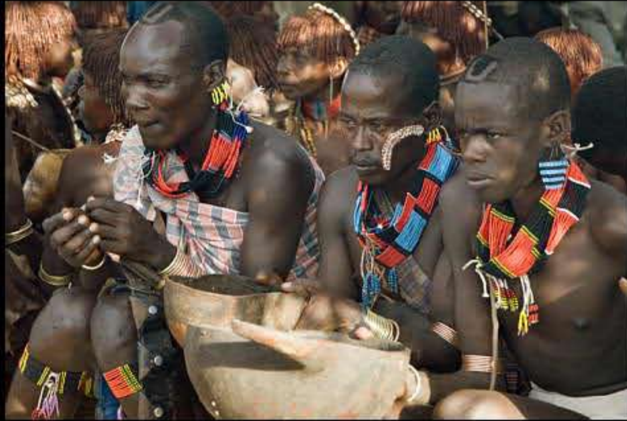
Turmi, bull jamping (hammer) 076