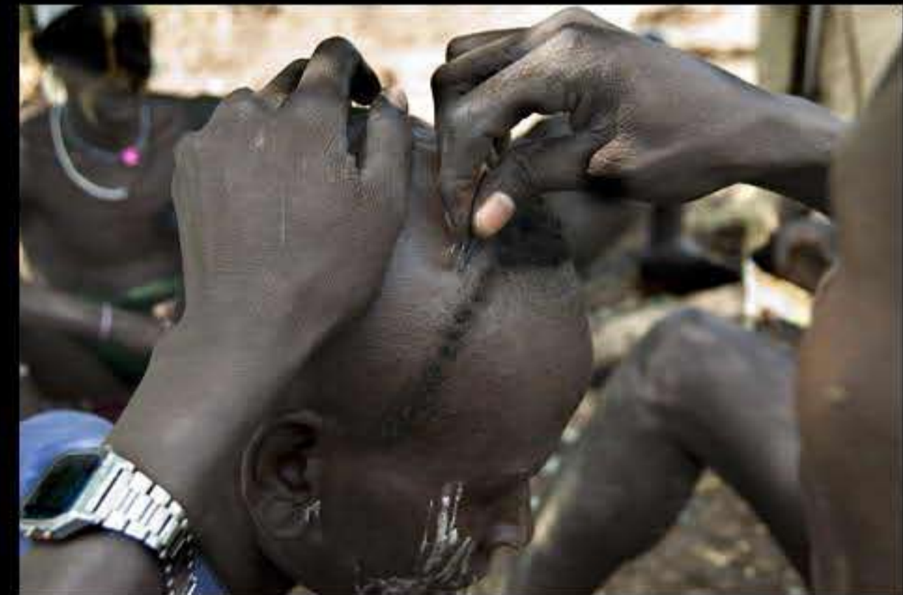
Mago park, mursi people 169