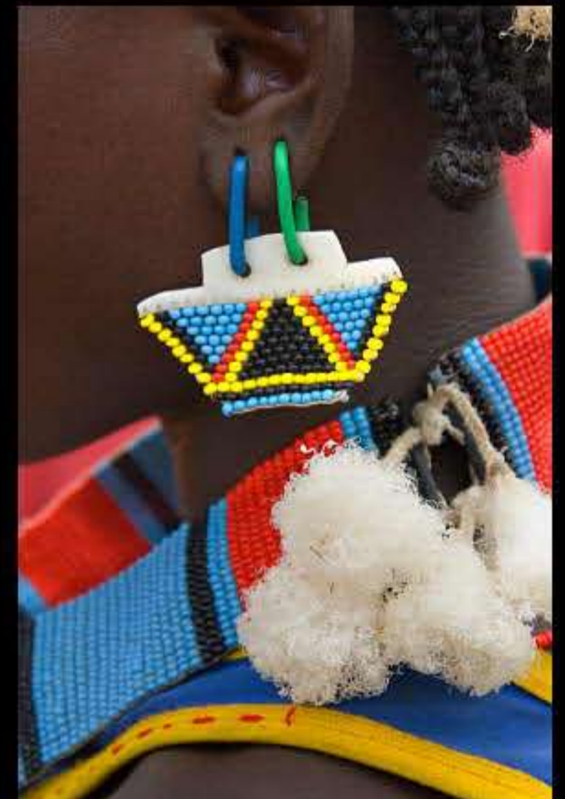
Key After, market 067