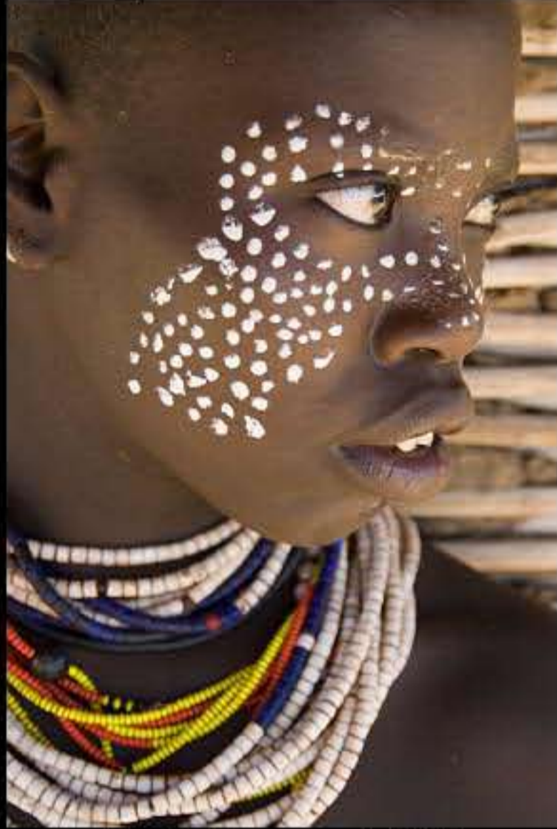
Korcho (karo people) 043