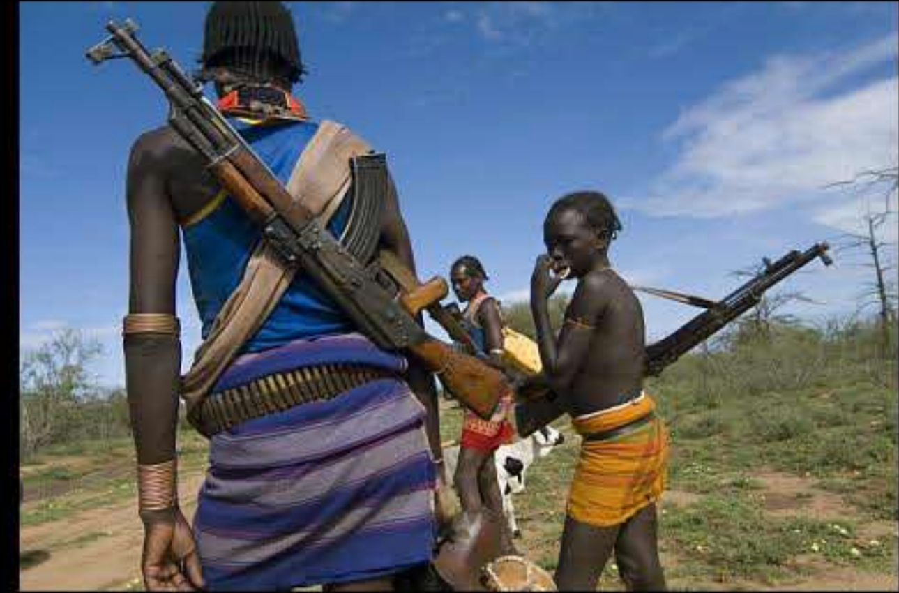
Turmi (hammer people) 008