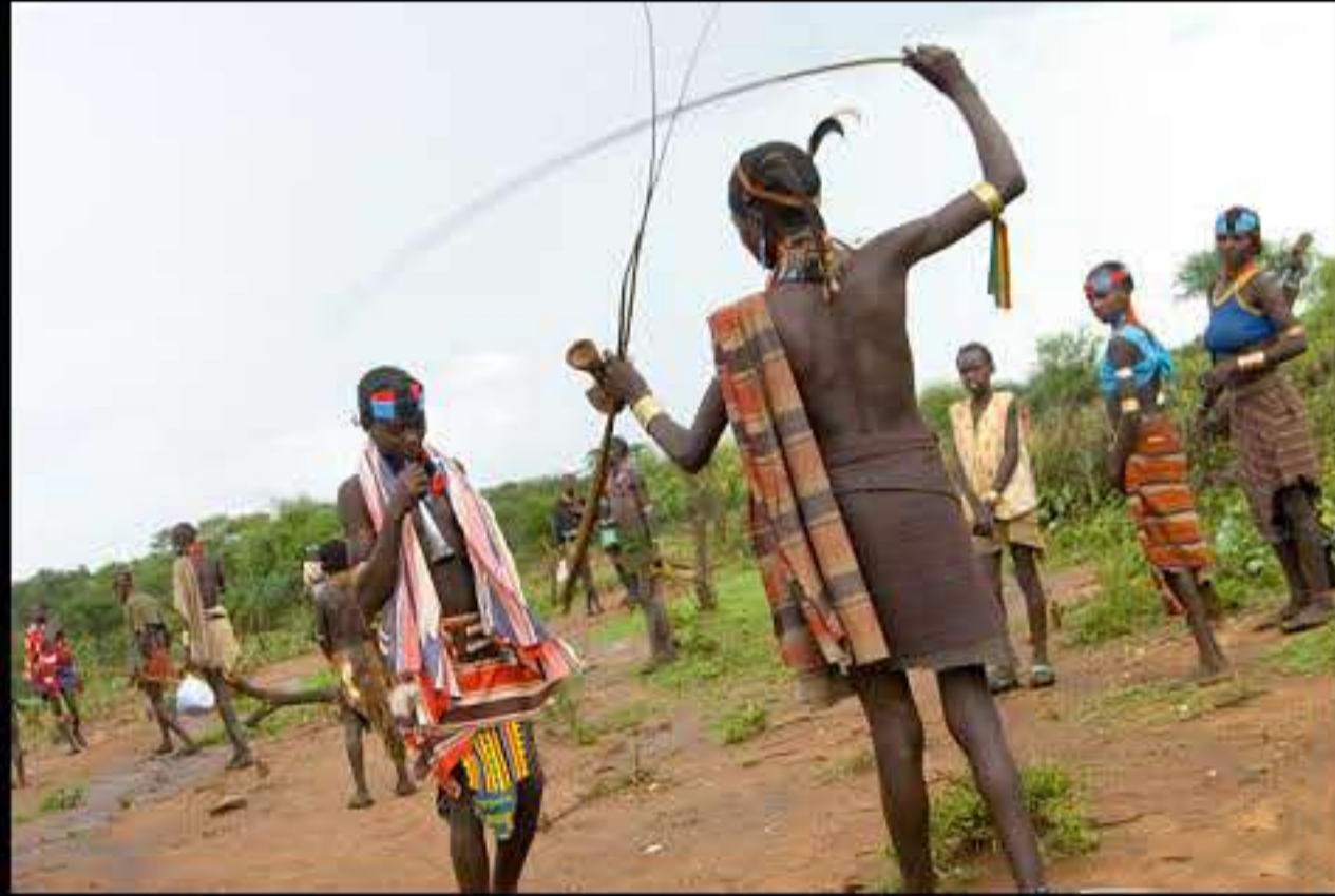
Dimeka, bull jamping (hammer) 183