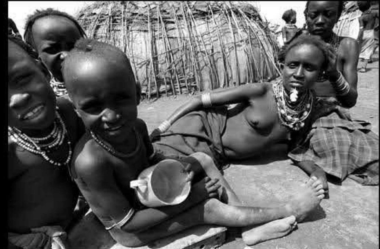
Omorate (dassanech people) 197