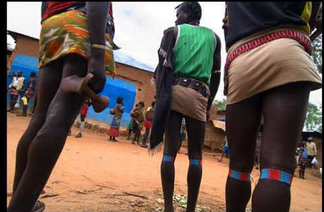
Key After, market 196