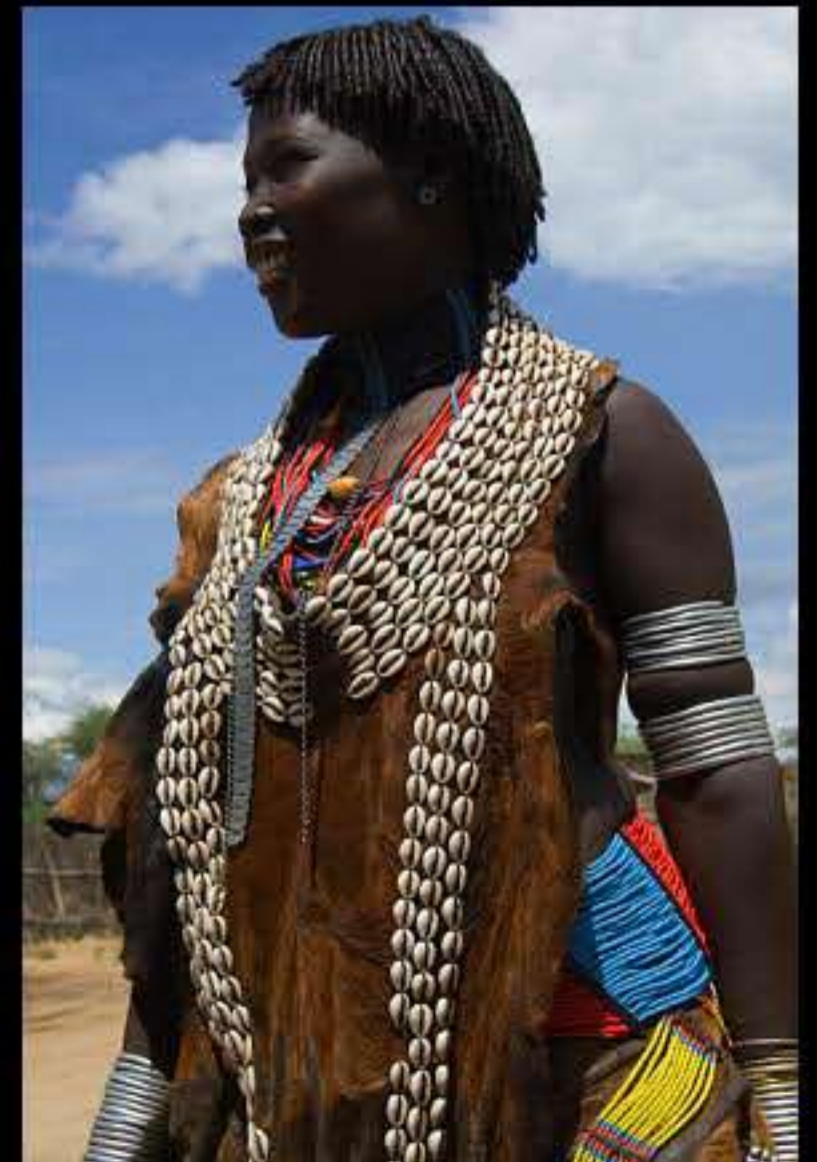
Woitto, Tsamay women 008