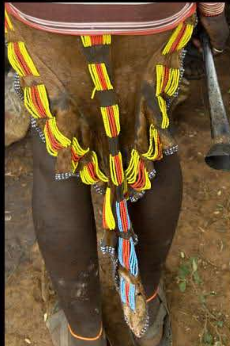
Dimeka, bull jamping (hammer) 068