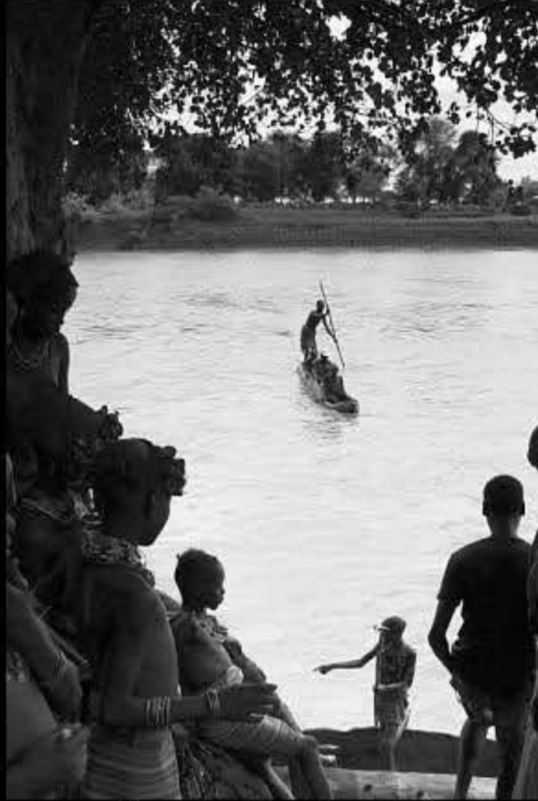
Omorate, Omo river 021