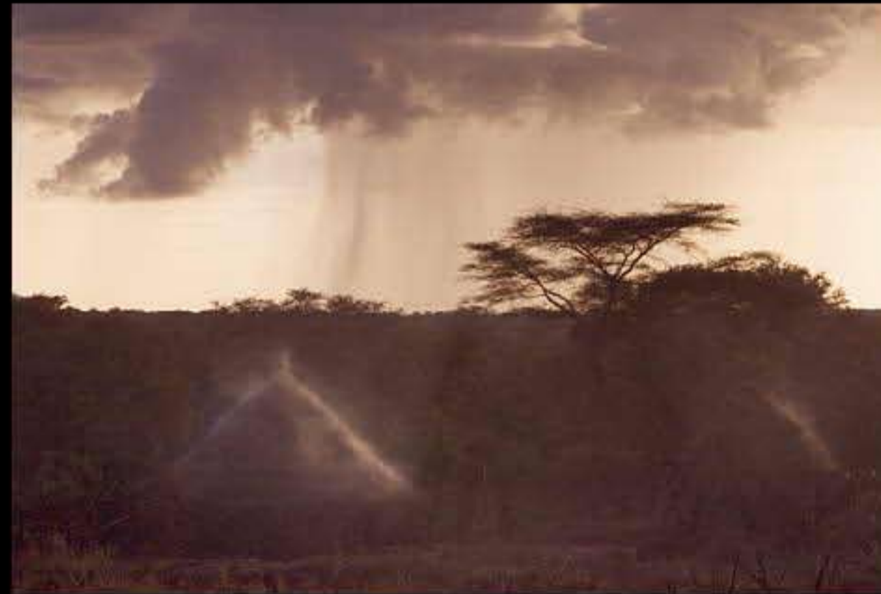
Dimeka, hammer village 017