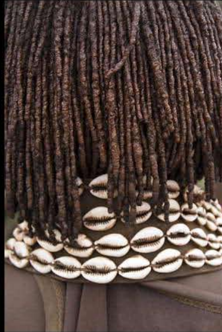
Dimeka area, Hammer people 095