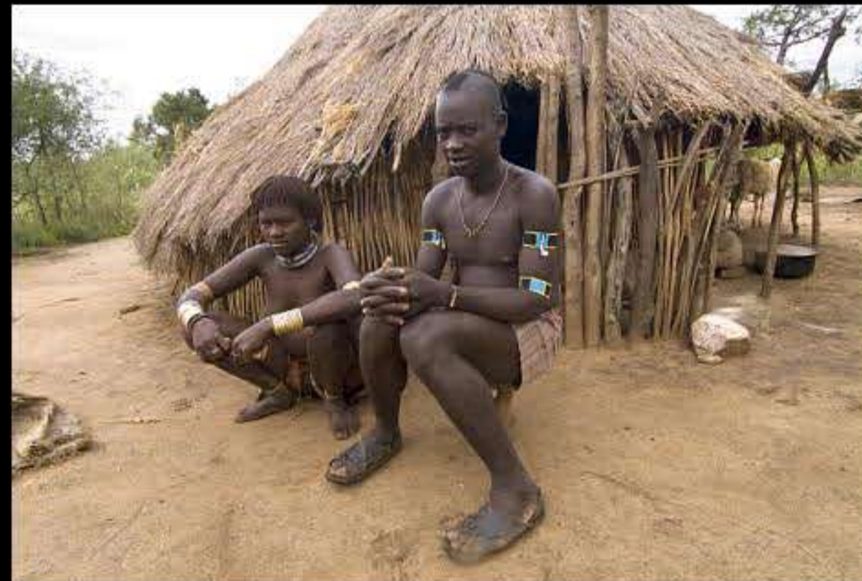
Dimeka area, Hammer people 113