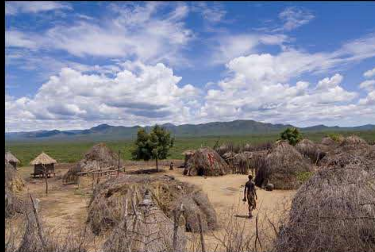
Korcho (karo people) 091