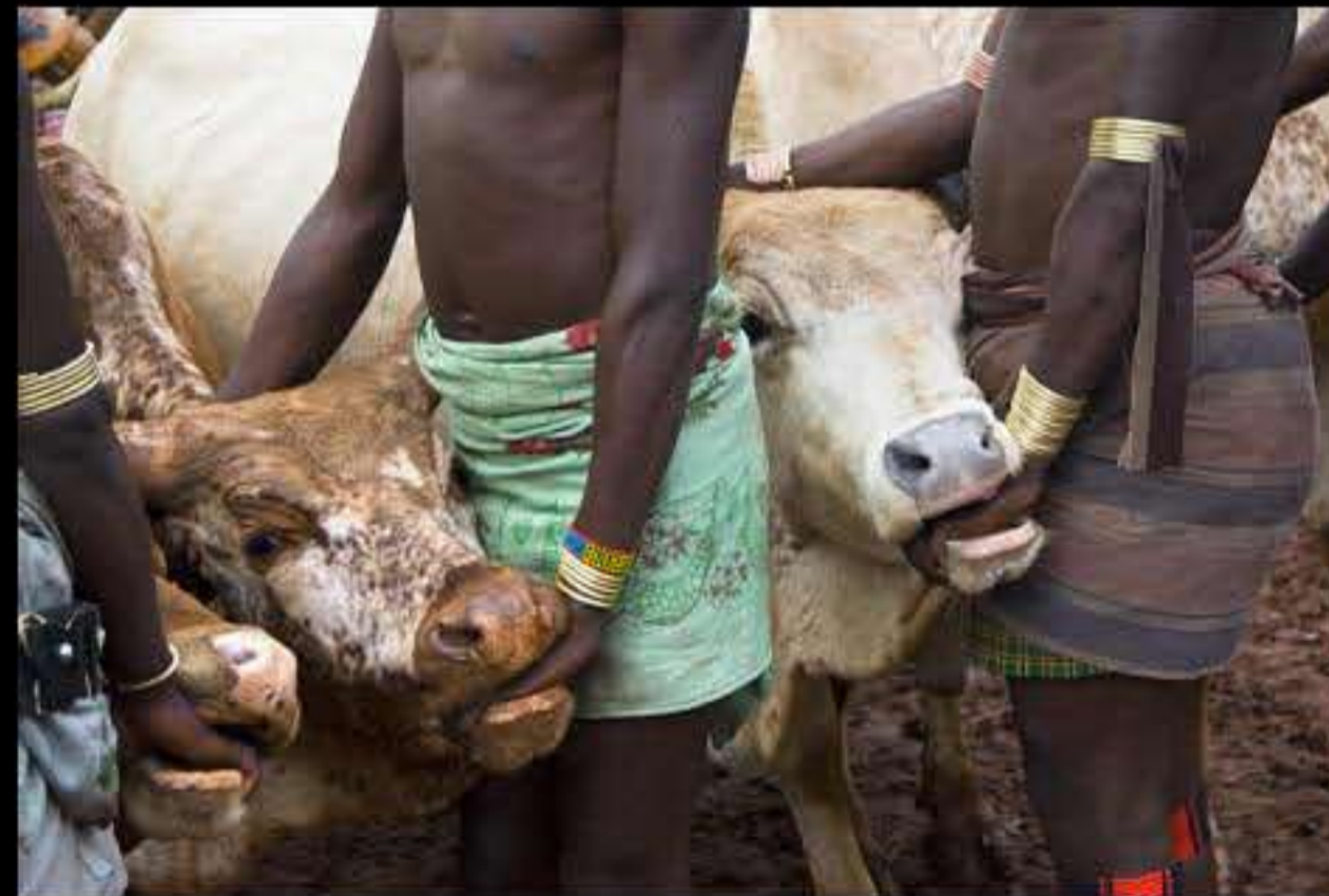
Dimeka, bull jamping (hammer) 227