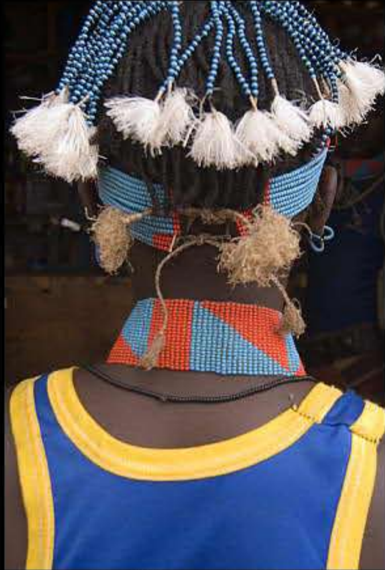
Key After, market 020