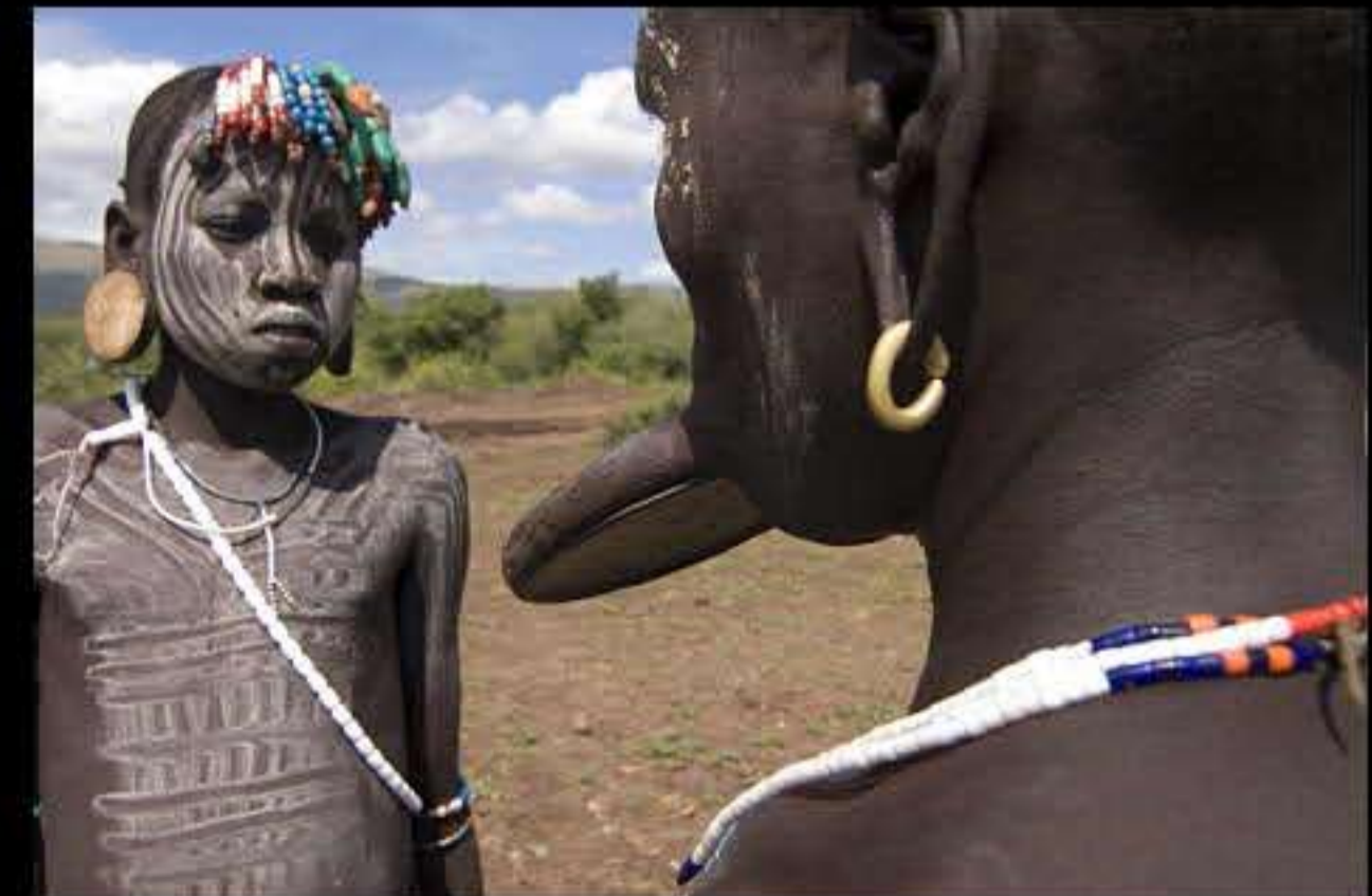
Mago park, mursi people 055