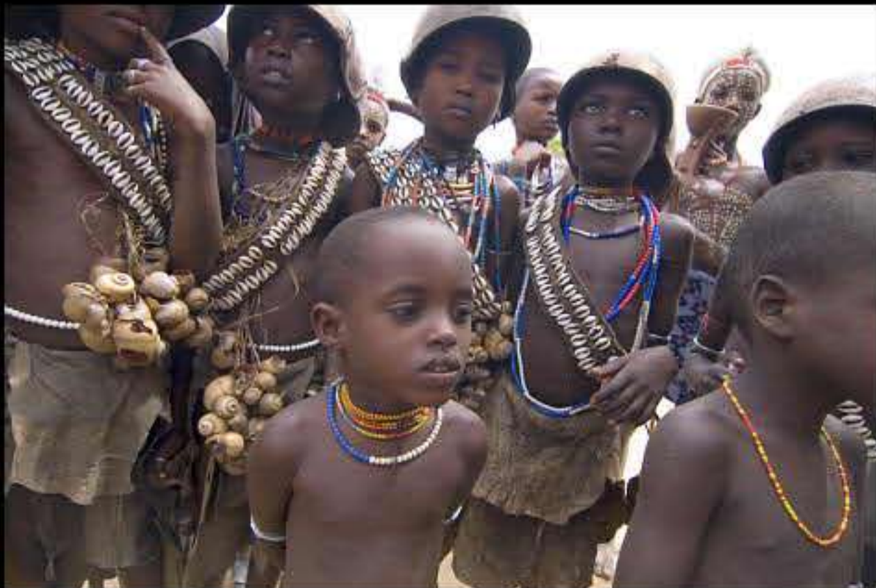
Woito valley (erbore people) 084