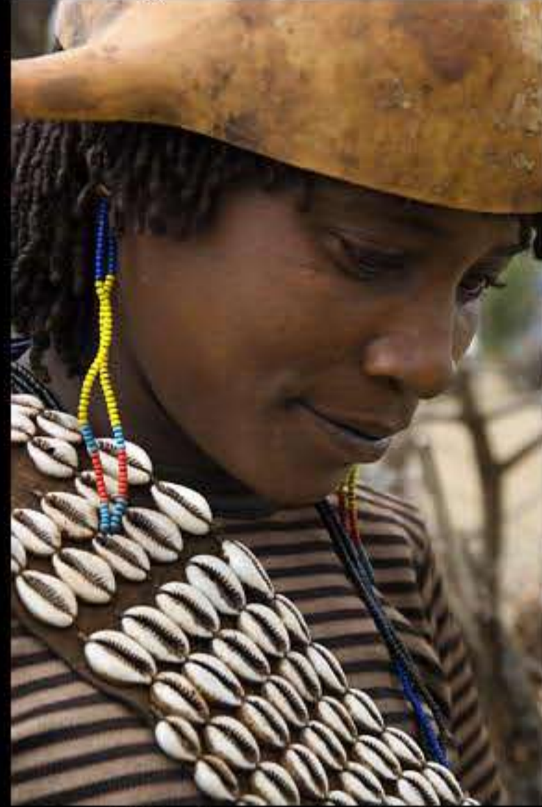
Woitto, tsamay people 105