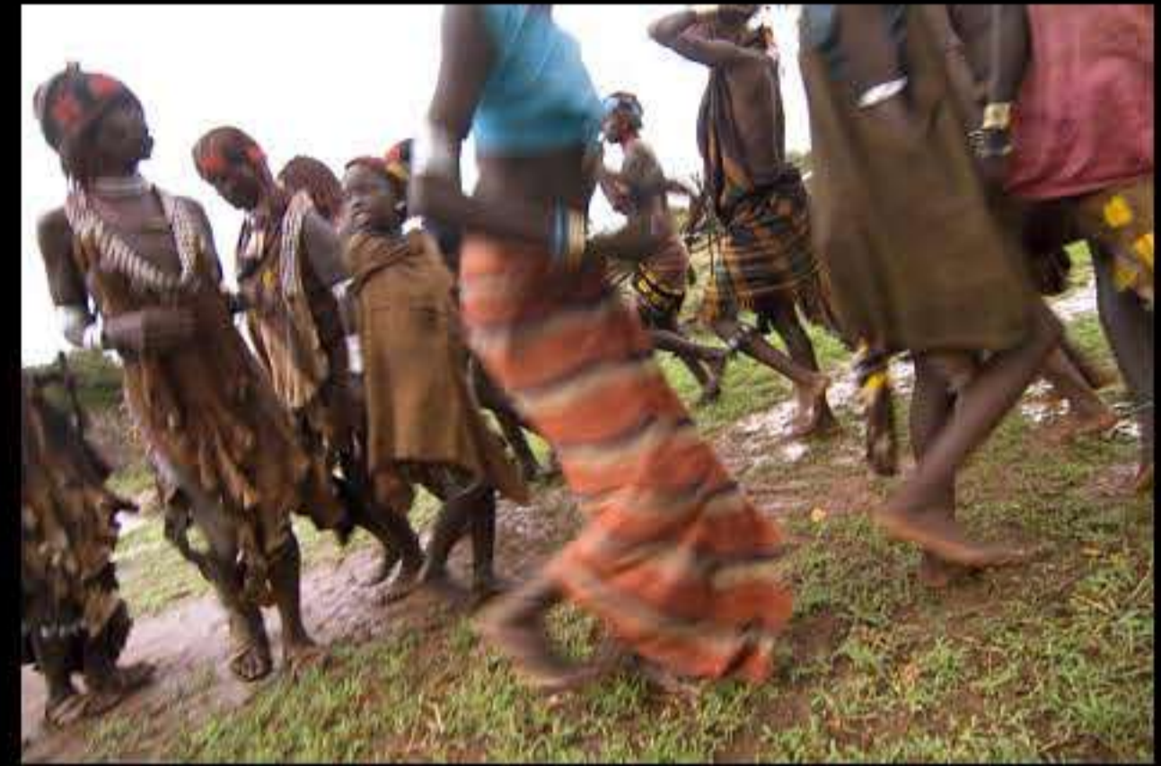
Dimeka, bull jamping (hammer) 108