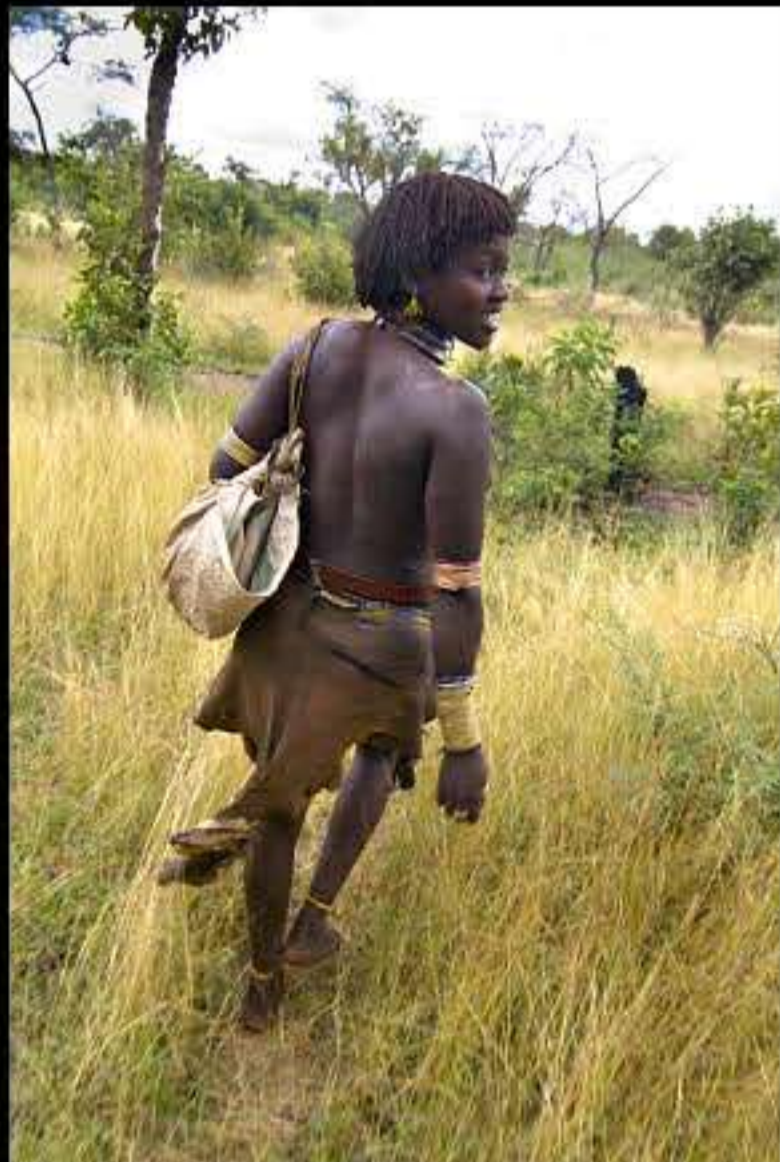
Dimeka area, Hammer people 103