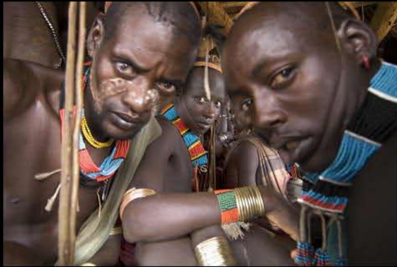
Dimeka, bull jamping (hammer) 081