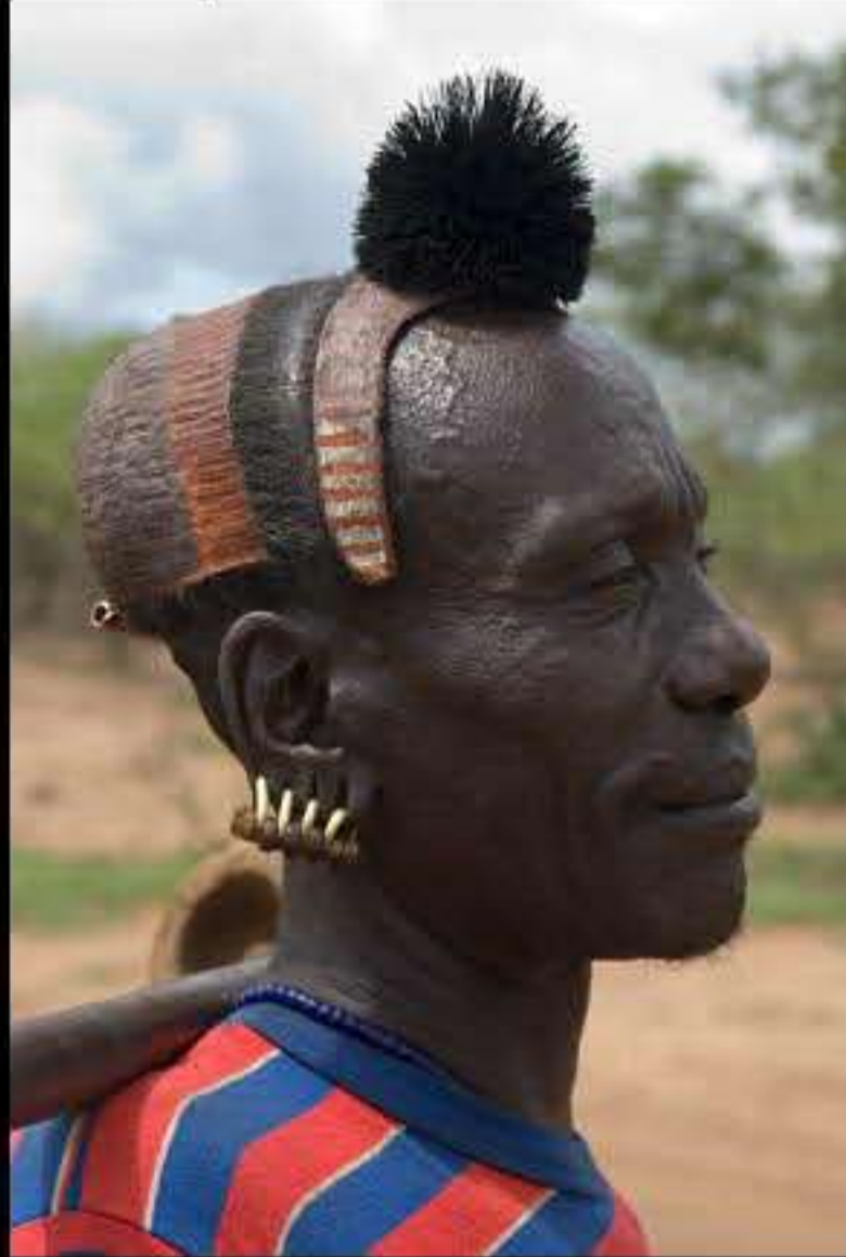
Dimeka area, Hammer people 124