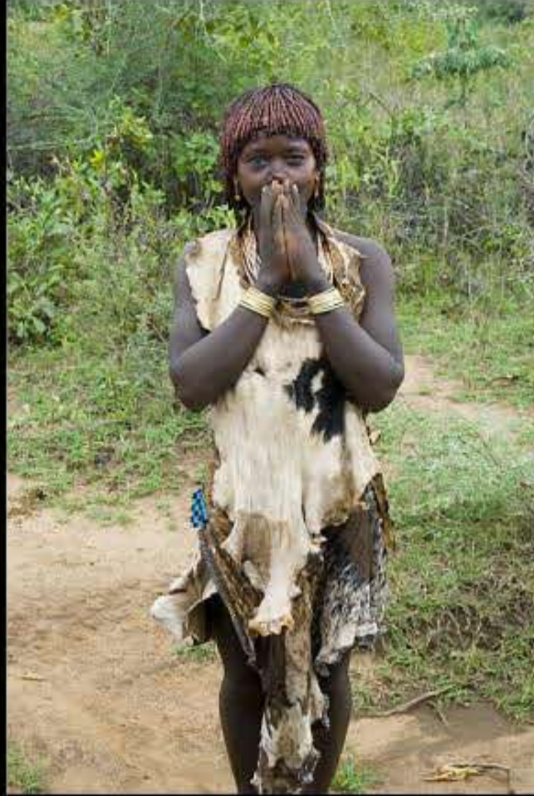
Dimeka area, Hammer people 030