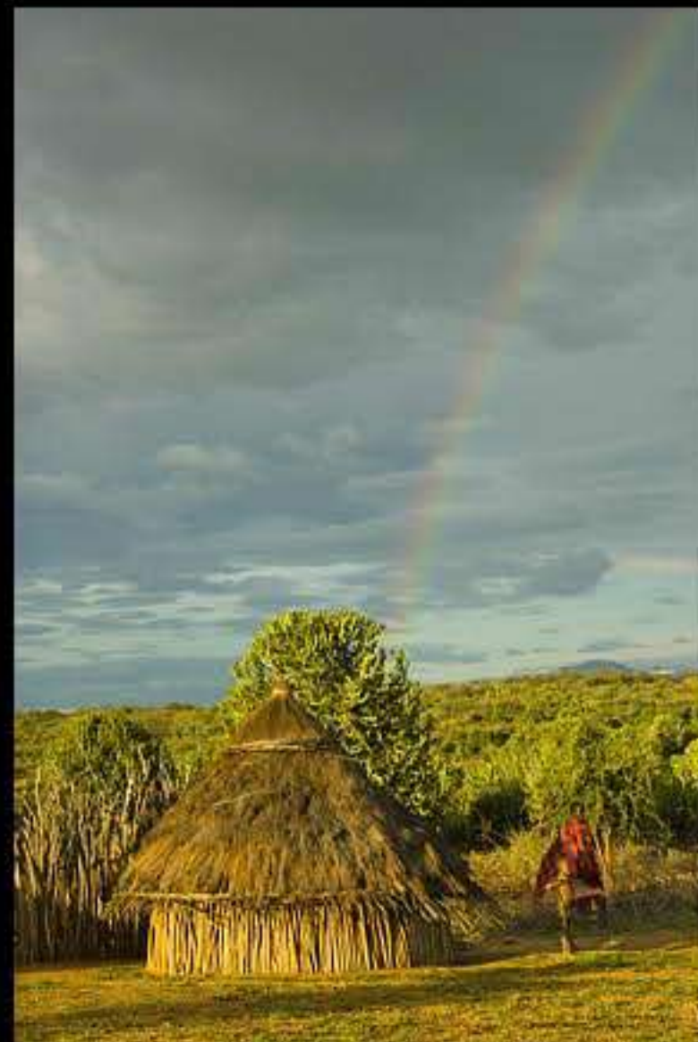
Turmi, hammer village 003