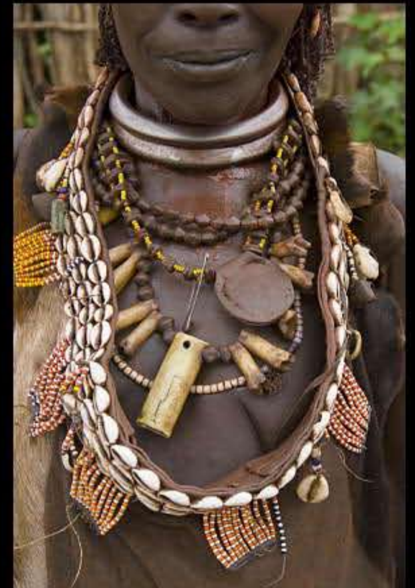
Dimeka, market (hammer people) 067