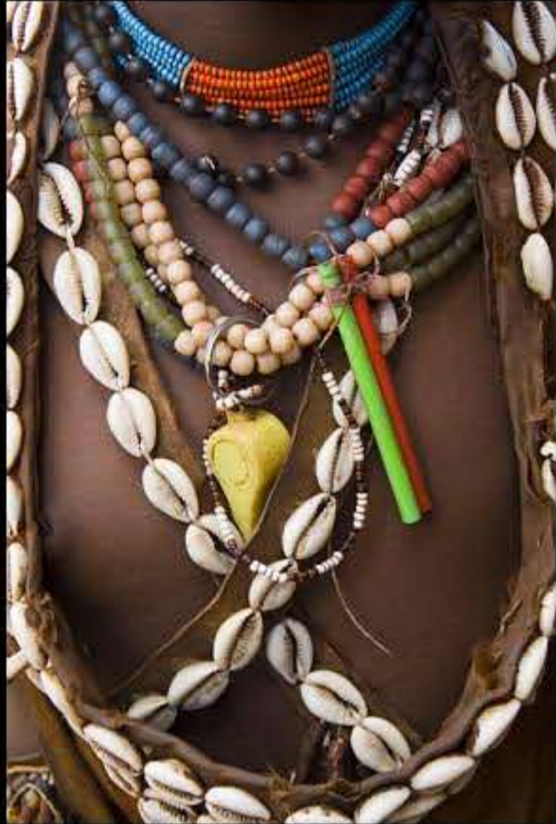
Turmi market (hammer people) 071