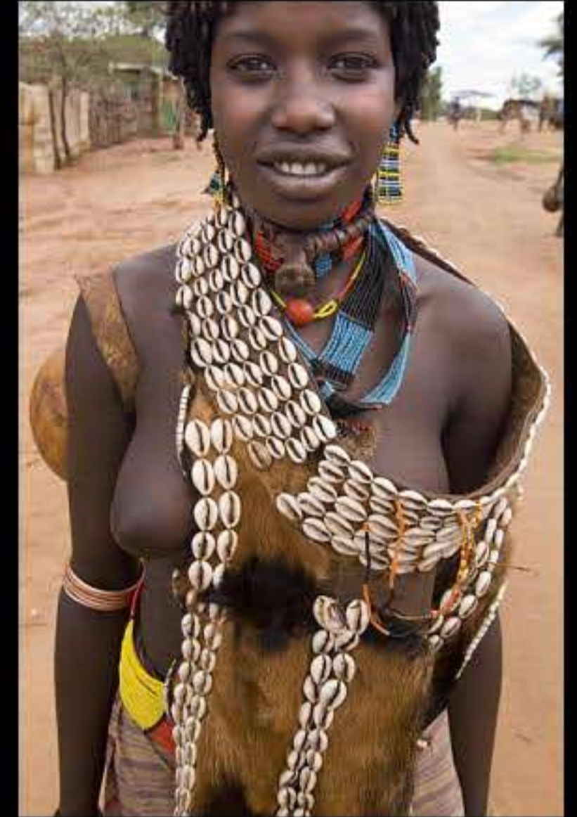
Dimeka, market (hammer people) 056