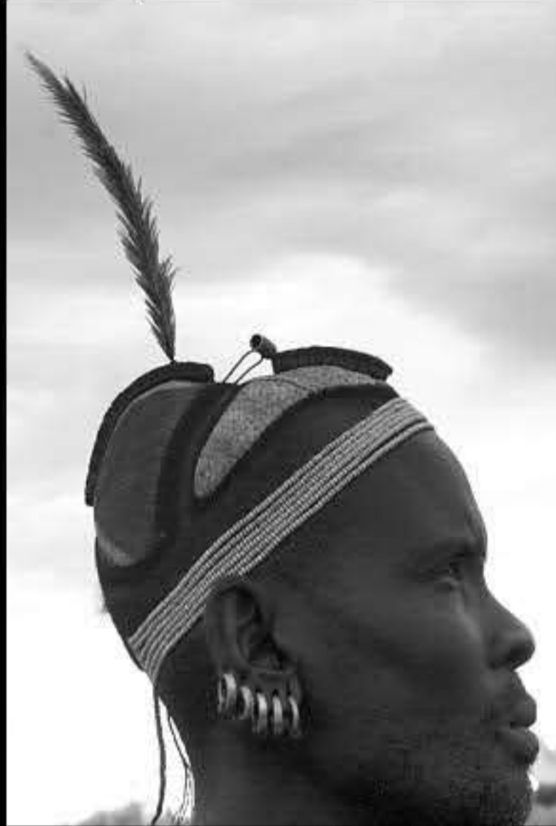
Omorate (dassanech people) 040