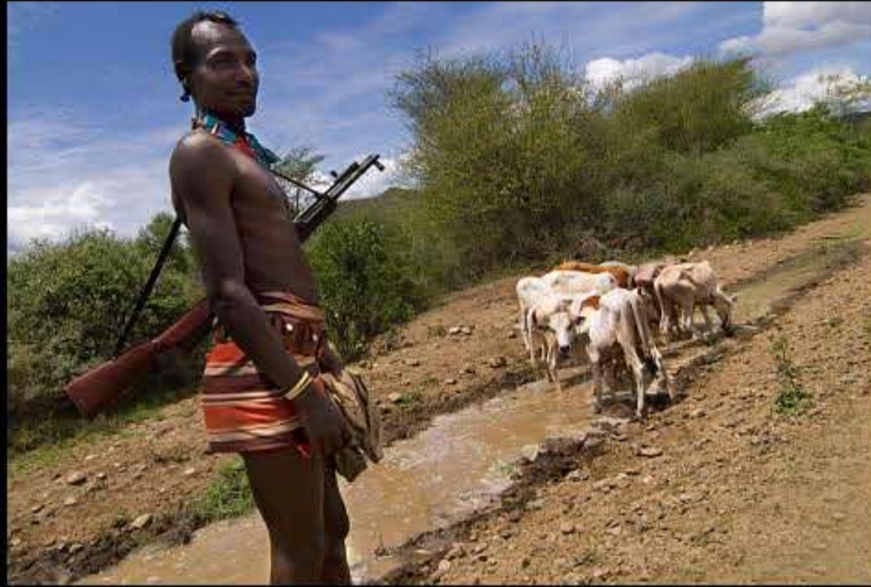
Woitto, Banna shepherds 006