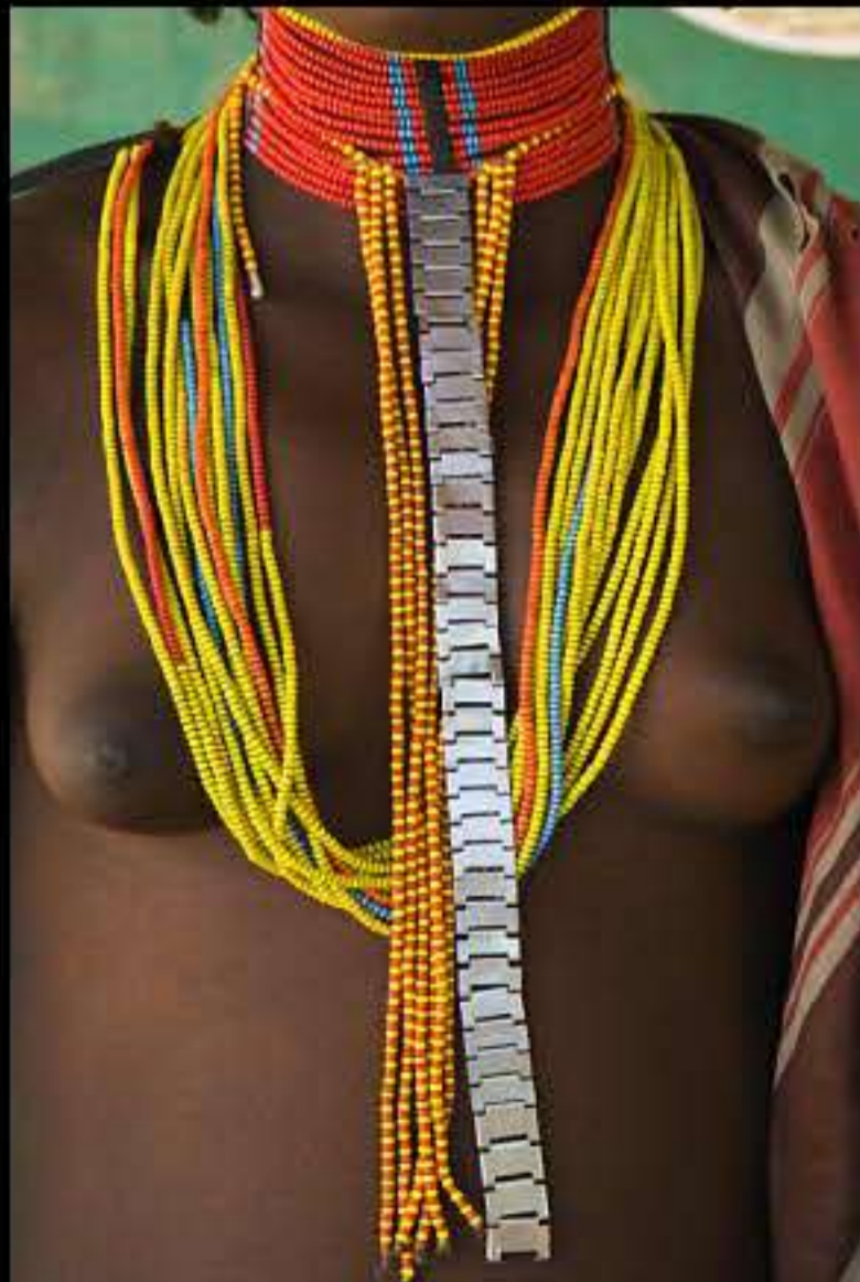
Woitto, Tsamay women 001