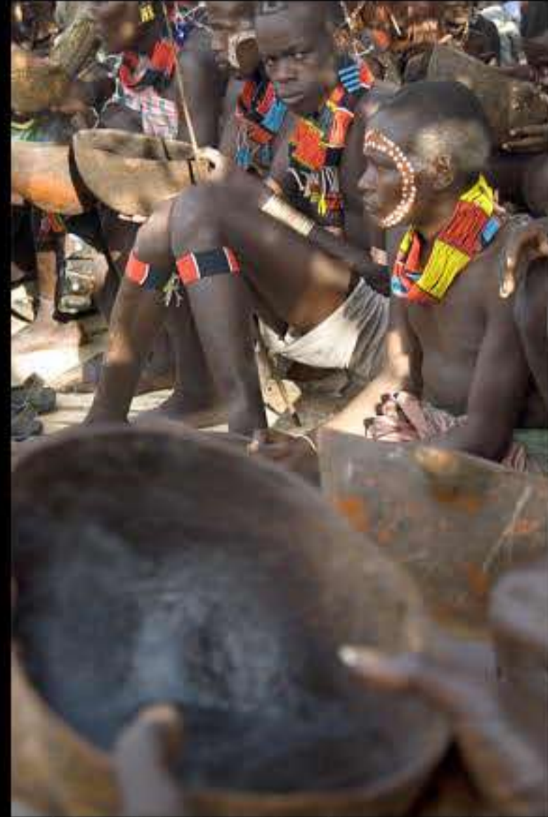
Turmi, bull jamping (hammer) 089