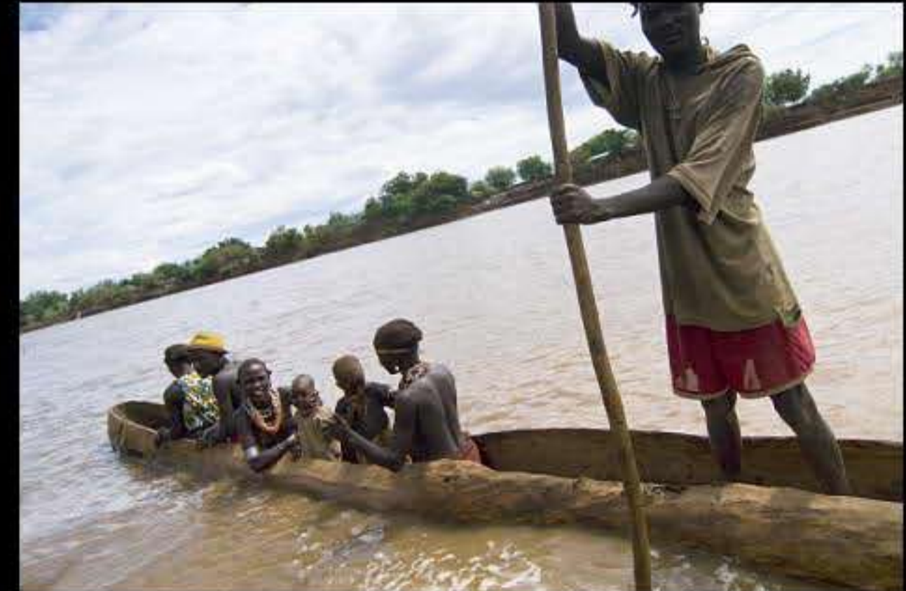
Omorate (dassanech people) 150