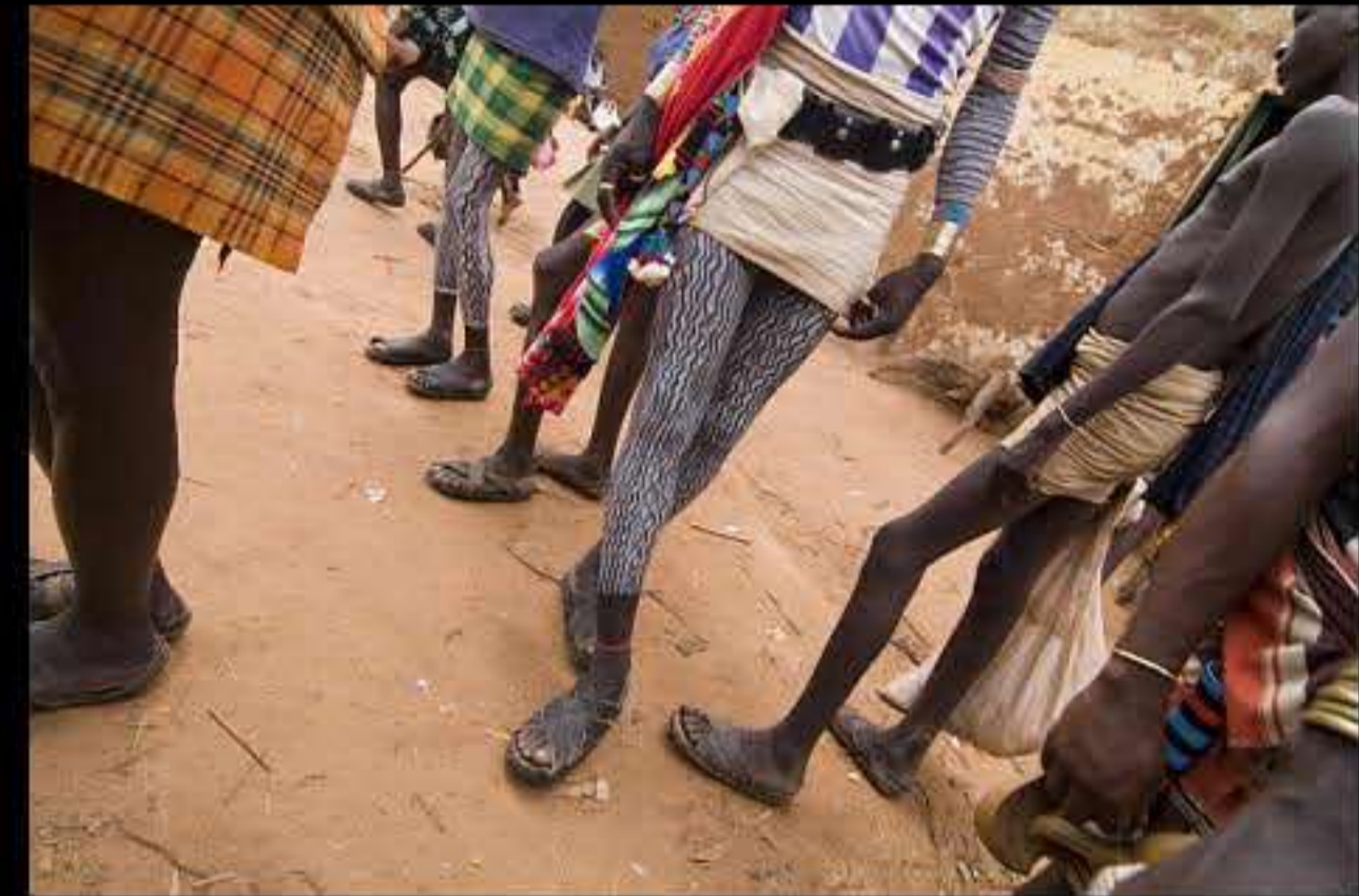
Dimeka, market (hammer people) 013