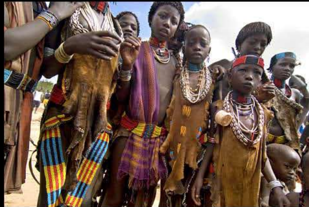
Turmi market (hammer people) 038