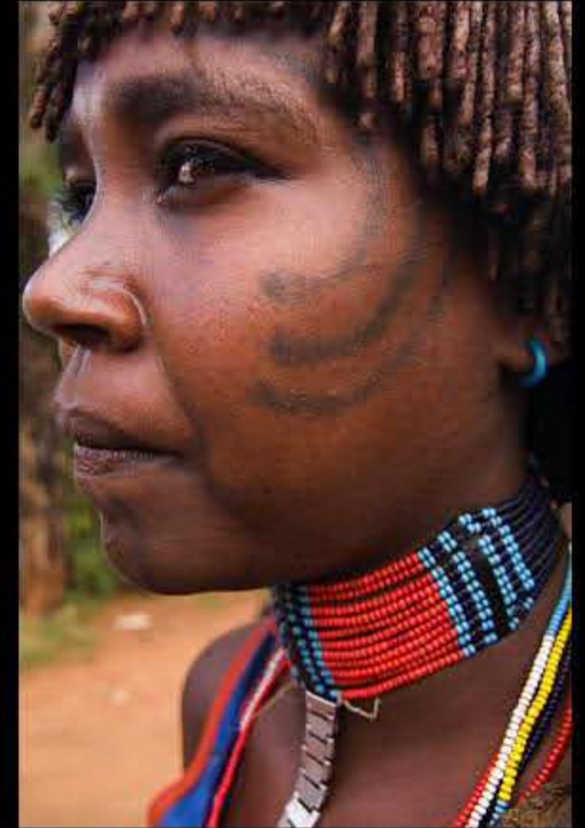
Key After, market 220