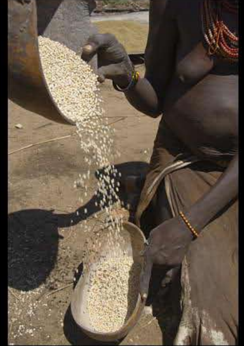
Korcho (karo people) 061