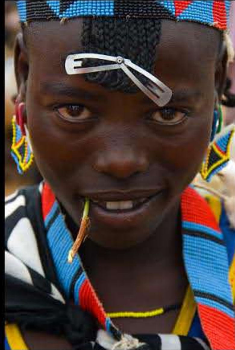
Key After, market 073