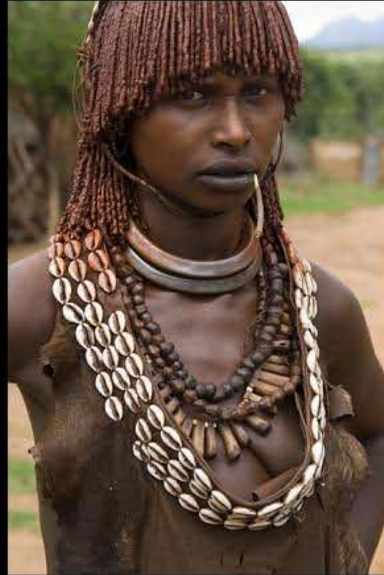
Dimeka, market (hammer people) 052