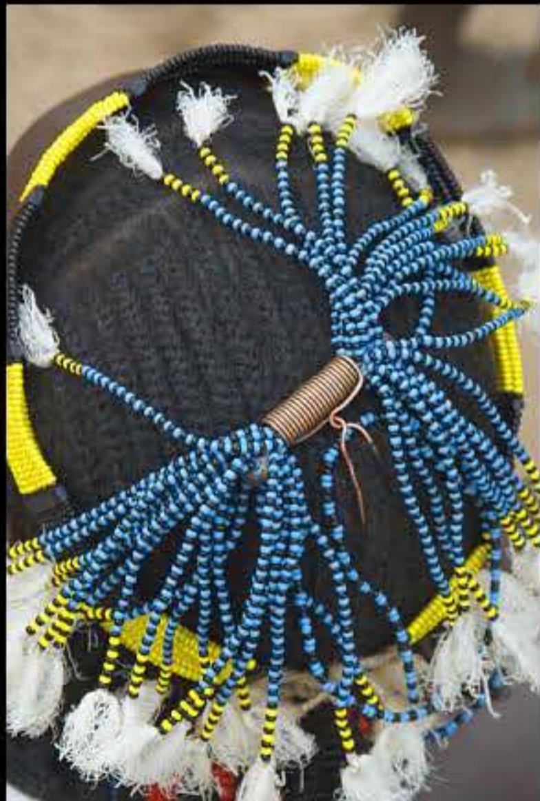
Turmi, bull jamping (hammer) 034