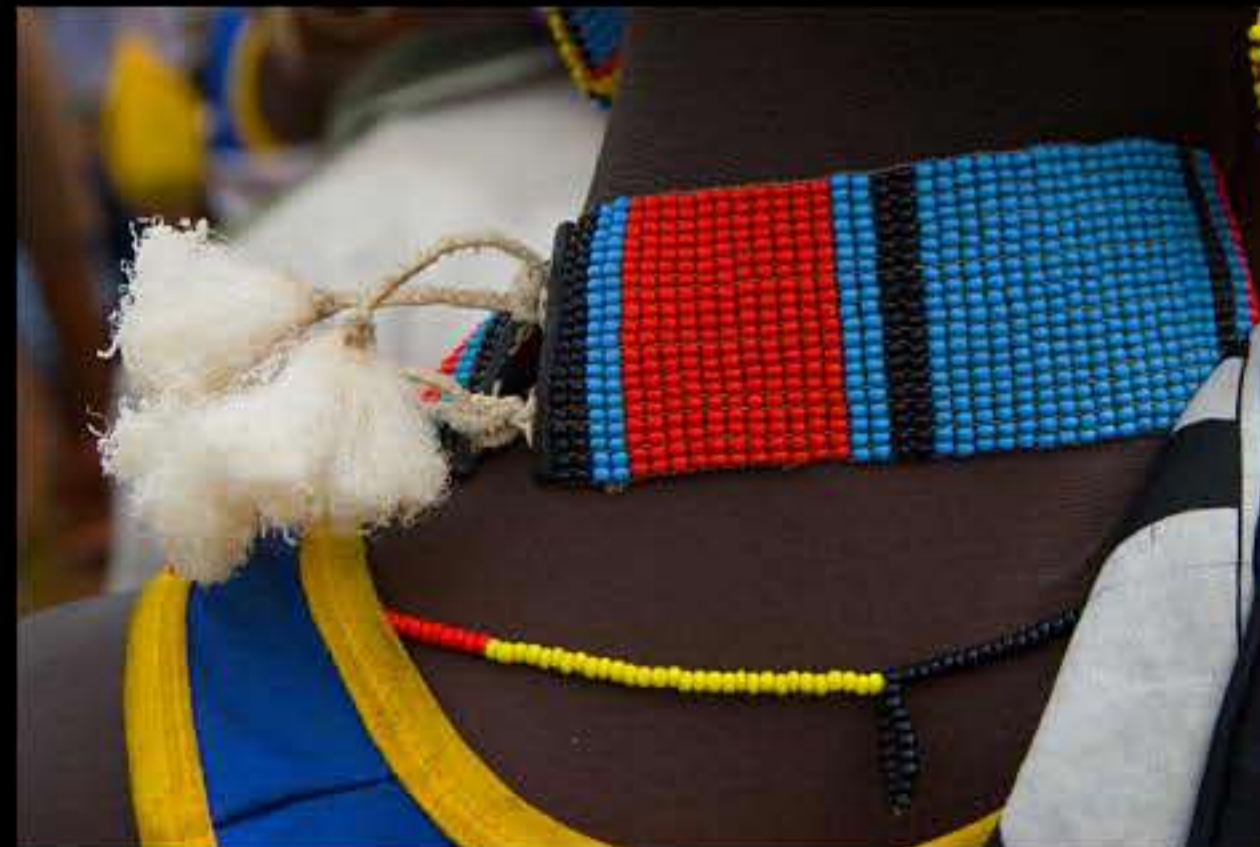
Key After, market 066