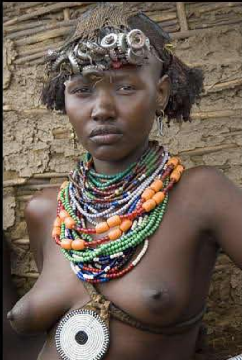
Omorate (dassanech people) 097