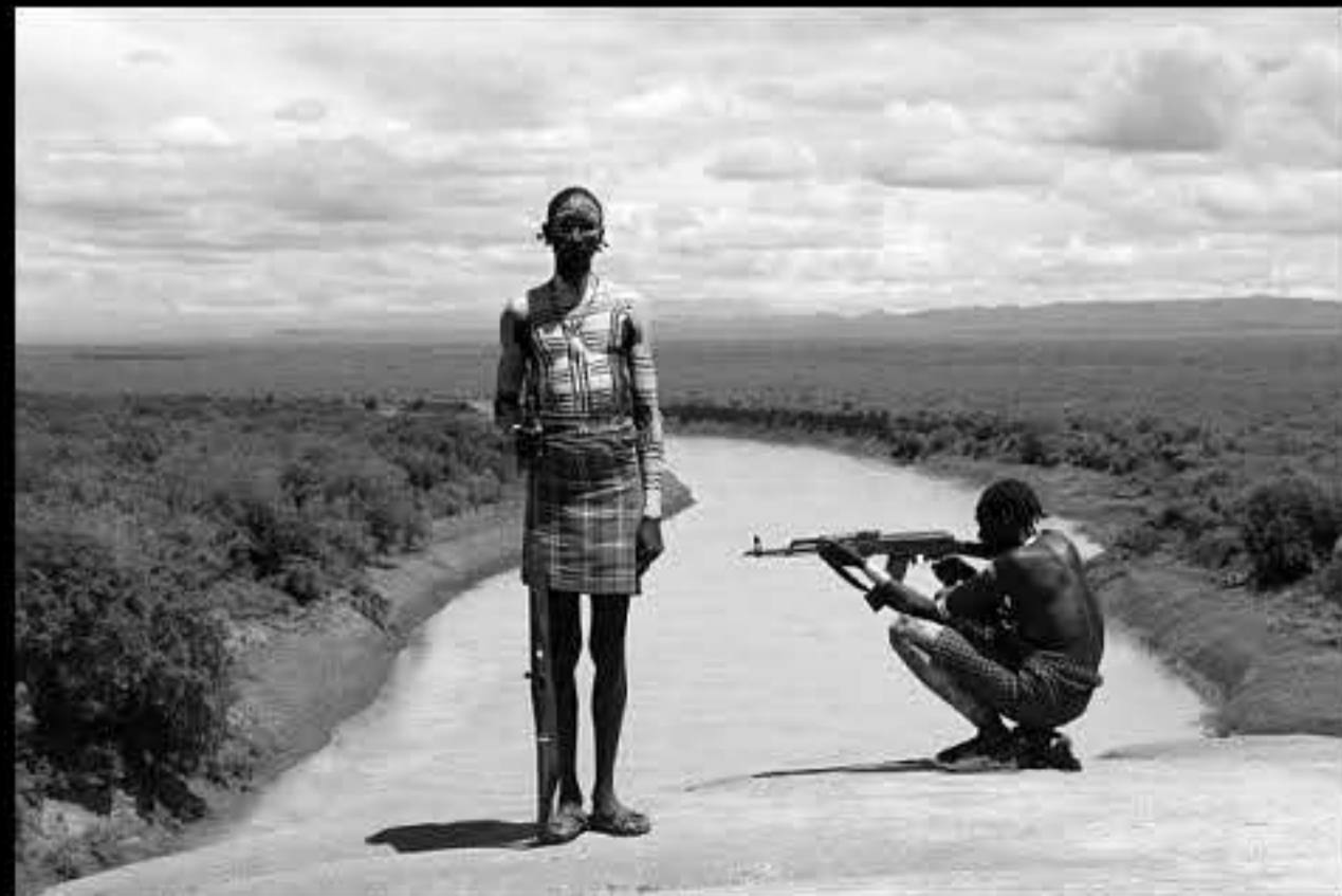
Korcho (karo people) 037