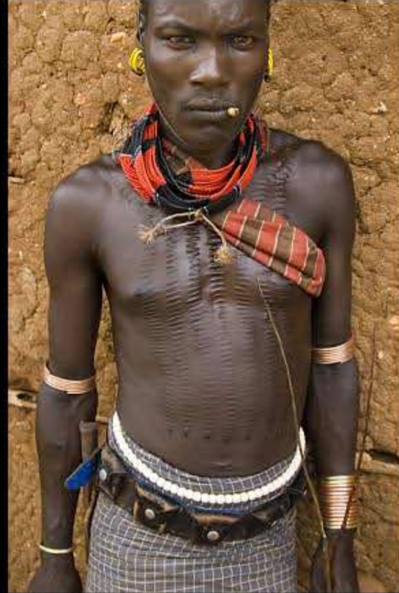
Dimeka, market (hammer people) 089