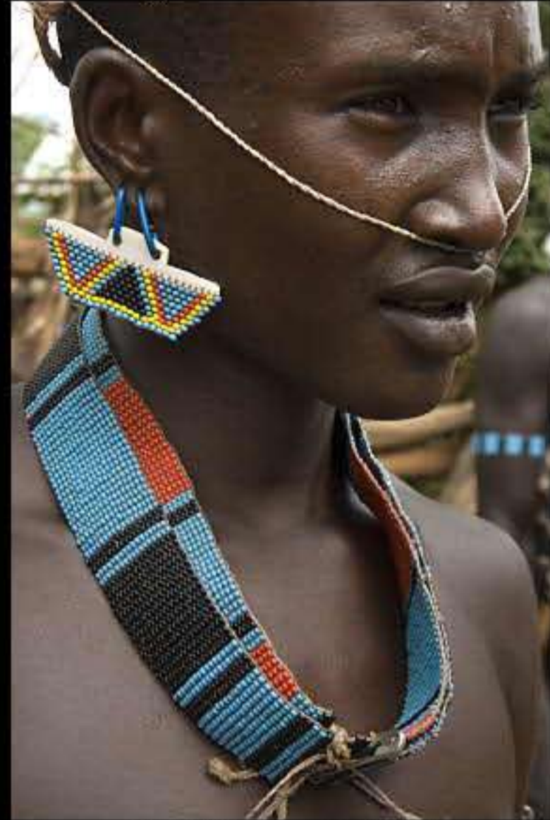
Key After, market 044