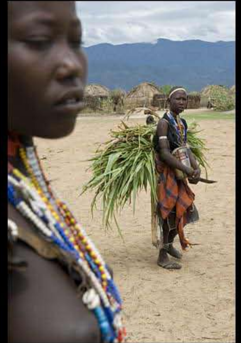
Woito valley (erbore people) 082