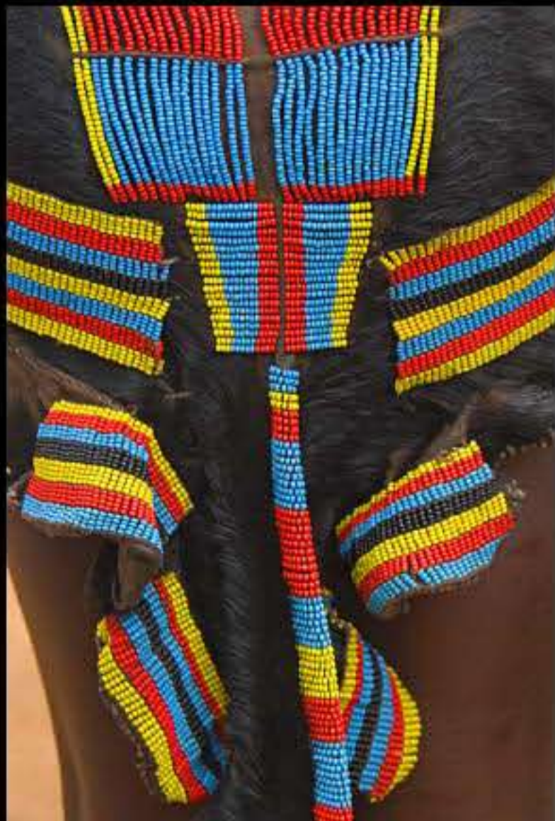
Key After, market 063