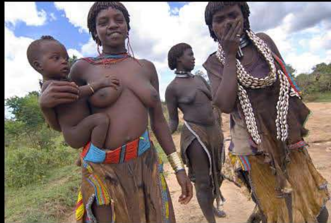
Dimeka area, Hammer people 073