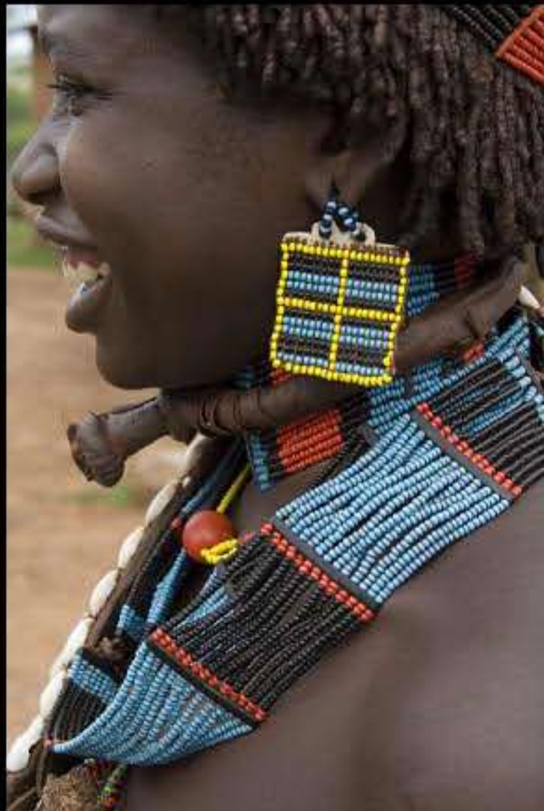
Dimeka, market (hammer people) 059