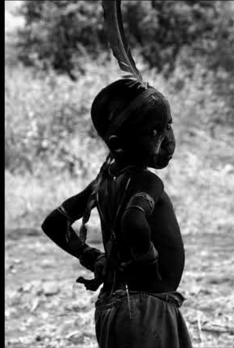
Mago park, mursi people 180