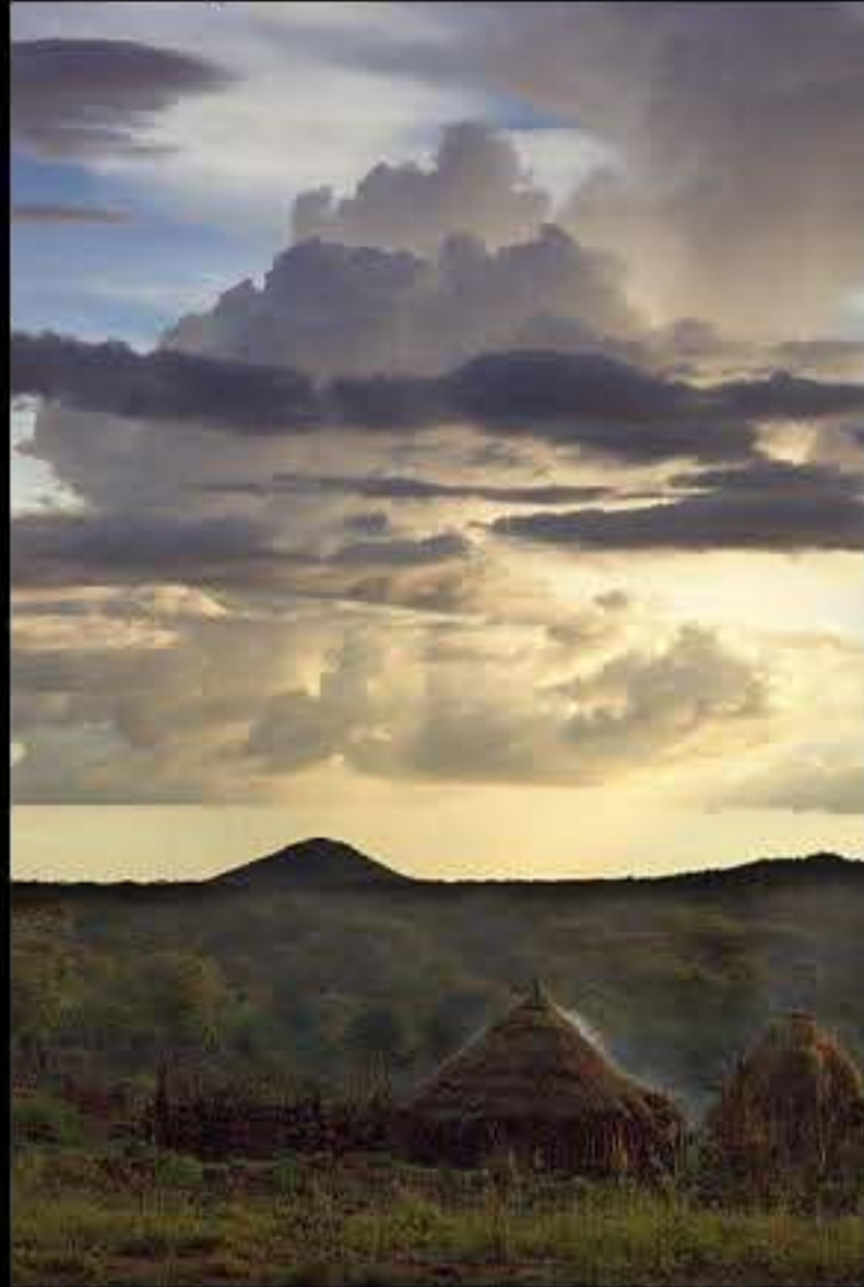
Dimeka, hammer village 008