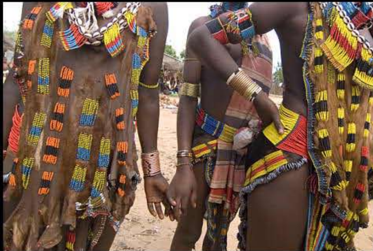
Turmi market (hammer people) 008