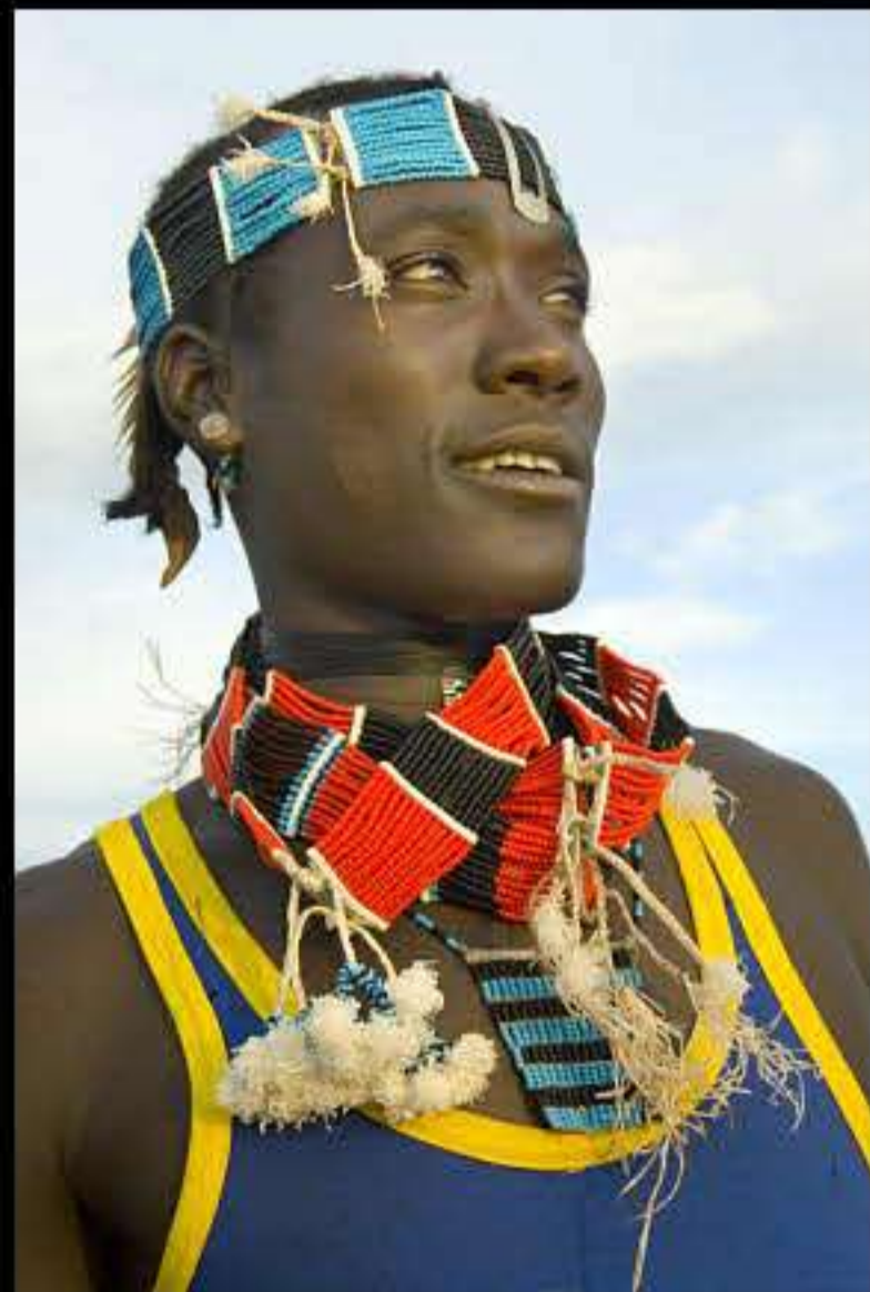
Turmi, bull jamping (hammer) 188