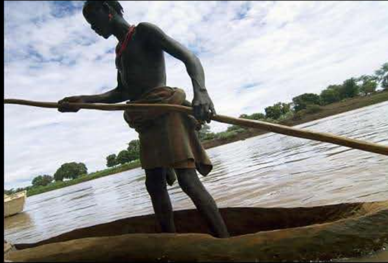
Omorate, Omo river 025