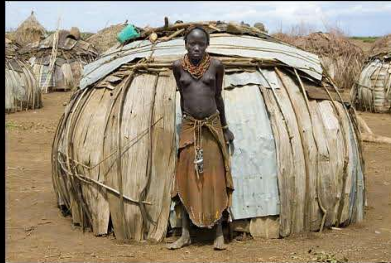
Omorate (dassanech people) 193