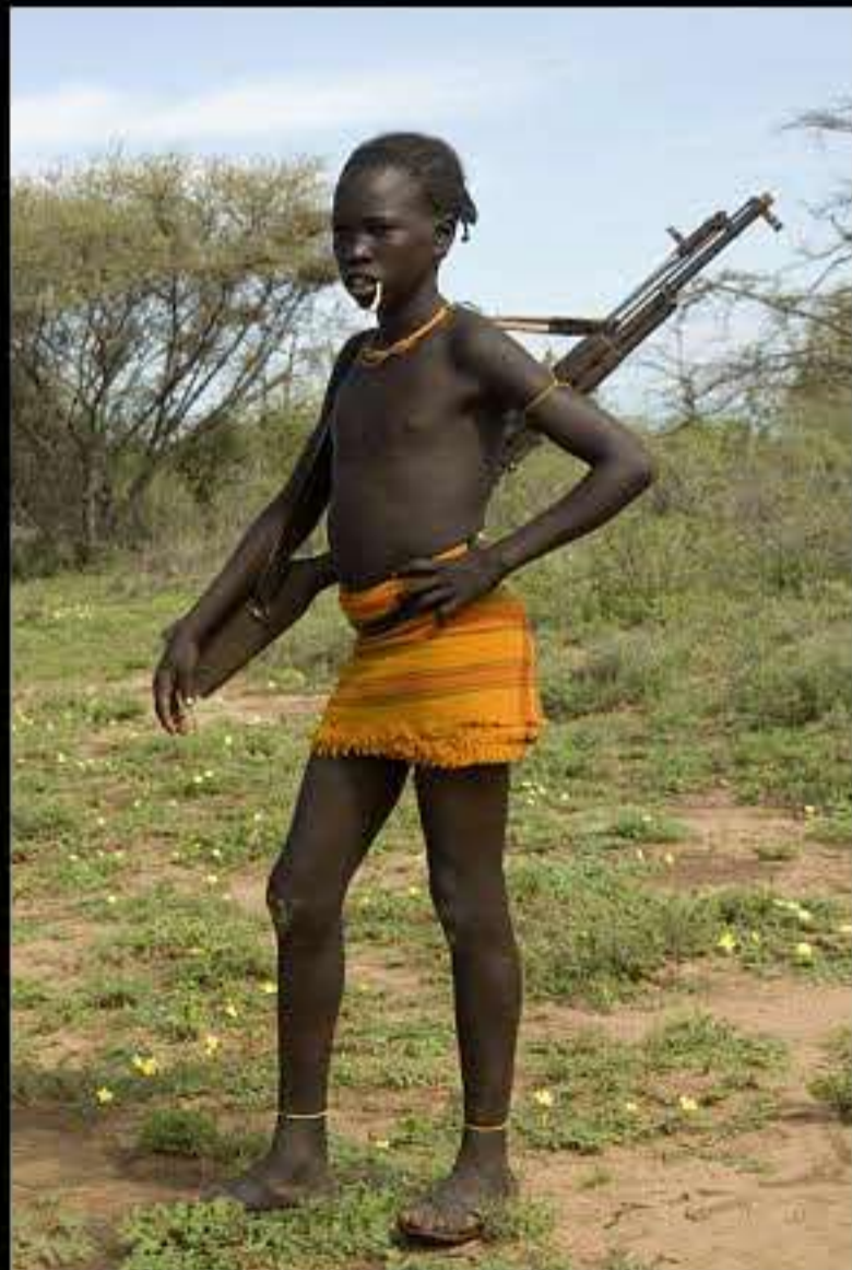
Turmi (hammer people) 015