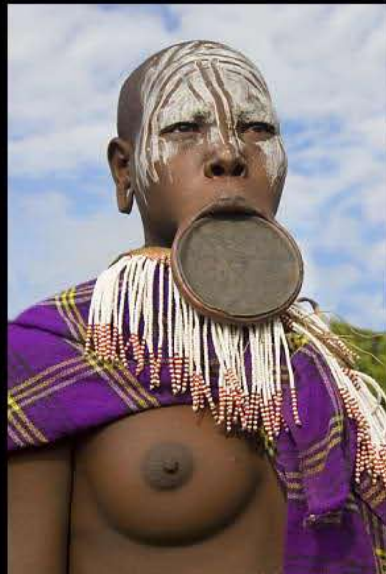
Mago park, mursi people 008