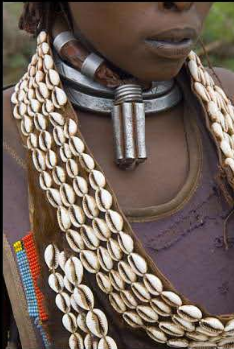
Dimeka area, Hammer people 065