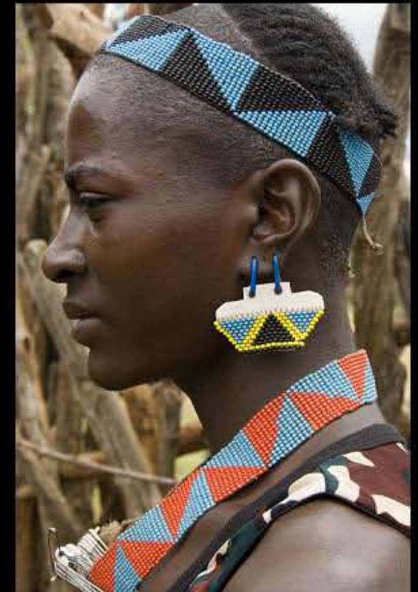
Key After, market 005