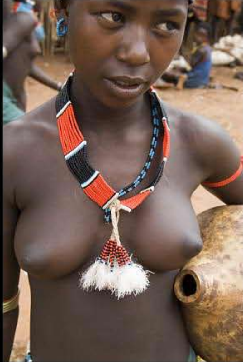
Dimeka, market (hammer people) 071