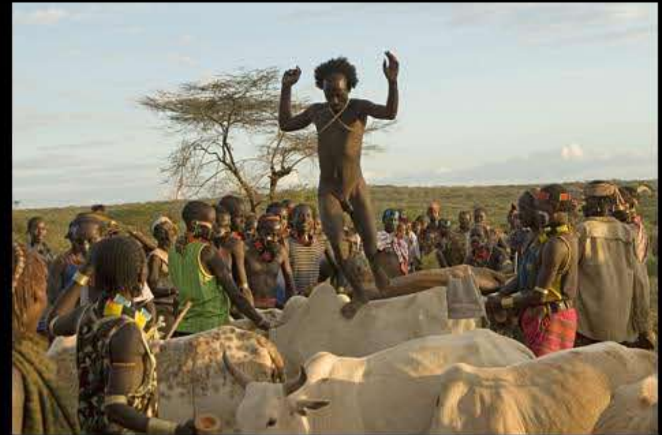
Turmi, bull jamping (hammer) 178