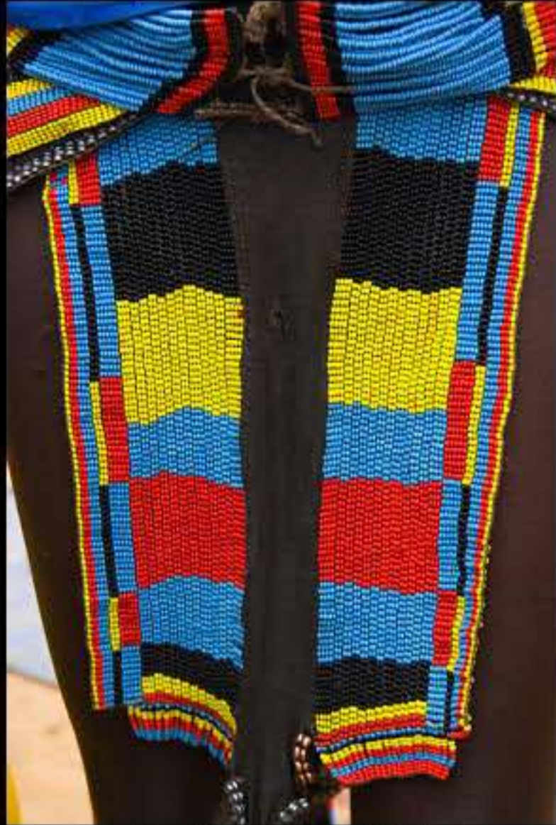
Key After, market 070