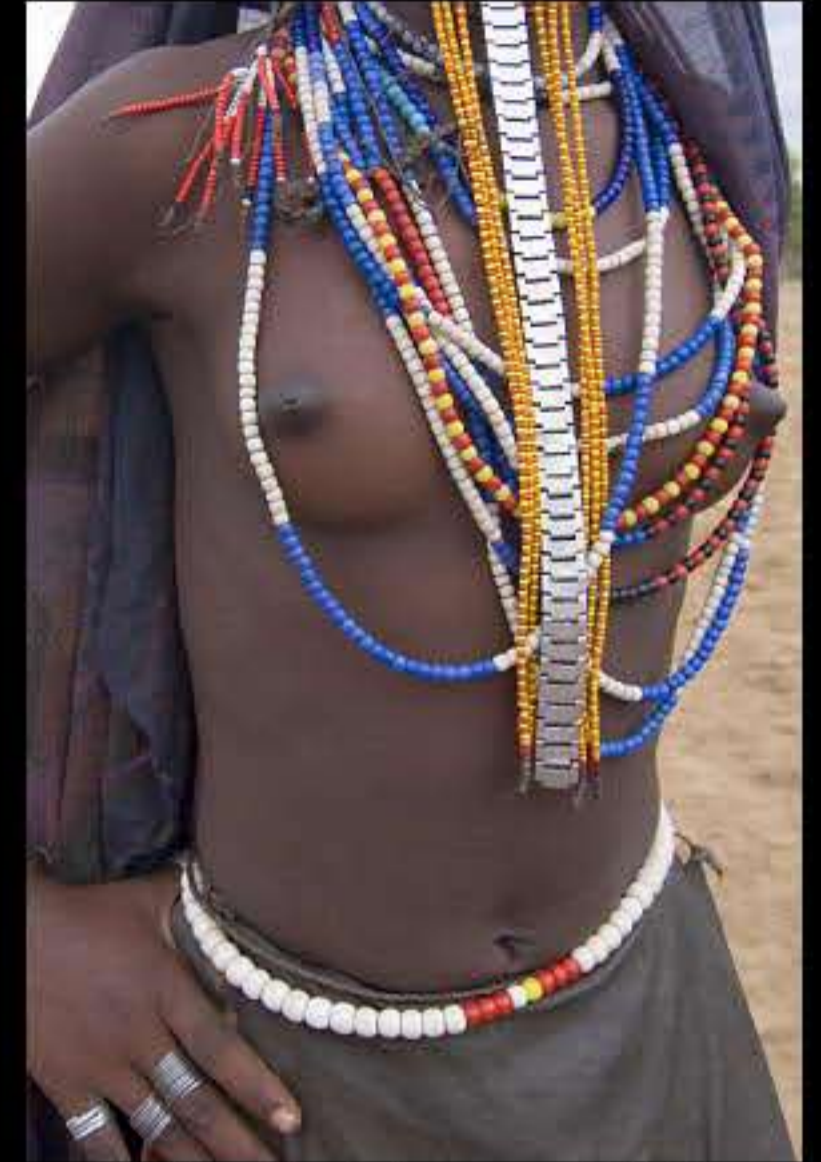
Woito valley (erbore people) 003