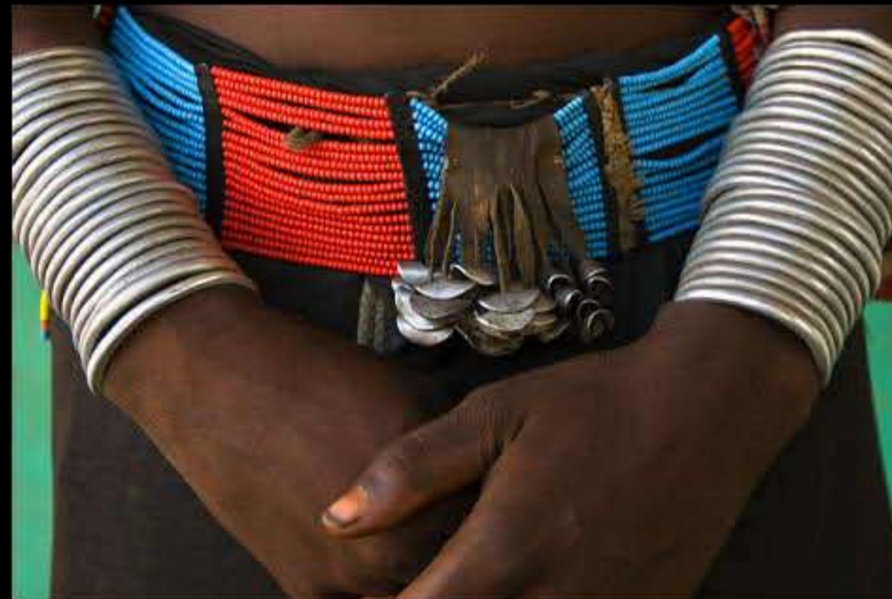
Woitto, Tsamay women 003