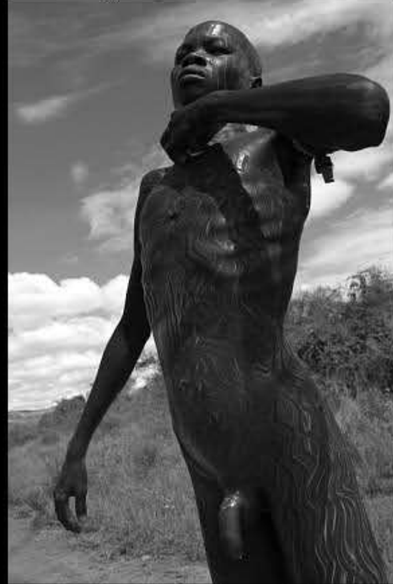
Mago park, mursi people 060