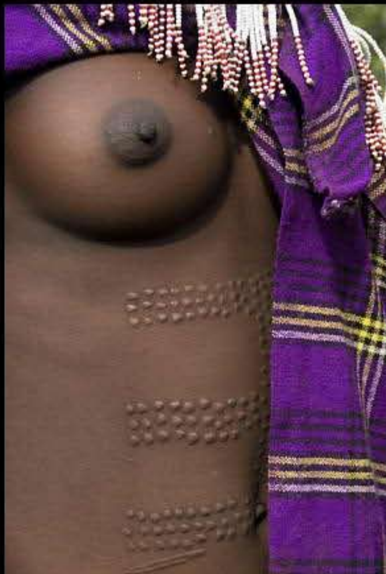
Mago park, mursi people 005