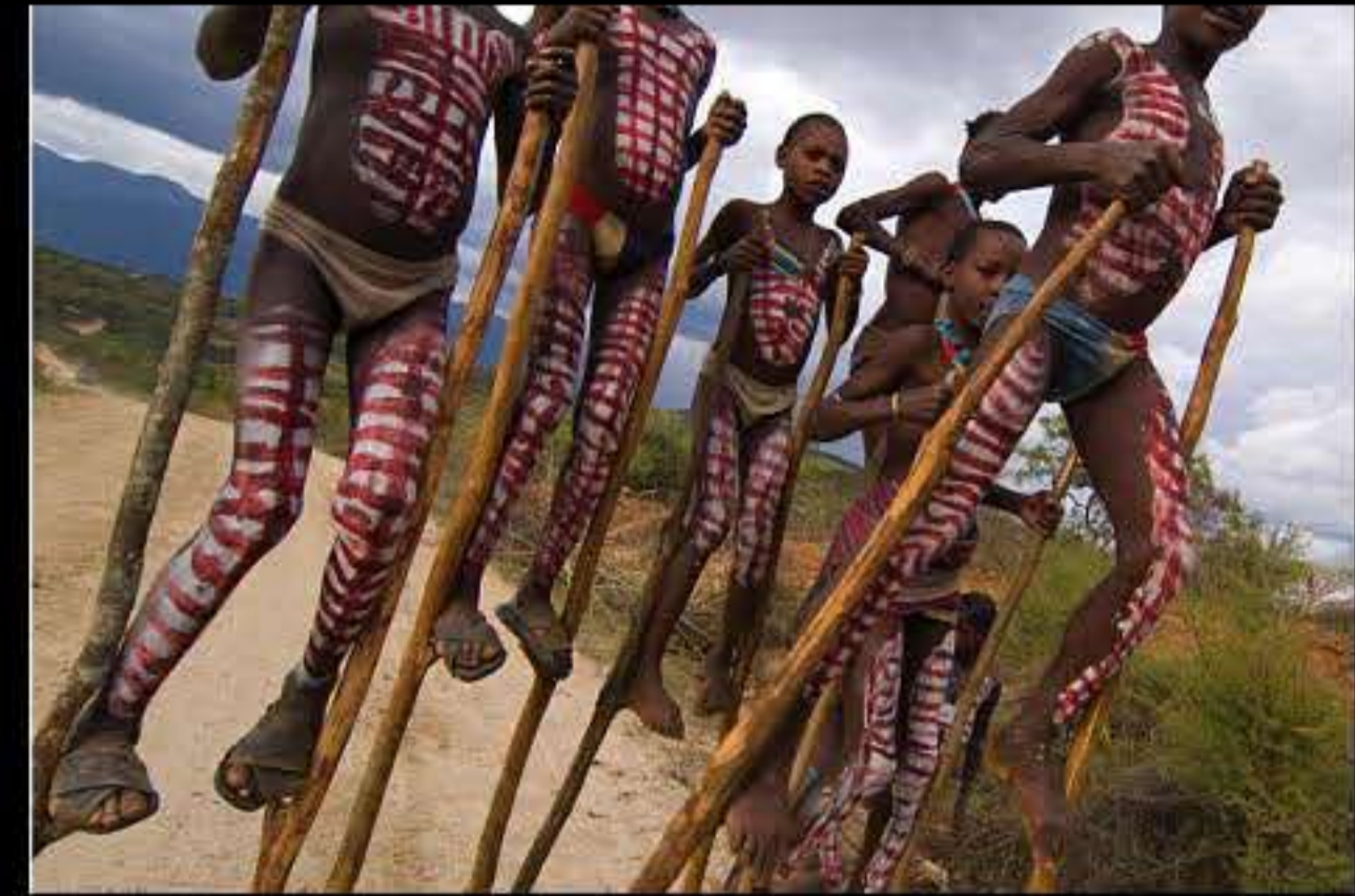
Key After, banna boys 002