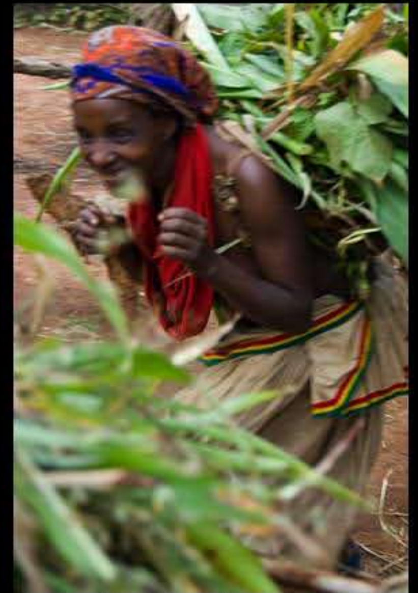
Konso, New Work village (konso) 104