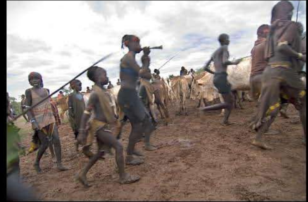
Dimeka, bull jamping (hammer) 212