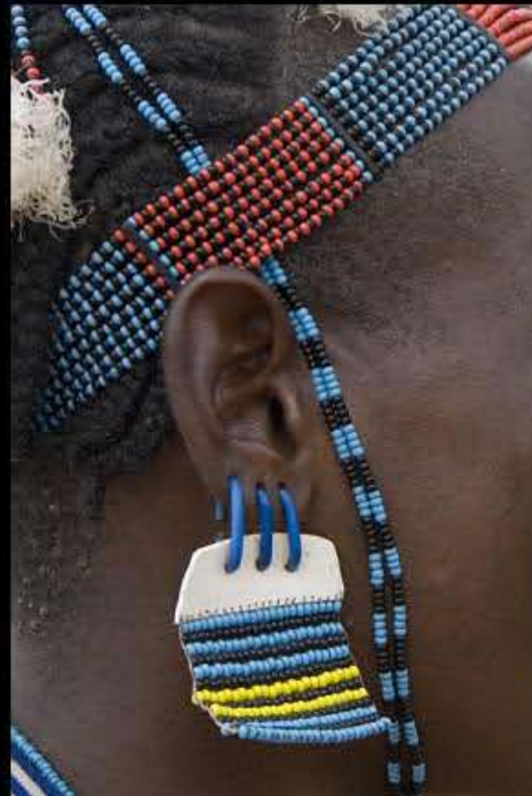
Dimeka, market (hammer people) 064