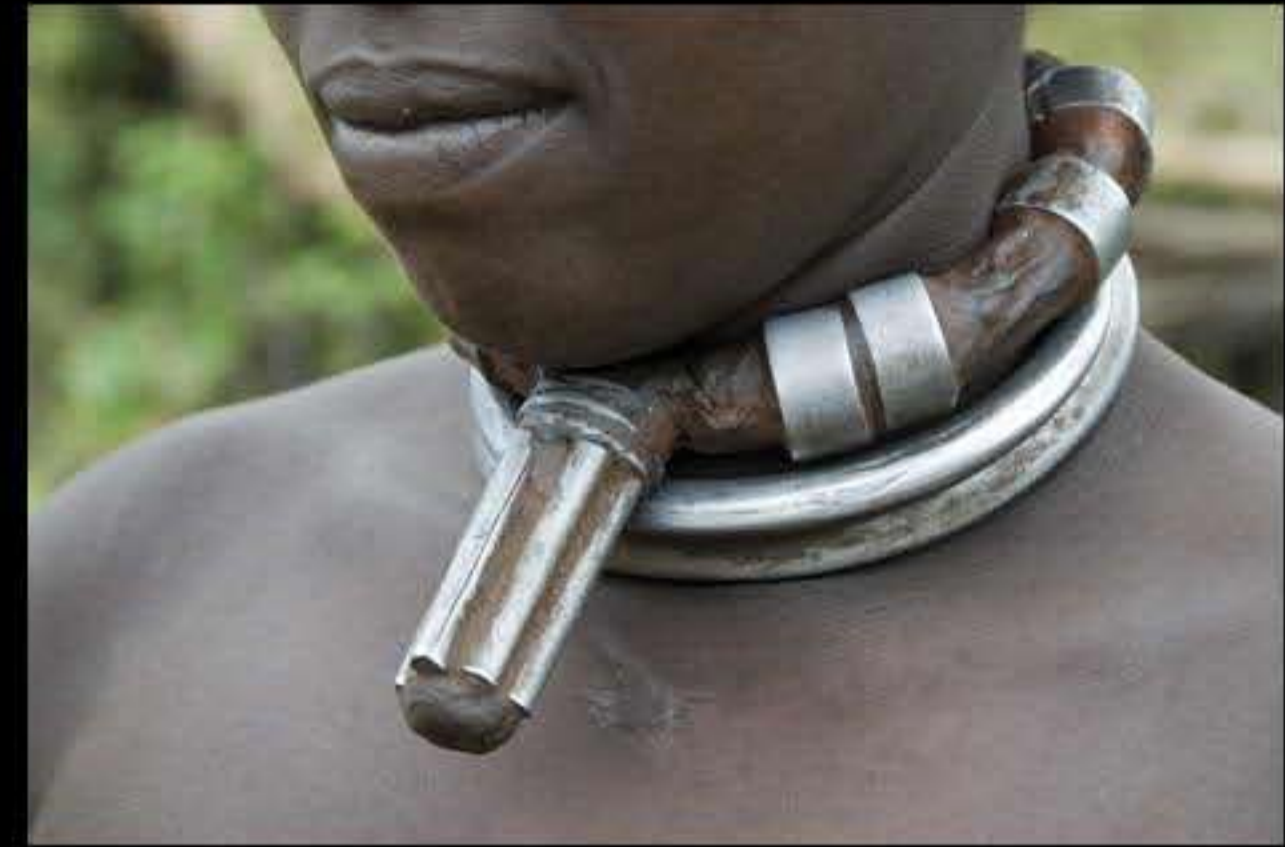
Dimeka area, Hammer people 053