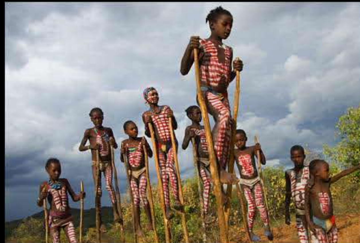
Key After, banna boys 018