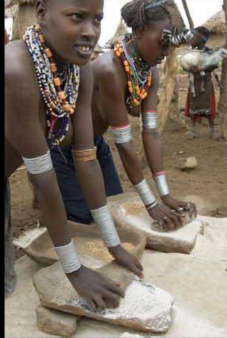
Omorate (dassanech people) 056