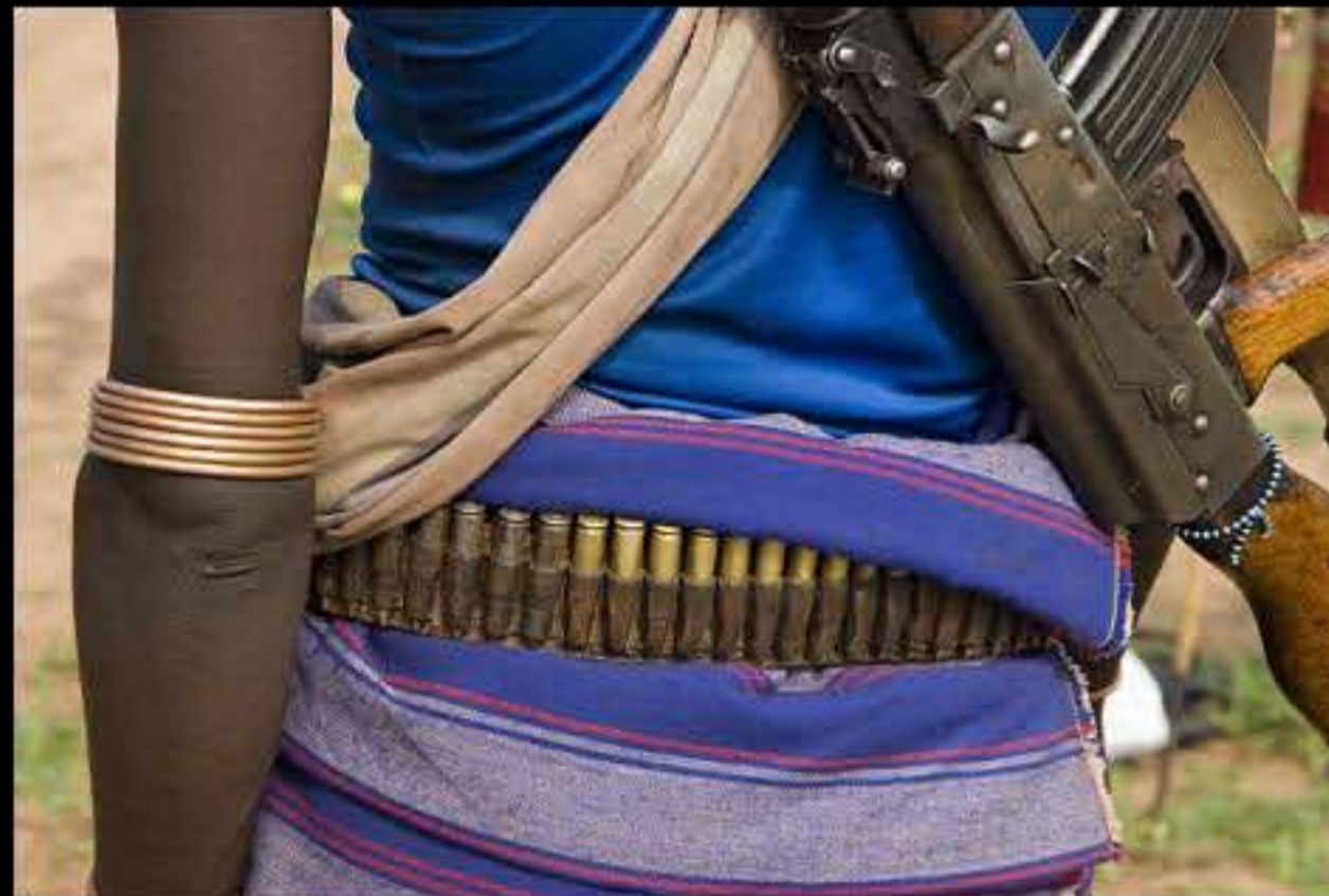
Turmi (hammer people) 029