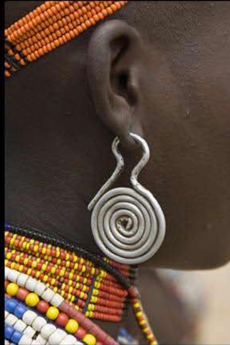
Woito valley (erbore people) 079