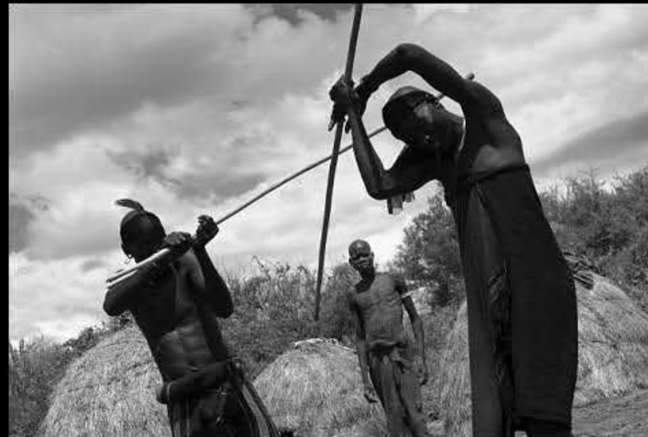
Mago park, mursi people 161