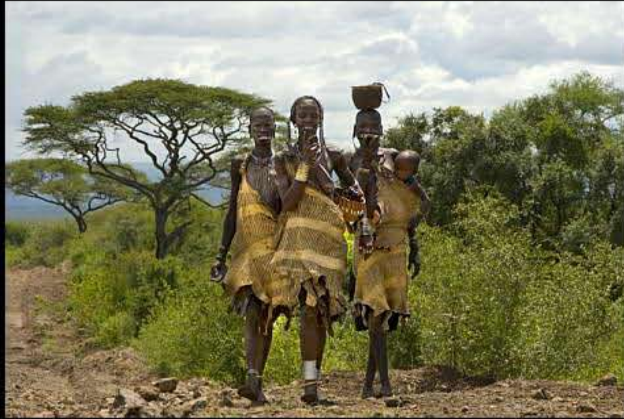
Mago park, mursi people 176