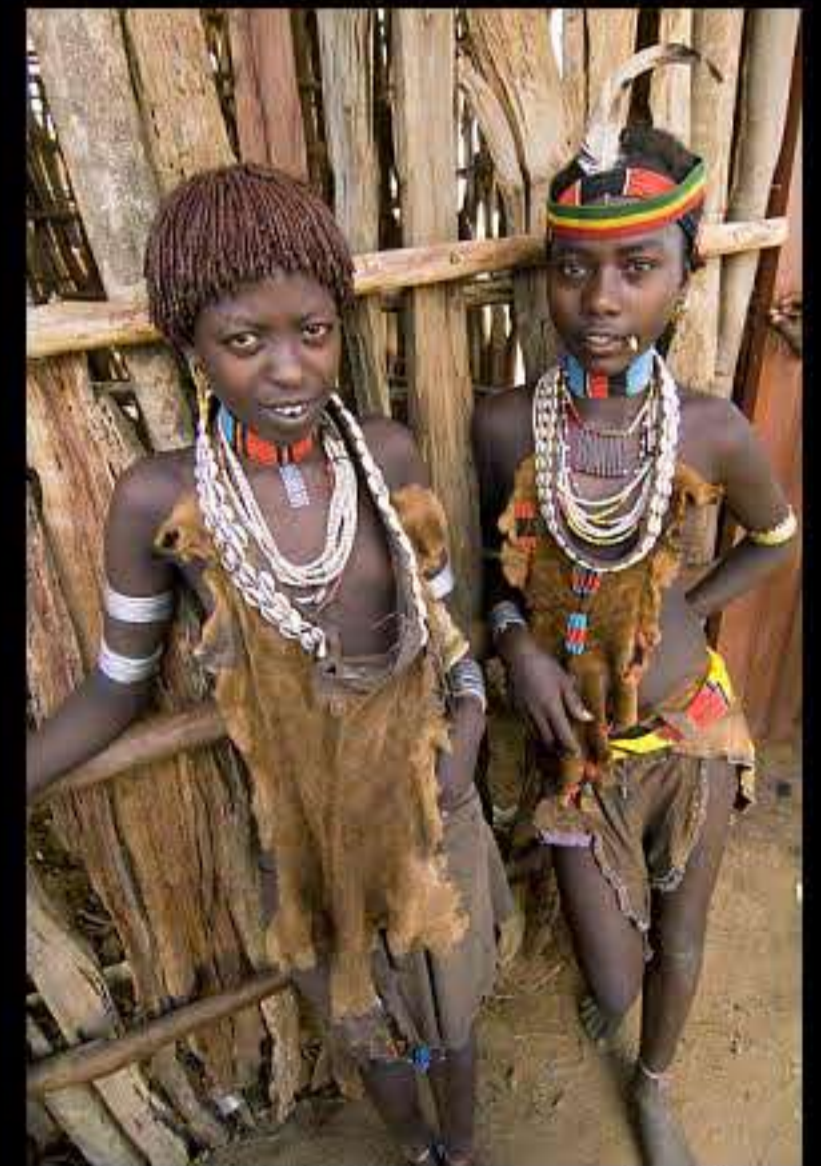
Turmi market (hammer people) 043