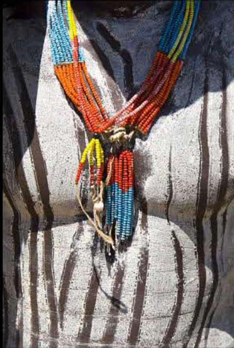
Korcho (karo people) 019