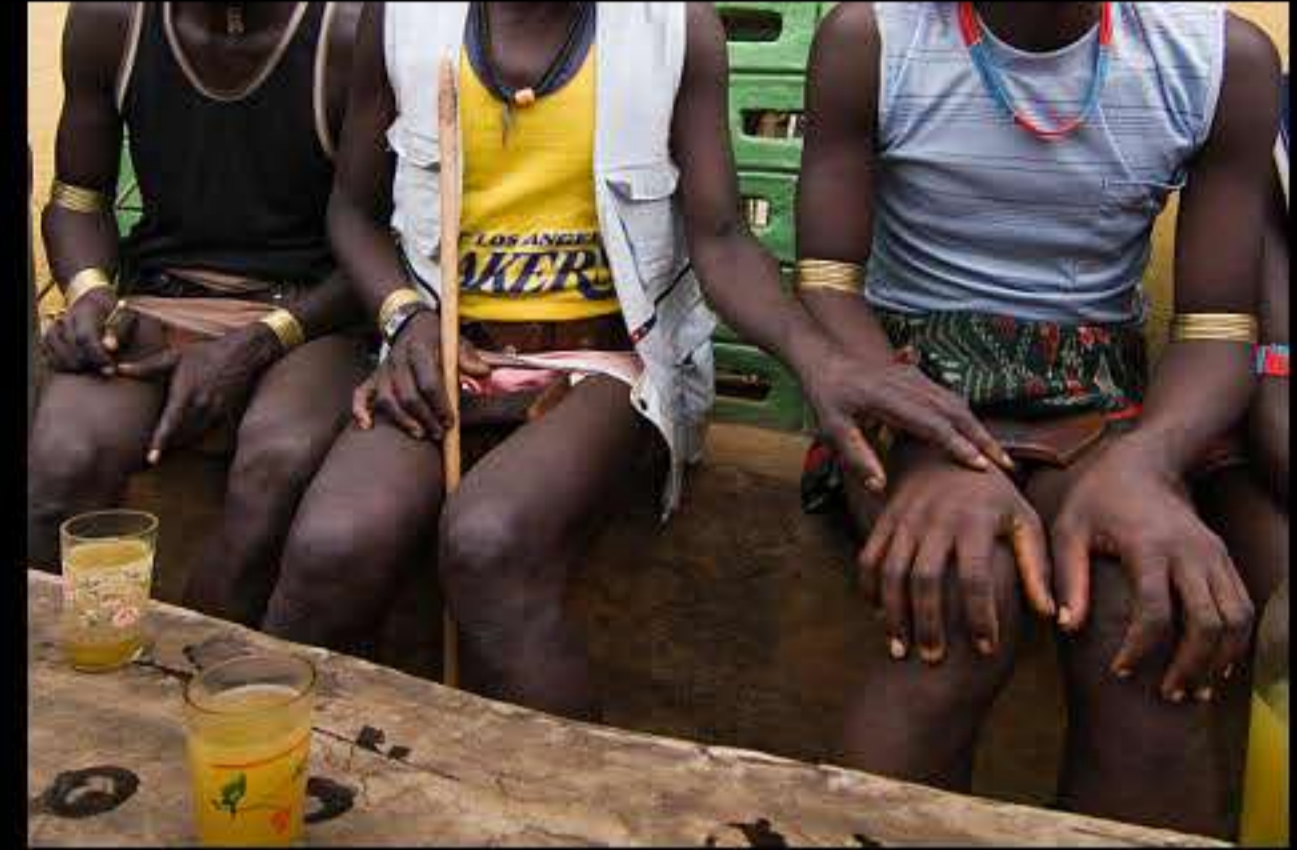
Key After, market 161