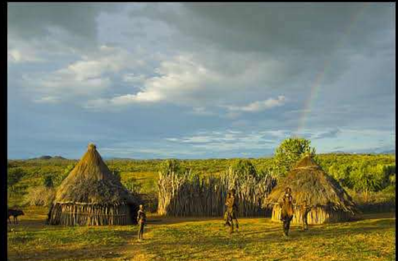
Turmi, hammer village 014