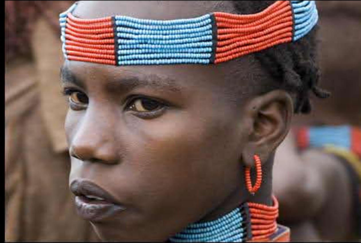
Dimeka, bull jamping (hammer) 190