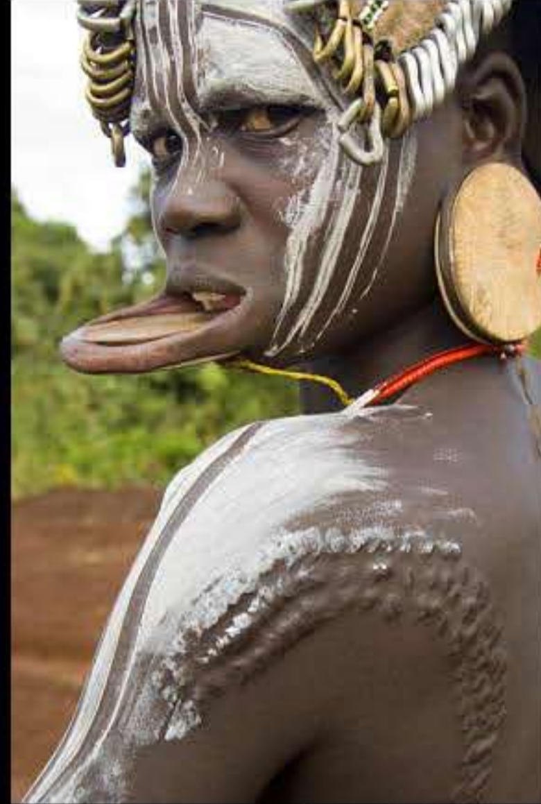
Mago park, mursi people 030