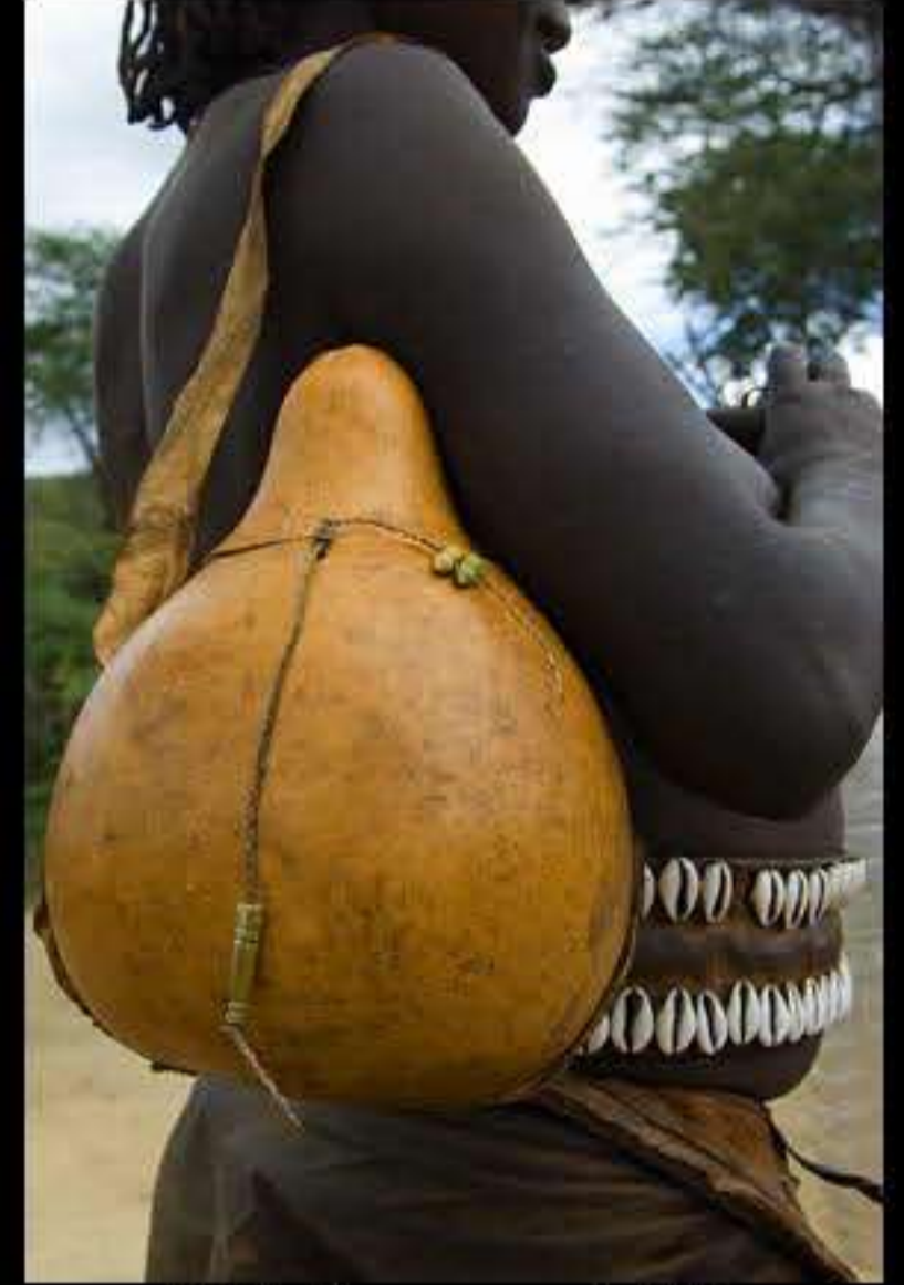
Woitto, tsamay people 110