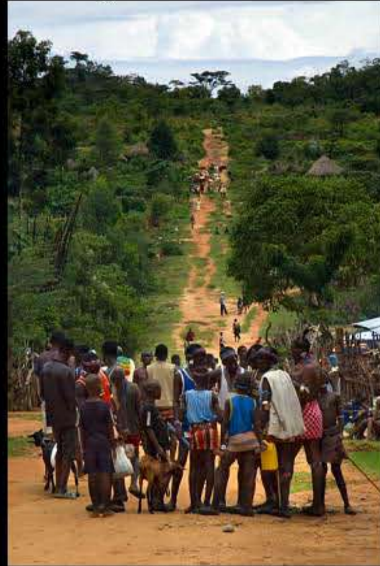
Key After, market 147