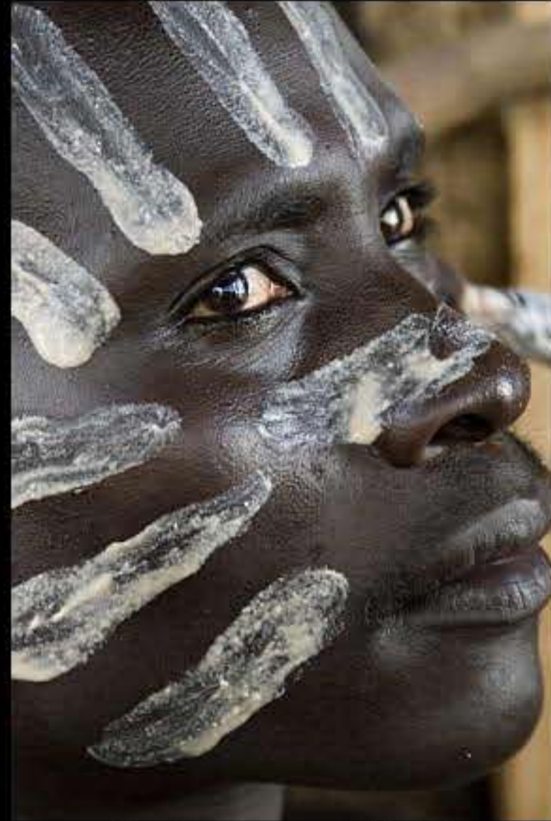
Korcho (karo people) 141