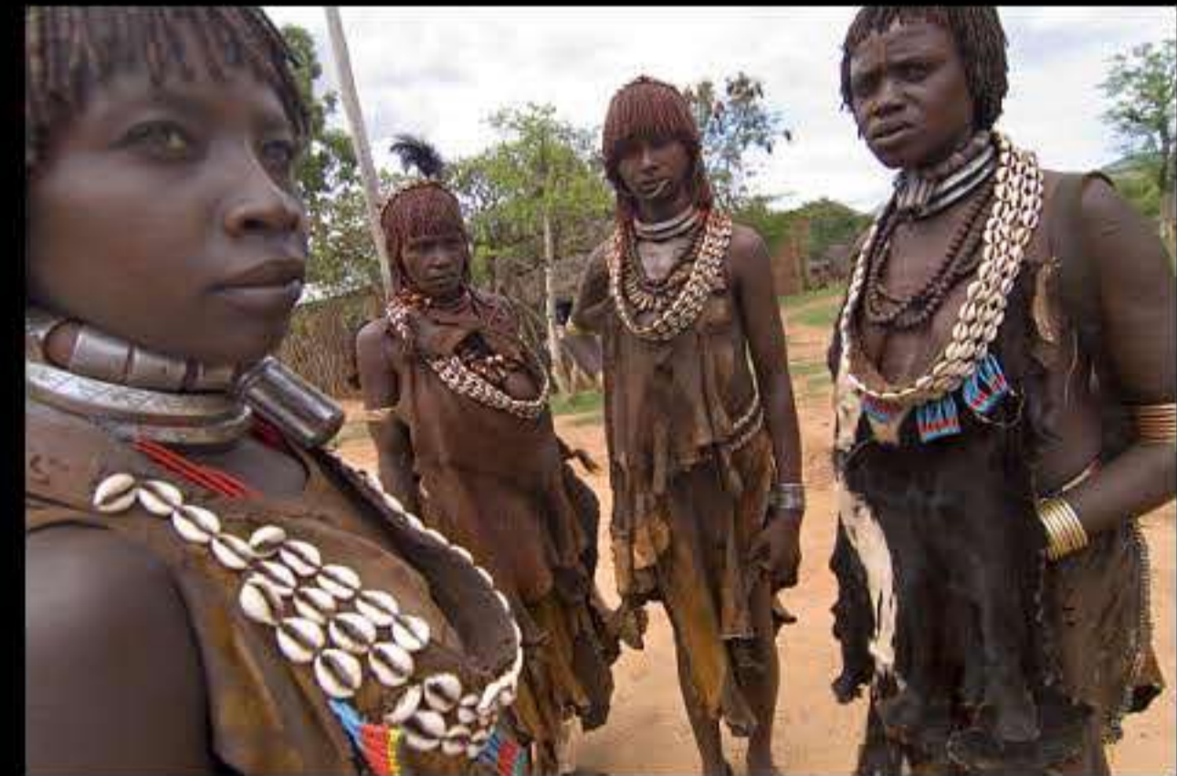
Dimeka, market (hammer people) 048