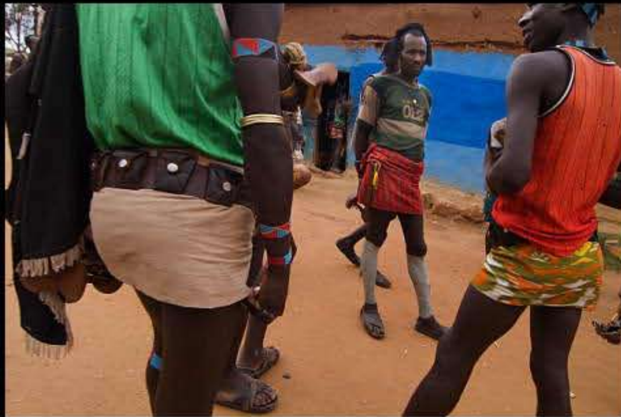
Key After, market 191