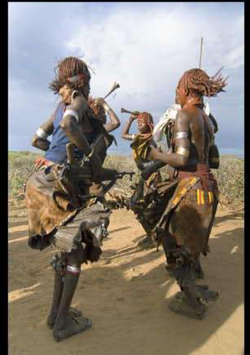
Turmi, bull jamping (hammer) 072