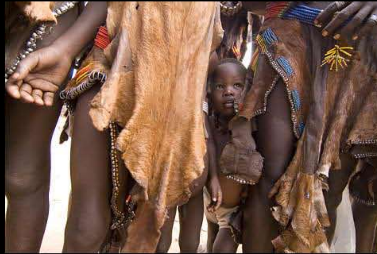
Turmi market (hammer people) 027