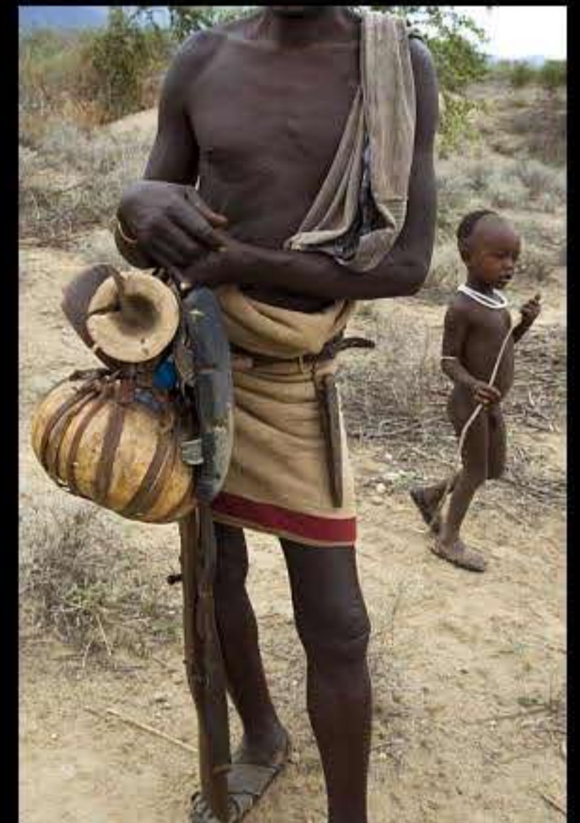
Woito valley, hammer 008