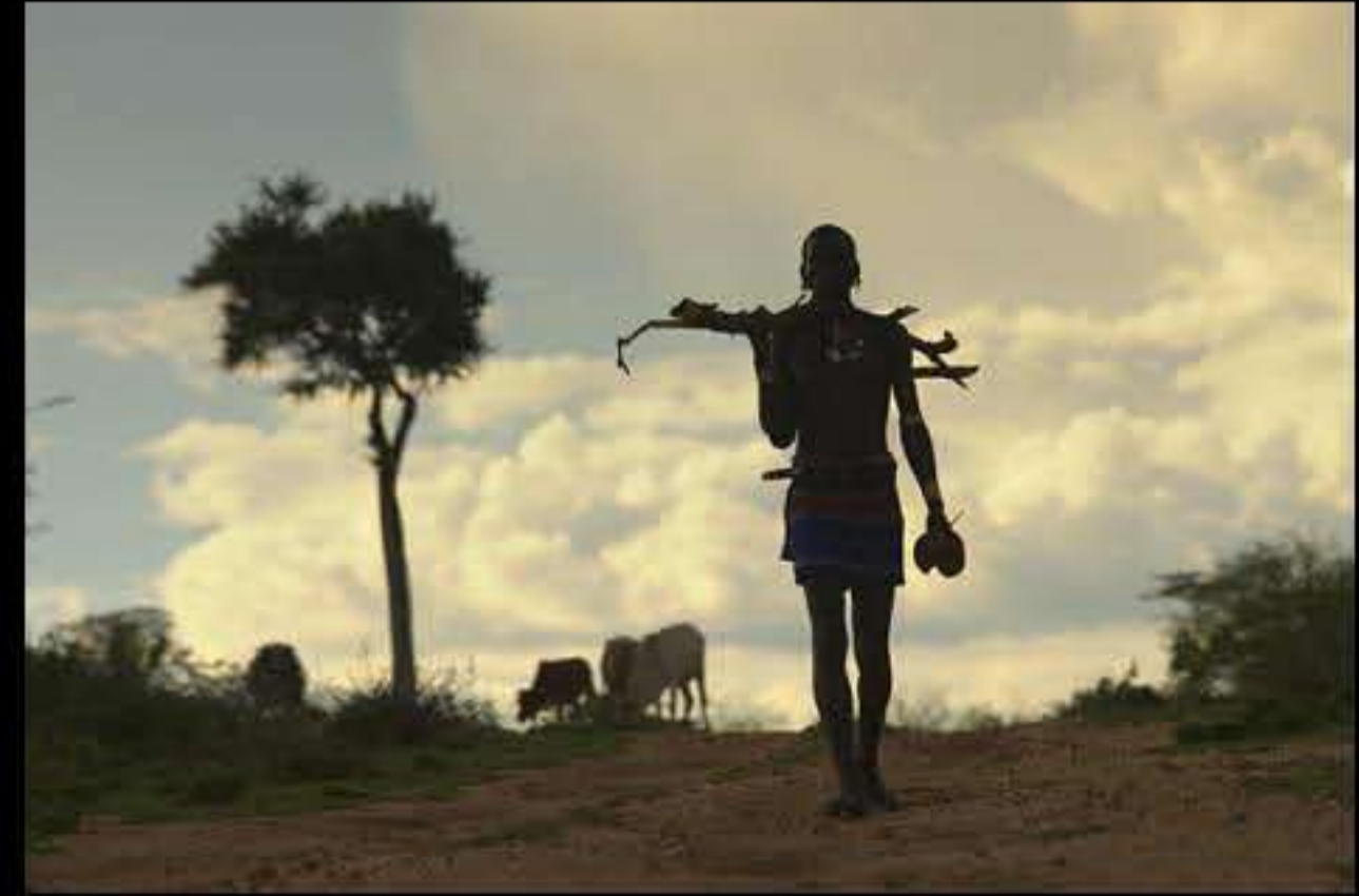
Turmi (hammer people) 099