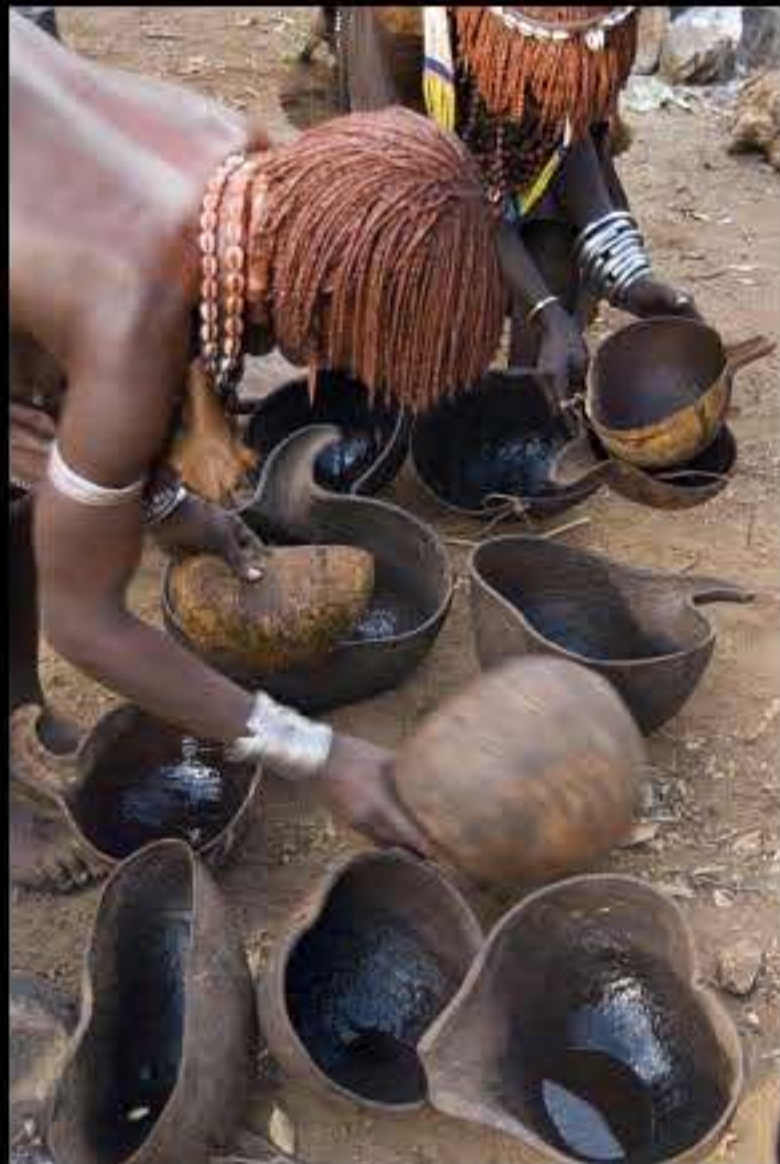
Turmi, bull jamping (hammer) 108