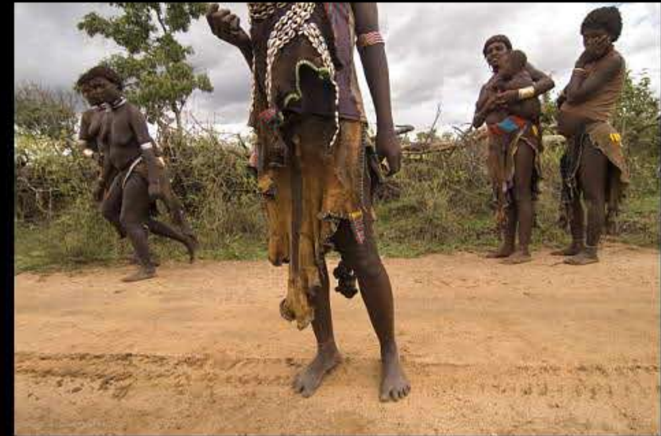
Dimeka area, Hammer people 096