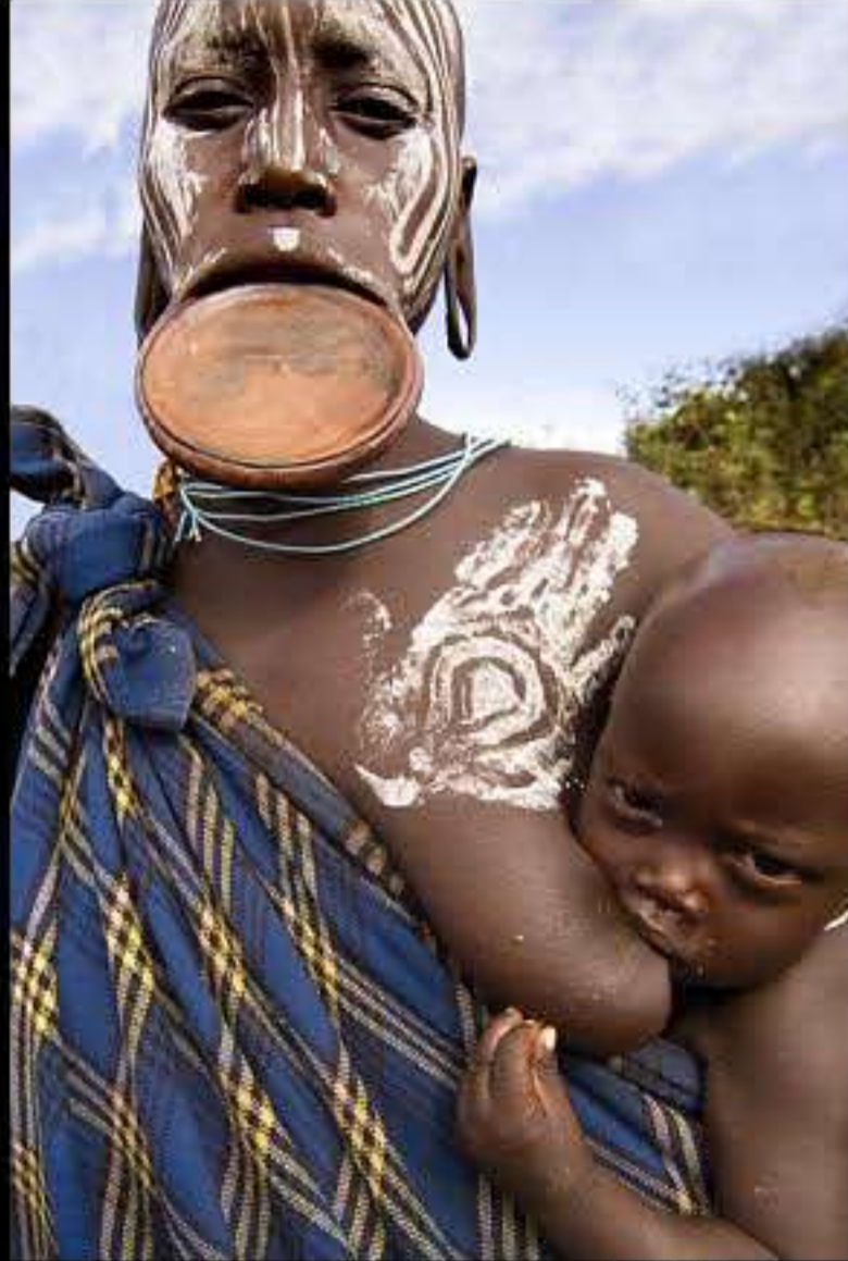
Mago park, mursi people 017