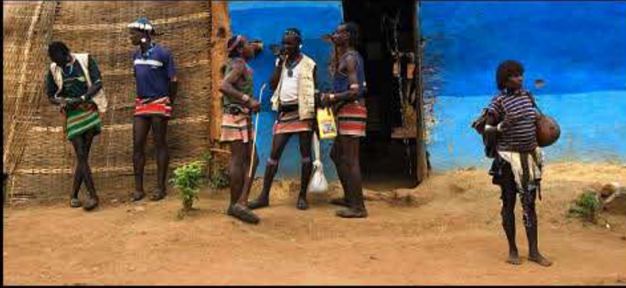
Key After, market 201