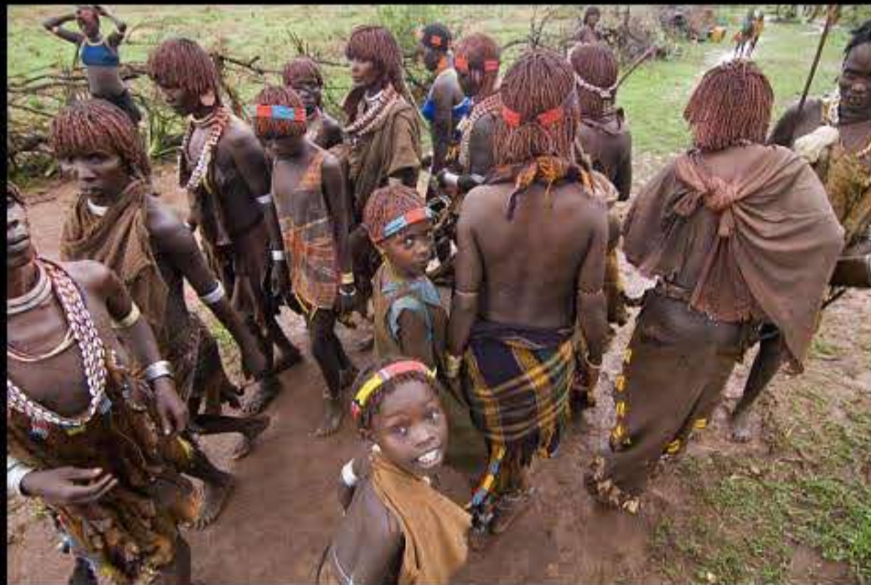
Dimeka, bull jamping (hammer) 151