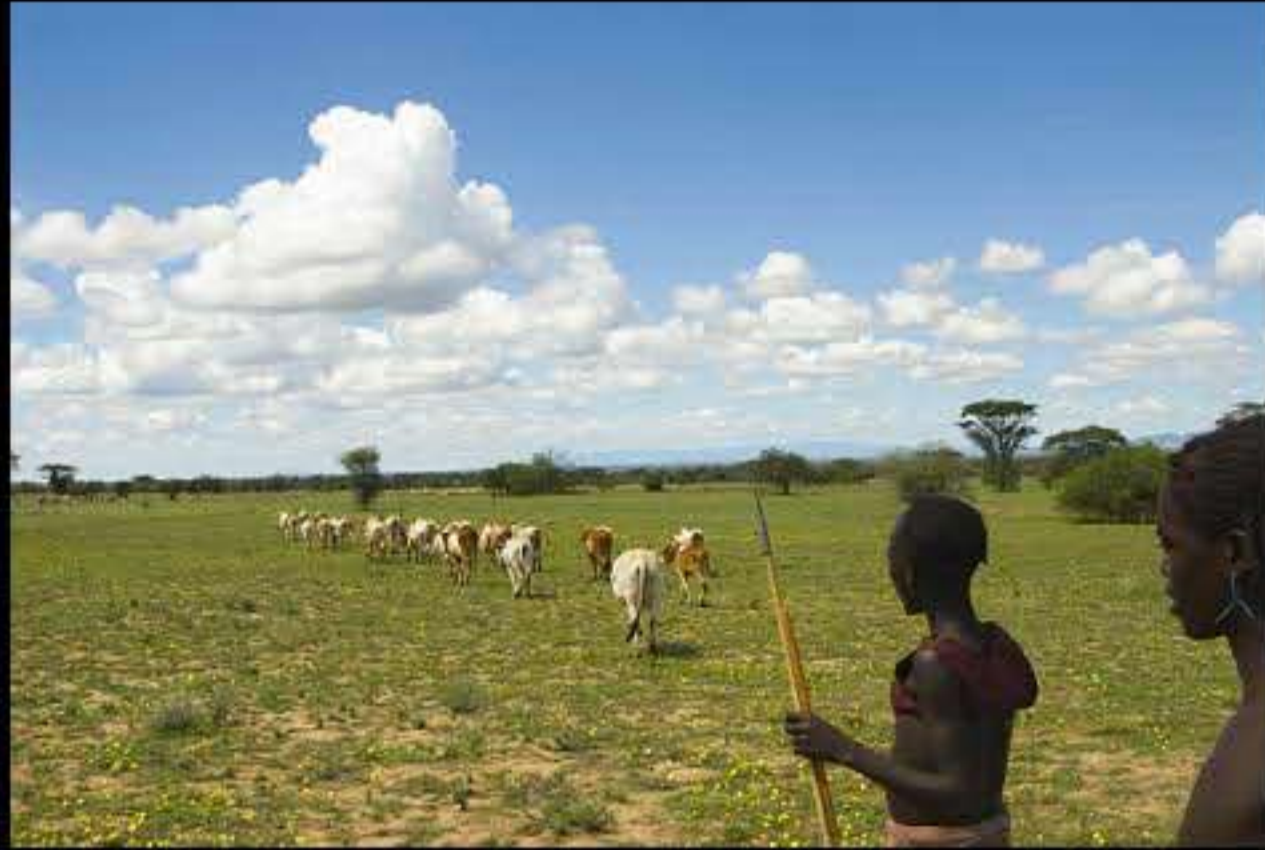
Turmi (hammer people) 055