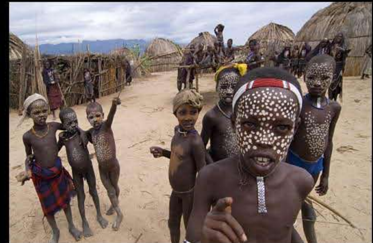
Woito valley (erbore people) 028