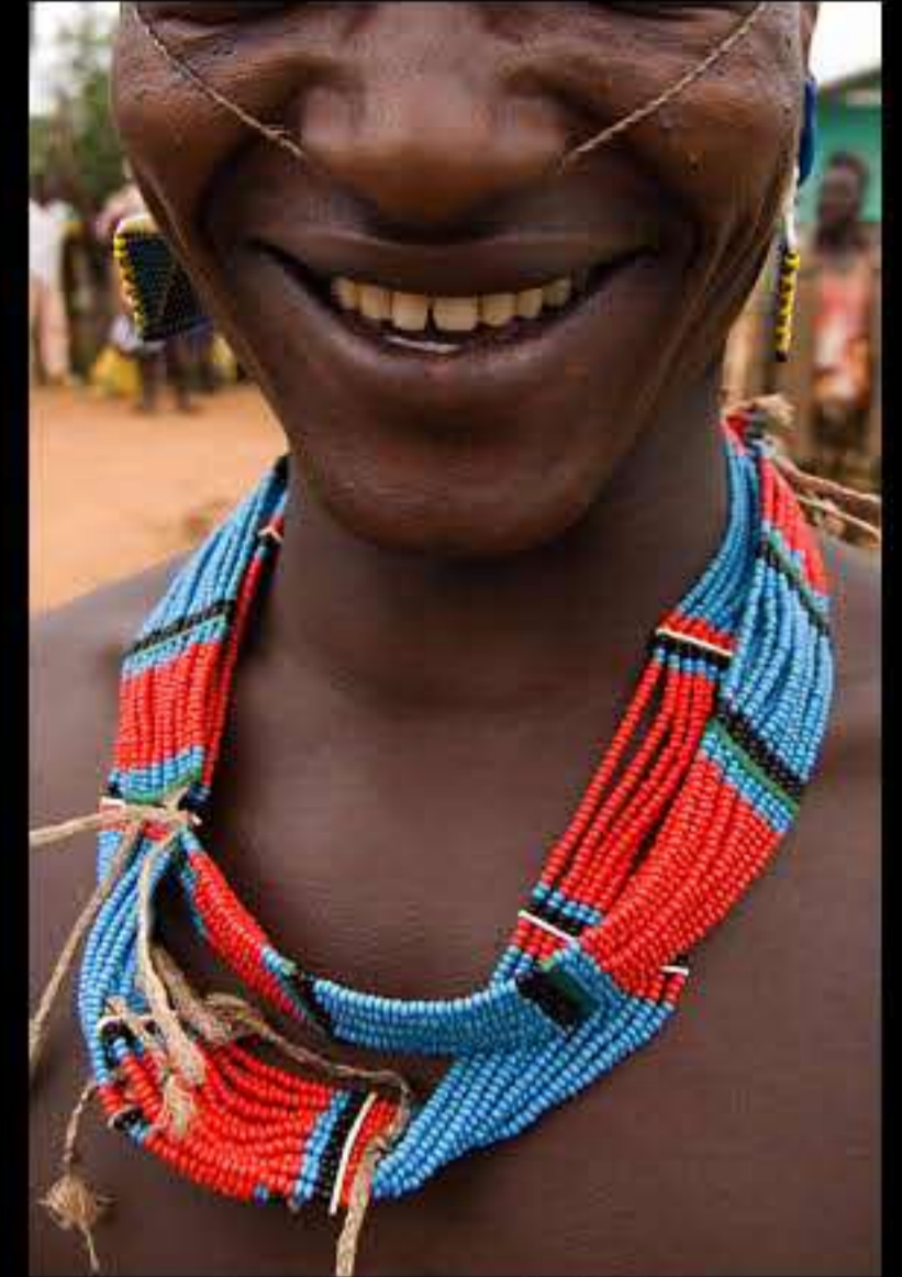
Key After, market 106