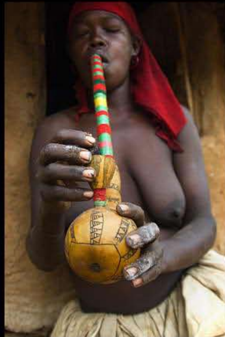
Konso, New Work village (konso) 101