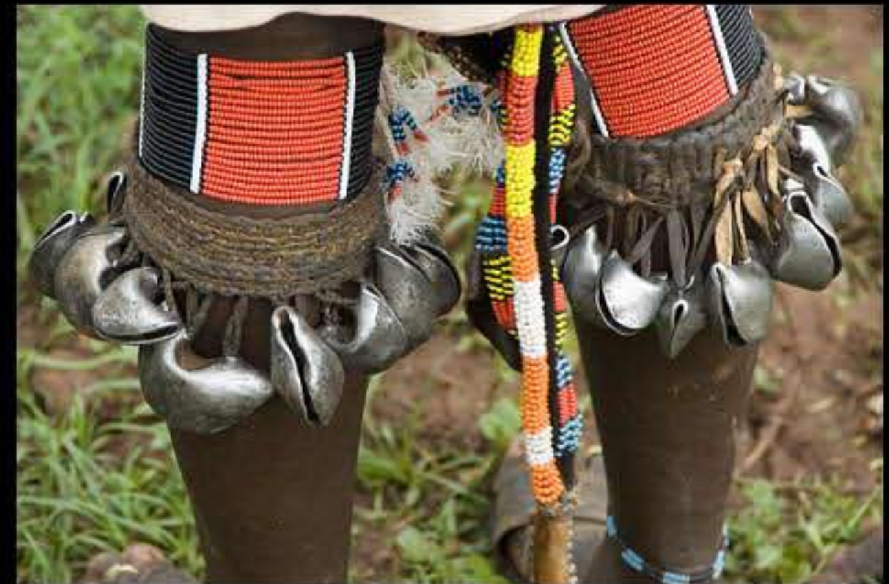
Dimeka, bull jamping (hammer) 163