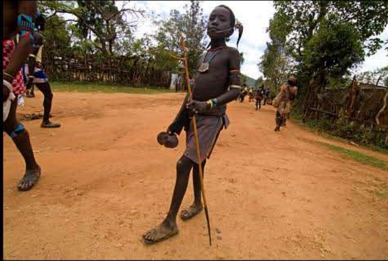
Key After, market 141