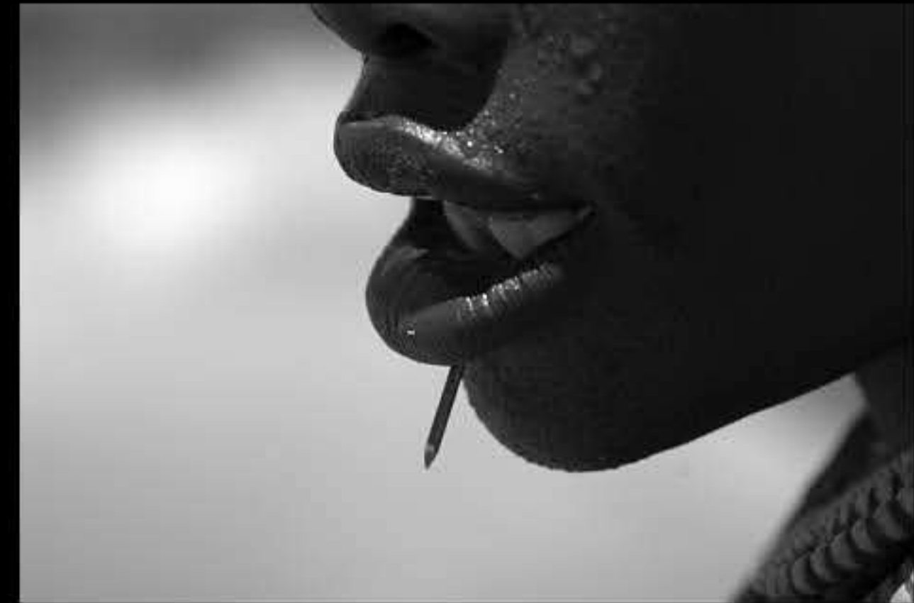
Korcho (karo people) 033