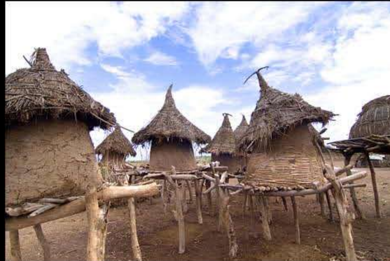
Omorate (dassanech people) 134