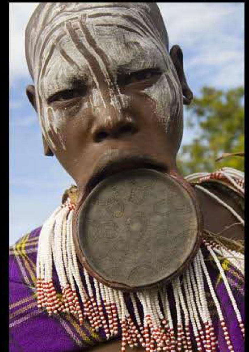
Mago park, mursi people 015