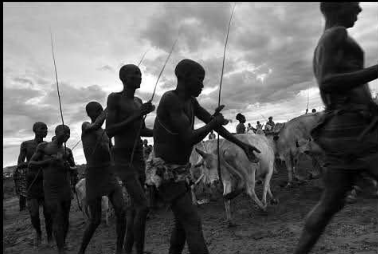
Dimeka, bull jamping (hammer) 220n