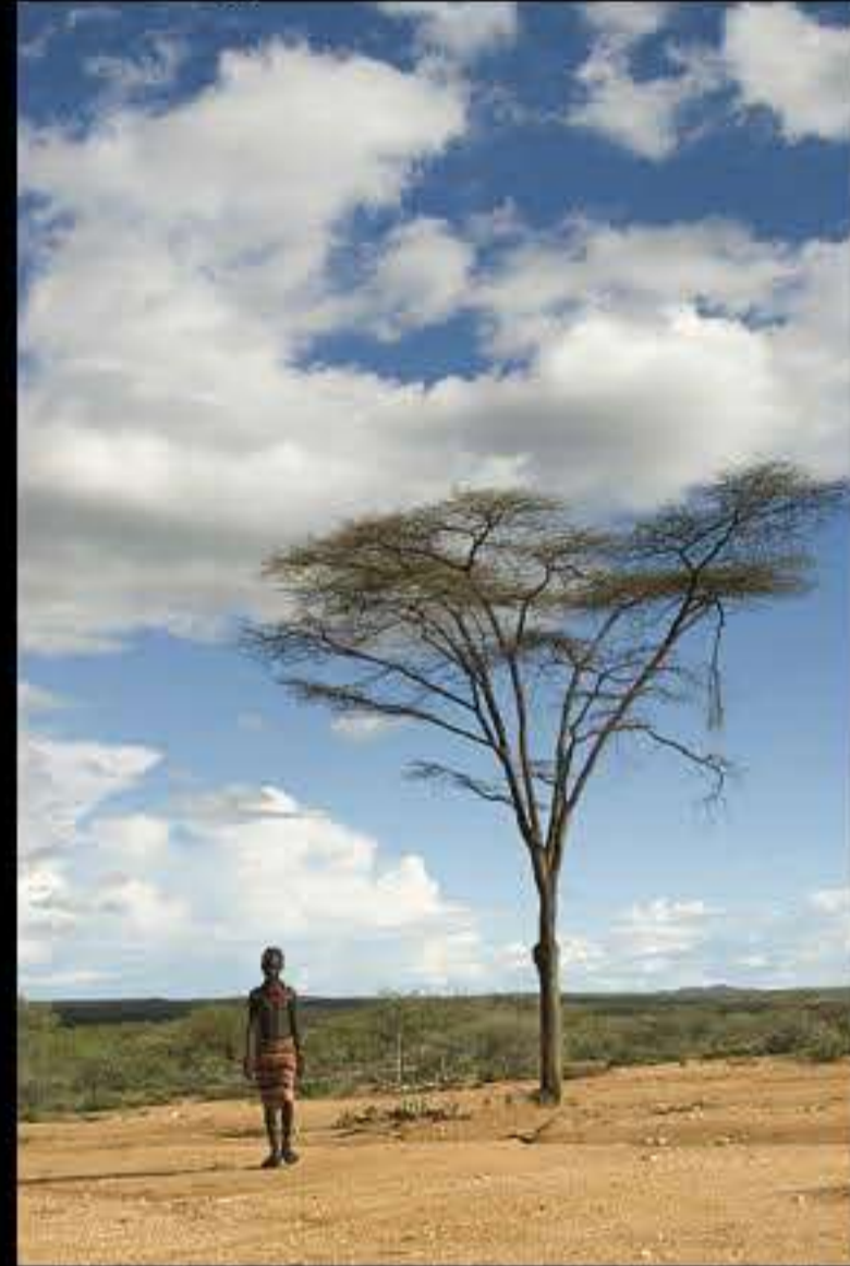
Turmi (hammer people) 068