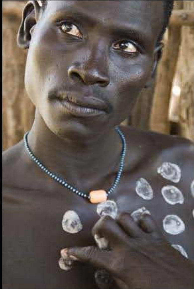
Korcho (karo people) 125