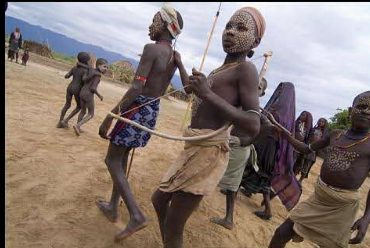
Woito valley (erbore people) 010