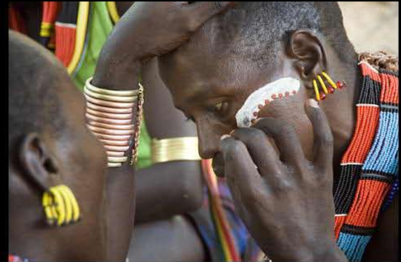
Turmi, bull jamping (hammer) 012