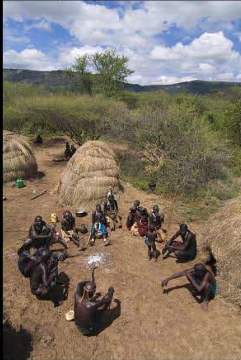
Mago park, mursi people 112