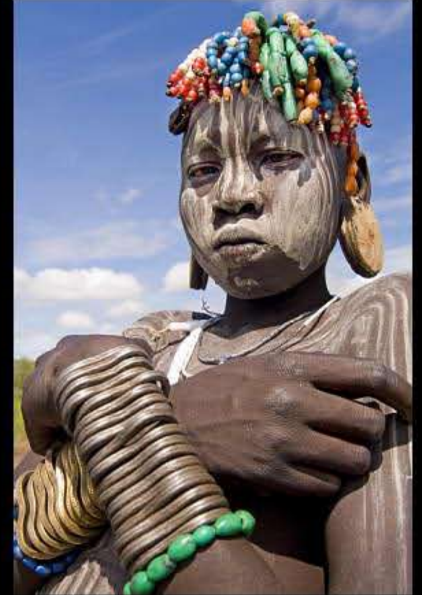
Mago park, mursi people 038