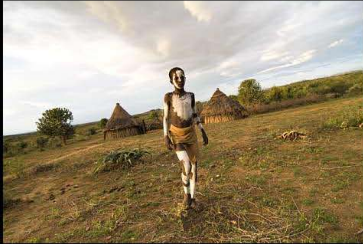
Turmi, hammer village 020