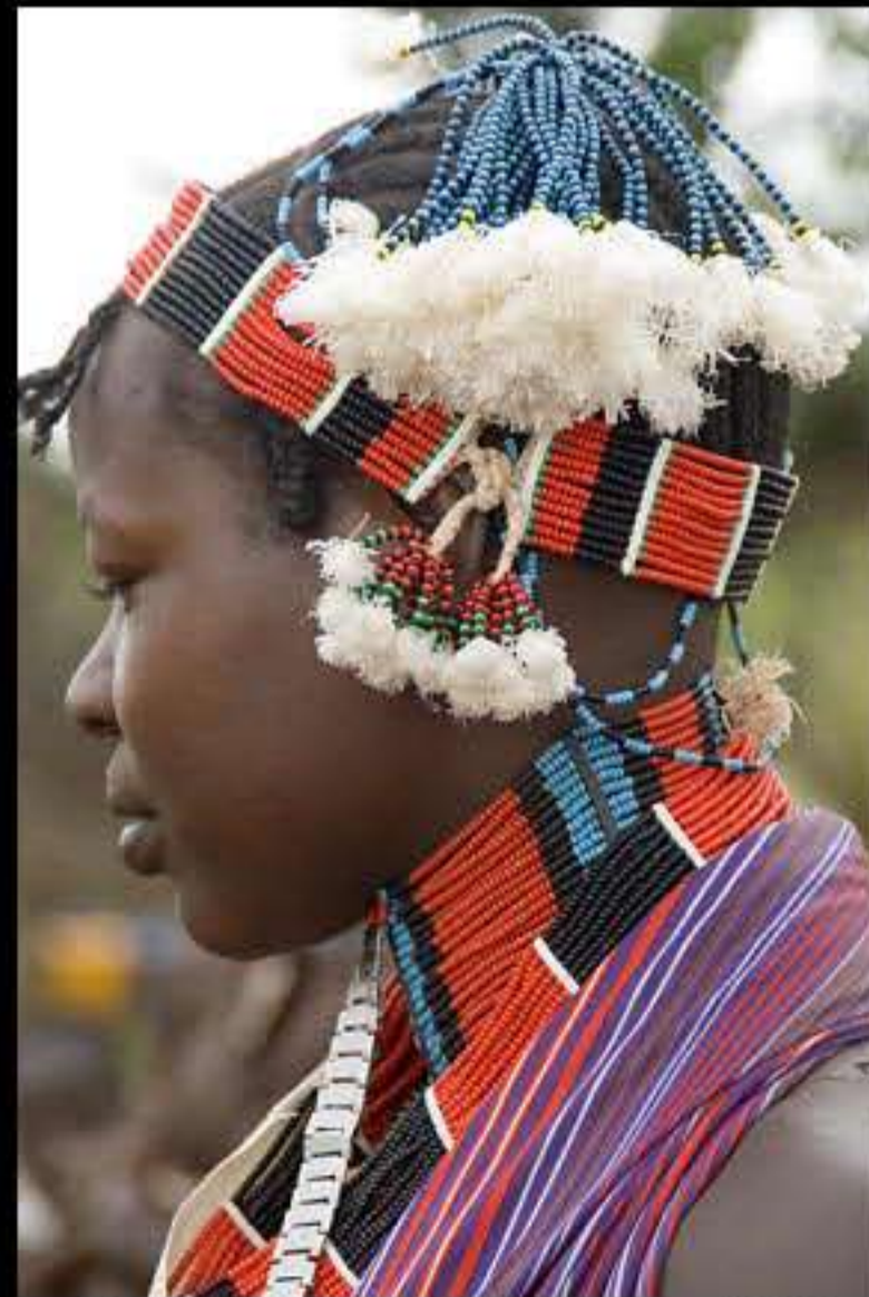
Dimeka, bull jamping (hammer) 160