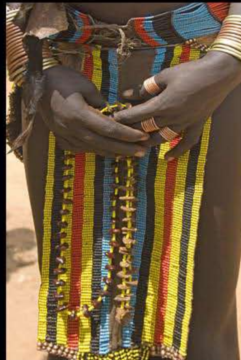
Dimeka, market (hammer people) 035