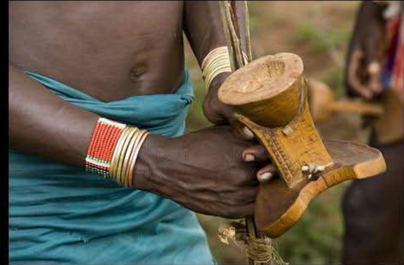
Dimeka, bull jamping (hammer) 051