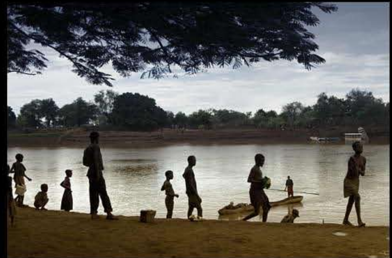
Omorate, Omo river 016